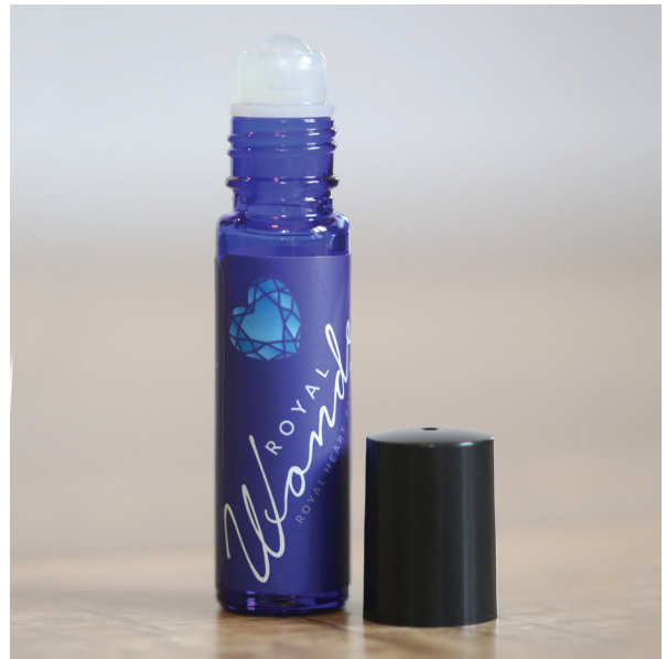
Royal Wonder™ Available In 10ml roller ball

Bergamot: Reduce pain, increase circulation, reduces emotional stress, feelings of anxiousness and depression. Lemon: detoxification (lymph, liver, kidneys...). Tangerine: soothes inflammation, relaxes spasms of muscles and nerves. Geranium: reduce inflammation, hormones, menstrual issues, menopause, level out mood swings and feelings of depression. Palmarosa: comforting and calming, reduces nervousness, anxiety, fear, resentment, anger. Ylang Ylang: improves blood flow/circulation, relaxes, reduce blood pressure, calming and uplifting to counter stress and feelings of depression, hormone balance. Roman Chamomile: (found in Earl Grey tea) calming, reduces inflammation, relief from depressive and anxious emotions. Sandalwood: reduces inflammation, stress and feelings of anxiety, stimulates brain function and memory, hormone balance—men and women. Meditative and relaxing qualities. Jasmine: assists in overcoming stress, balancing hormones, improving mood, calming, used to clear trauma and abuse. Rose Otto: opens heart pathways for healing and resolving trauma and feelings of depression. Coriander Seed: (cilantro is the leaves of this plant) ease the mind, calm fear and stimulate energy.