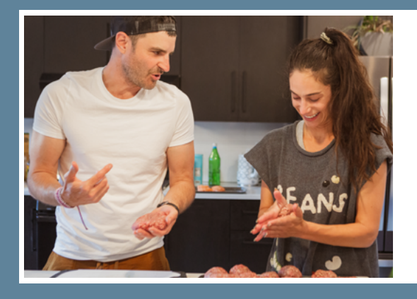
JUNE 16TH Welcome Dinner