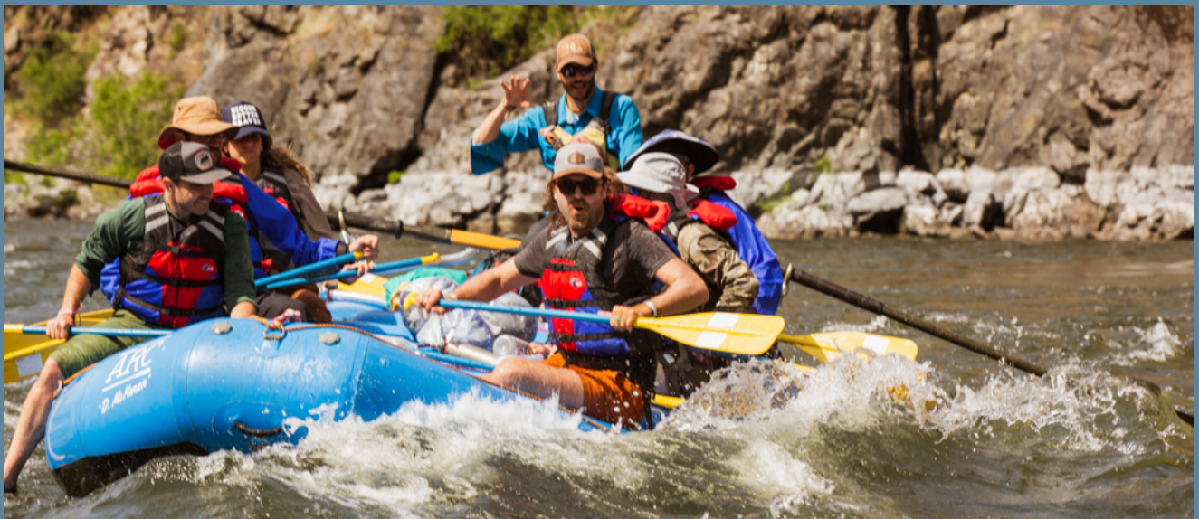
↑ TEAM PADDLE RAFT

You will have two options for vessels. One option is the team paddle boat. Anyone who wishes to ride in this boat has ample opportunity to do so.