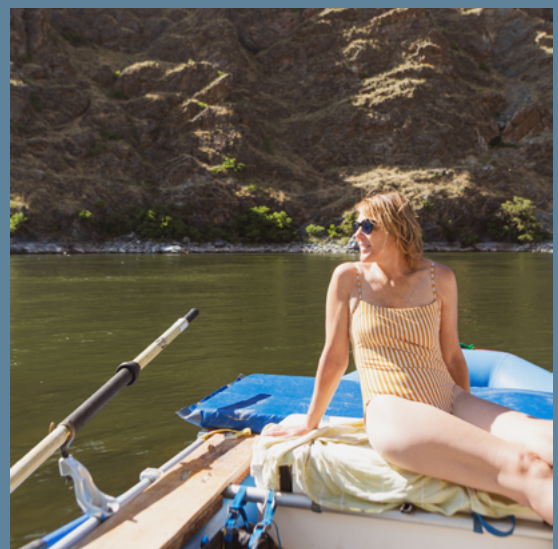
↑ CHAMPAGNE AND CAVIAR RAFT

These second boats are heavier, experience less dramatic turbulence, and are steered/paddled by the guides, with passengers relaxing and enjoying the ride.