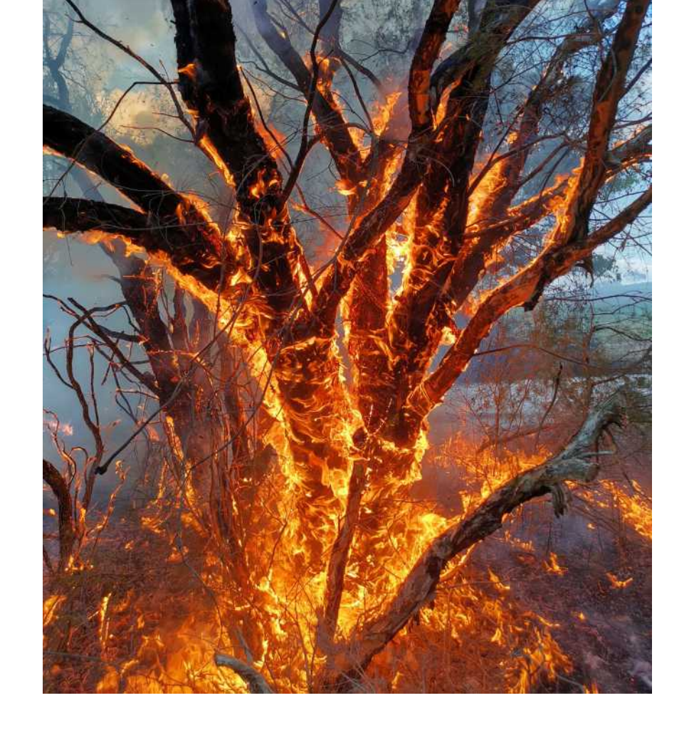
Birak – December/January