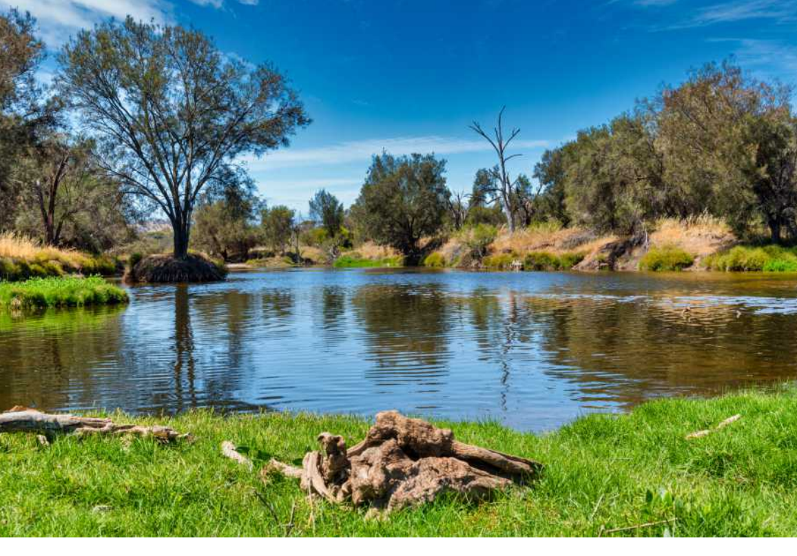
Bunuru - February/March

Bunuru is the hottest season of the year. Families move closer to the rivers for fishing and water.