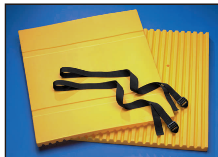
Protected with Concrete Wrap

Each Concrete Wrap kit includes: two-44" wide blankets and two locking cinch straps, enough to cover a 24" diameter concrete base.