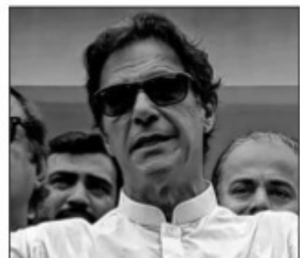
Imran Khan, leader of the PTI, is seen with supporters in Islamabad.

He added the MQM-P will not be attending the All Parties' Conference on Thursday. It will be a meeting of opposition parties led by the Pakistan Muslim League-Nawaz (PML-N) to hold talks