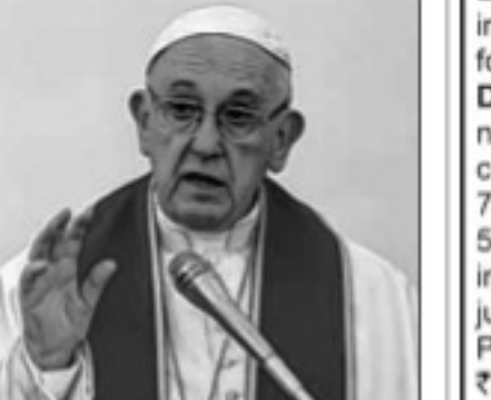
The death penalty is inadmissible because it is an attack on the inviolability and dignity of the person — New Text

The update also said the Church would "work with determination" for the abolition of the death penalty worldwide. "Recourse to the death penalty on the part of legitimate authority following a fair trial, was long considered an appropriate response to the gravity of certain crimes and an acceptable, albeit extreme, means of safeguarding the common good," says the new text.