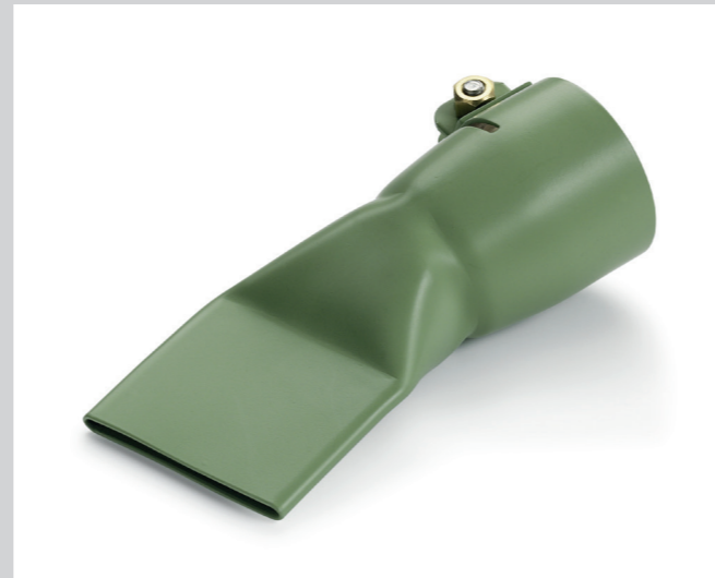
Wide slot nozzle 40 mm, PTFE coated Article No: 107.135