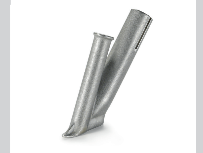
Speed welding nozzle Ø 4 mm * Article No: 106.990