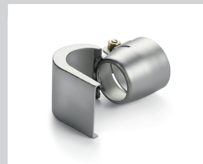
Spoon reflector, 27 x 35 mm Article No: 107.307