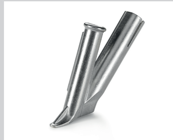
Speed welding nozzle Ø 5 mm * Article No: 106.991