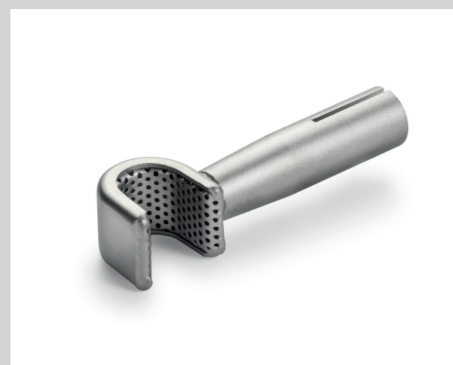
Sieve reflector (Ø 8.25 mm), 10 x 12 mm * Article No: 107.324