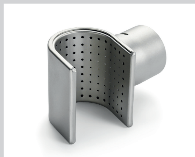
Sieve reflector, 50 x 35 mm Article No: 107.337