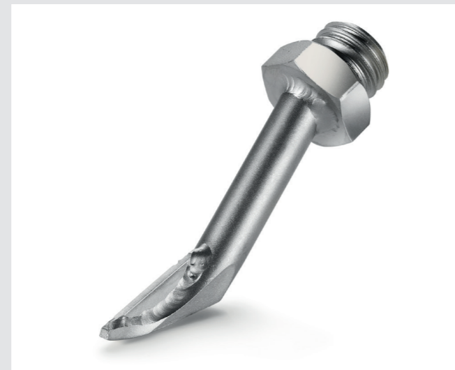
Tacking nozzle Article No: 106.988