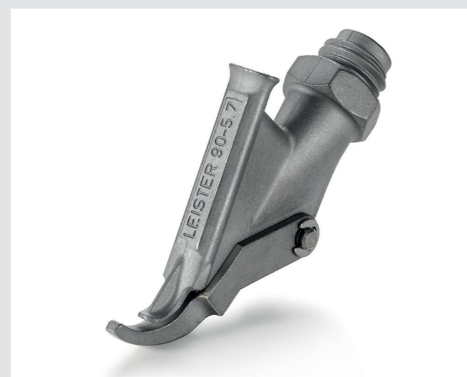
Drawing nozzle with tacking tip, triangular shaped 5.7 mm Article No: 113.670