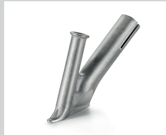
Speed welding nozzle, with small air-slide, Ø 3 mm * Article No: 105.431