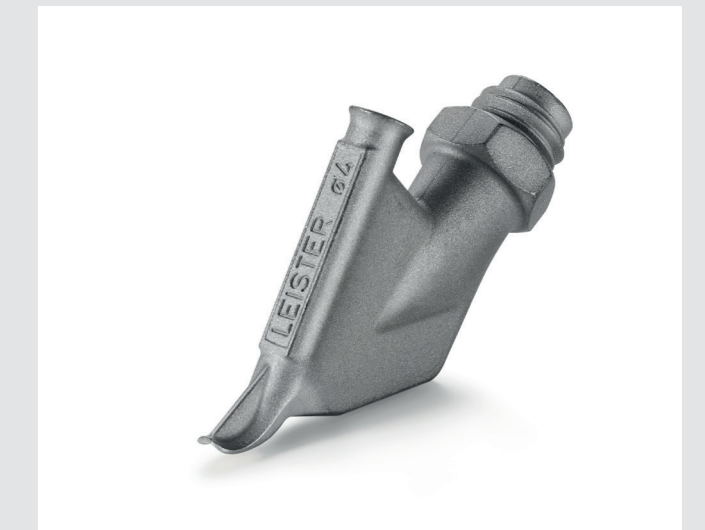
Drawing nozzle without tacking tip, Ø 4 mm Article No: 113.874