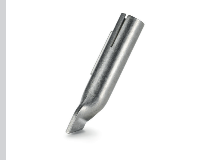
Tacking nozzle * Article No: 106.996