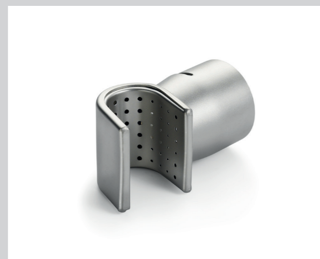
Sieve reflector, 35 x 20 mm Article No: 107.338