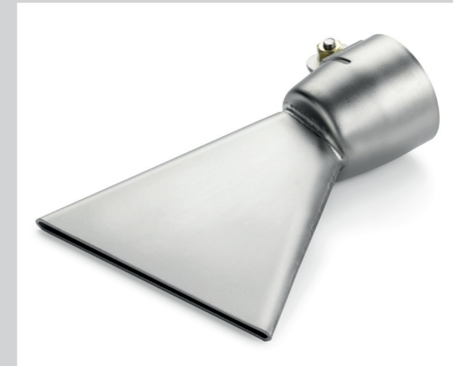
Wide slot nozzle 80 mm, for bitumen Article No: 107.131