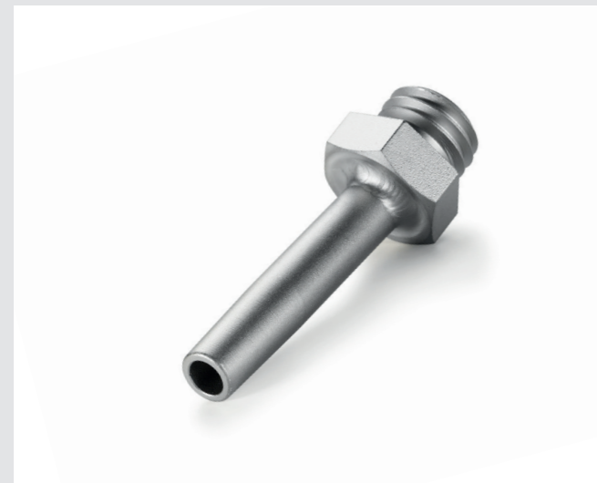
Tubular nozzle Ø 5 mm Article No: 105.622