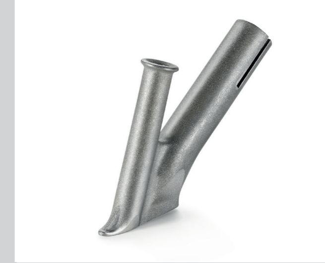
Speed welding nozzle Ø 3 mm * Article No: 106.989