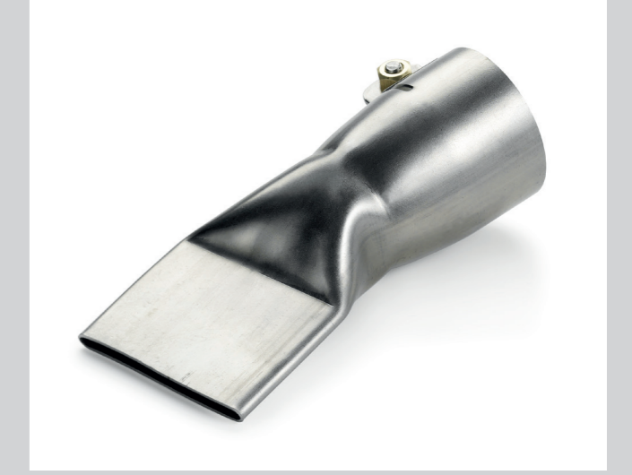
Wide slot nozzle 40 mm Article No: 107.132