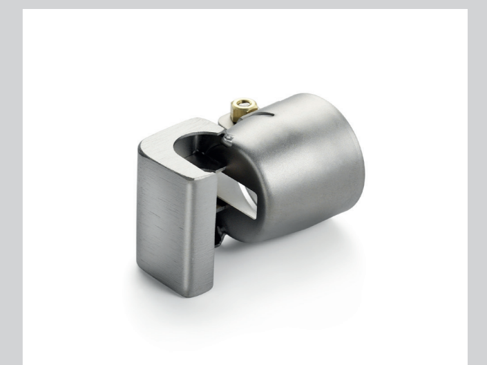
Soldering reflector, 17 x 34 mm Article No: 107.339