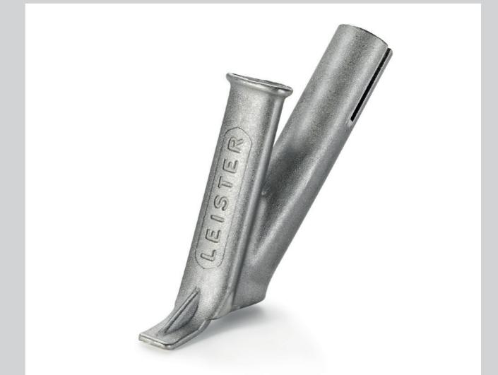
Speed welding nozzle, triangular shaped, 7 mm * Article No: 106.993