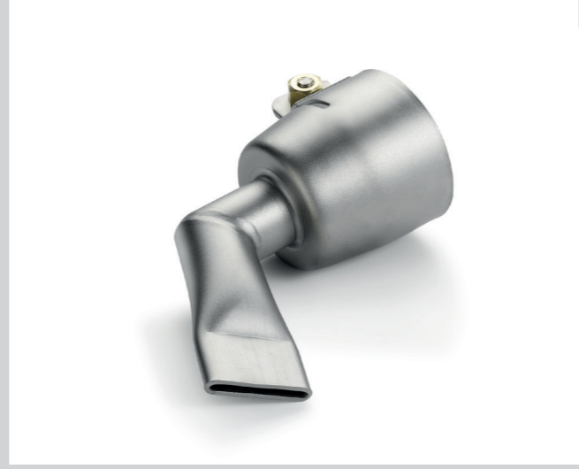
Angled nozzle 20 mm, 60° bent Article No: 107.125 (right) Article No: 105.503 (left)