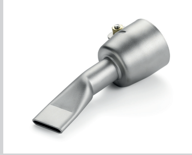
Wide slot nozzle 20 mm, bent, angled Article No: 107.123