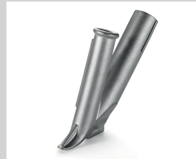
Speed welding nozzle, with small air-slide, Ø 5 mm * Article No: 105.433