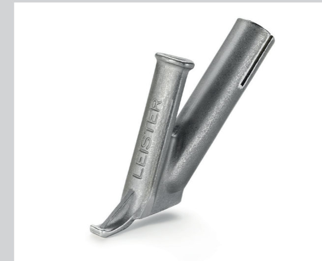
Speed welding nozzle, triangular shaped, 5.7 mm * Article No: 106.992