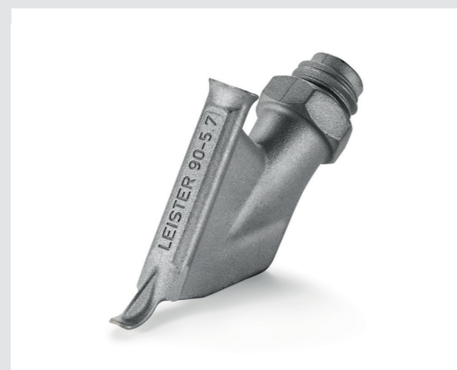
Drawing nozzle without tacking tip, triangular shaped 5.7 mm Article No: 113.877