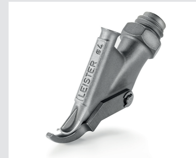
Drawing nozzle with tacking tip, Ø 4 mm Article No: 113.399