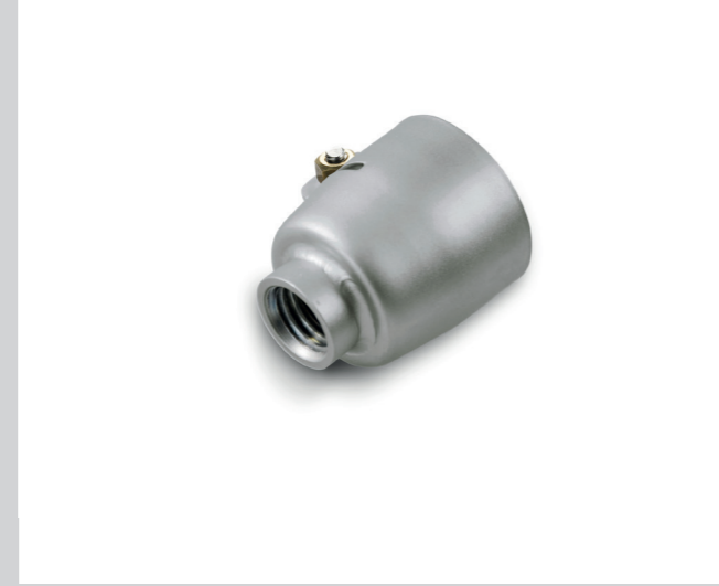
Nozzle adapter Ø 31.5 mm, tread M14 (for screw-on nozzles) Article No: 143.833