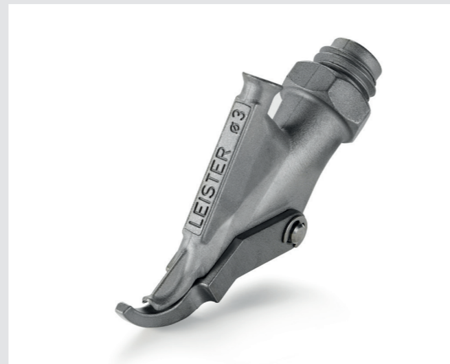
Drawing nozzle with tacking tip, Ø 3 mm Article No: 113.666