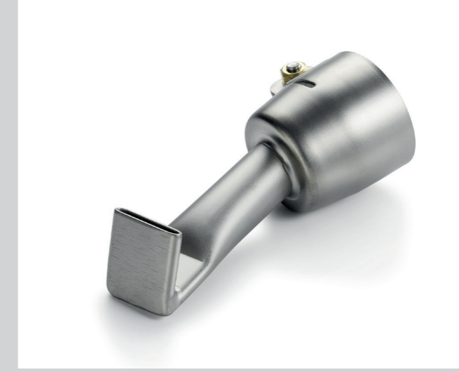
Wide slot nozzle 20 mm, straight jaw, 120° bent at right angle Article No: 105.492