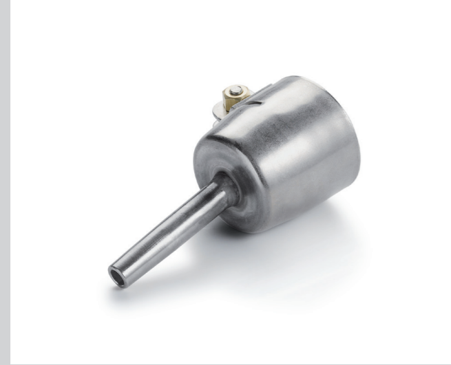
Tubular nozzle Ø 5 mm Article No: 100.303