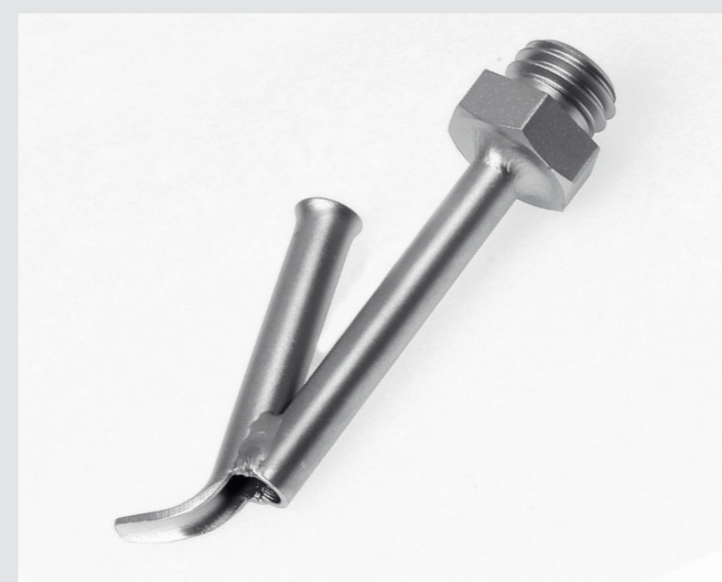
Drawing nozzle, for fluor plastics Ø 4 mm Article No: 126.552