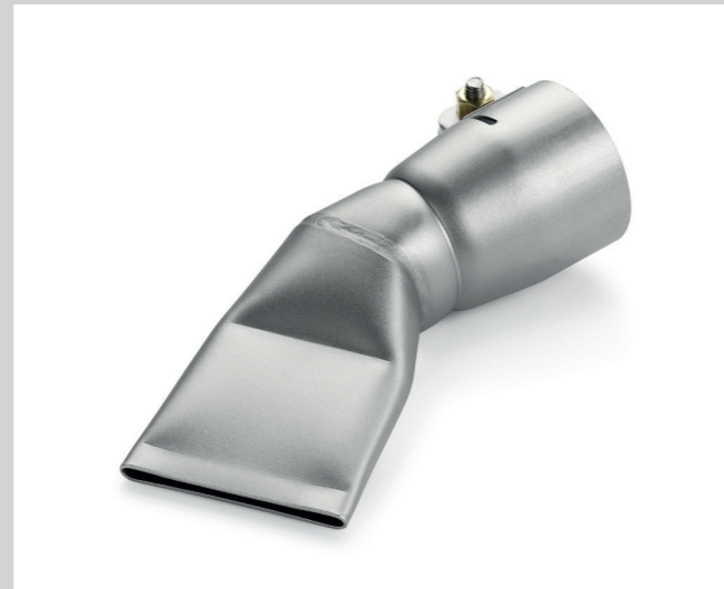
Wide slot nozzle 40 mm, 60° bent Article No: 107.130