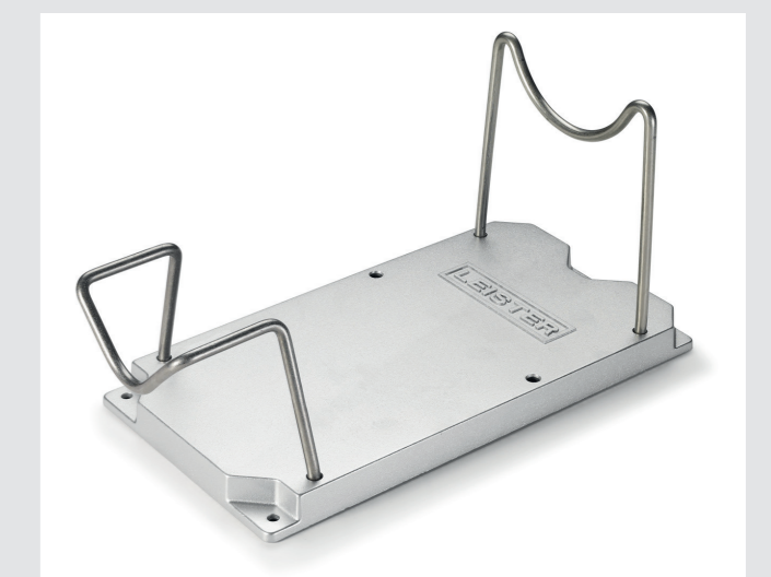
Tool rest TRIAC Article No: 107.348