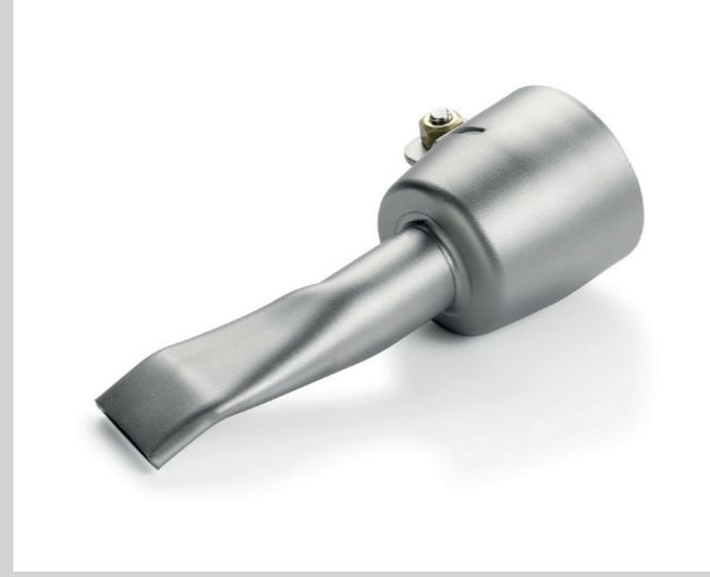
Wide slot nozzle 20 mm, bent and angled Article No: 105.487