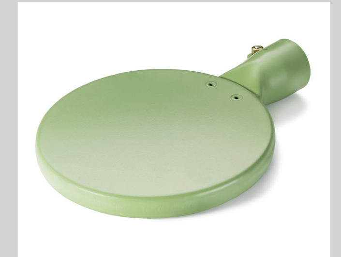
Welding mirror 135 mm, PTFE coated Article No: 107.344