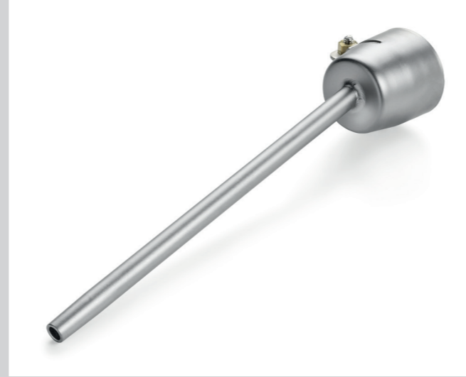
Extension nozzle Ø 5 mm, 150 mm Article No: 106.982