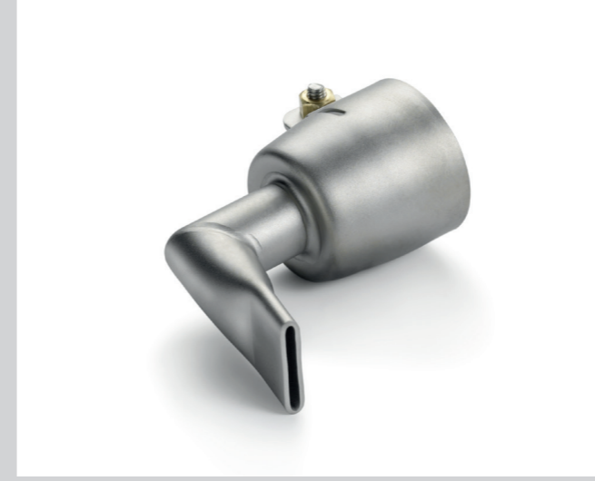
Angled nozzle 20 mm, 90° bent Article No: 107.124