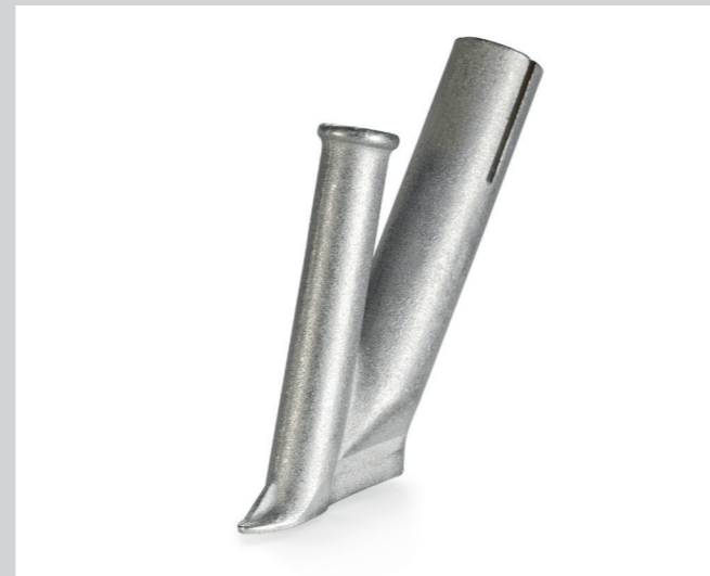
Speed welding nozzle, with small air-slide, Ø 4 mm * Article No: 105.432