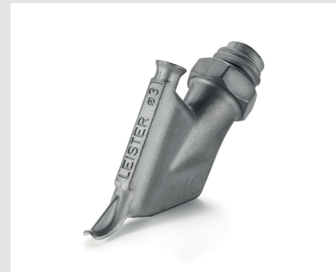
Drawing nozzle without tacking tip, Ø 3 mm Article No: 113.876