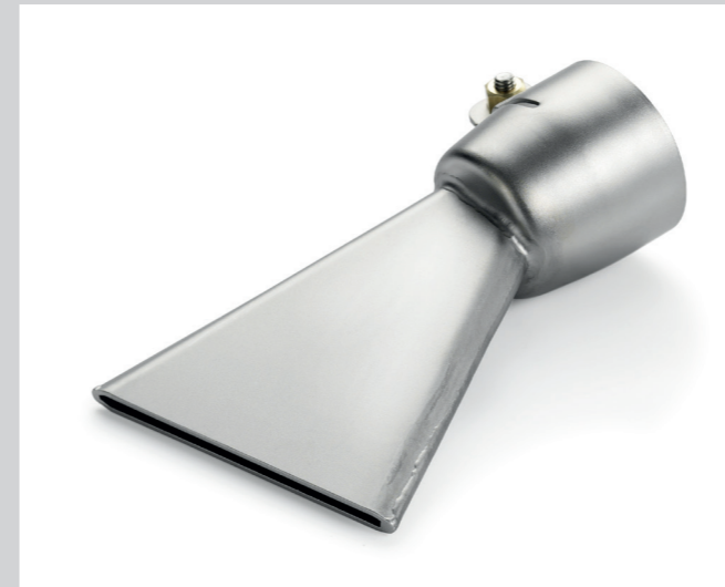
Wide slot nozzle 60 mm, for bitumen Article No: 107.129