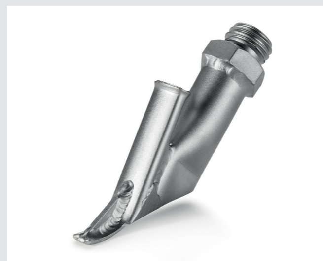
Drawing nozzle, triangular shaped 7 mm Article No: 106.986