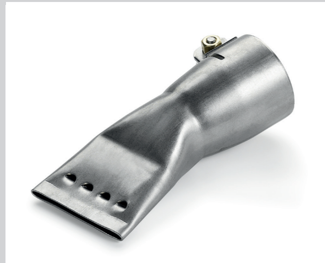
Wide slot nozzle 40 mm, perforated Article No: 107.133