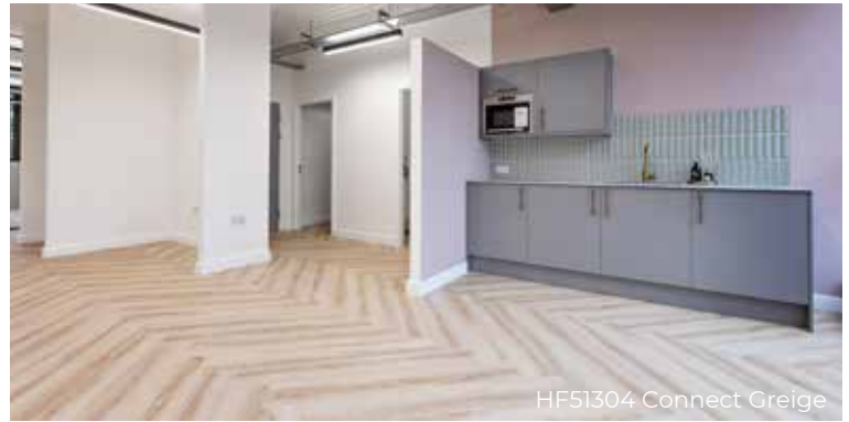
HF51304 Connect Greige