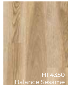
HF4350 Balance Sesame