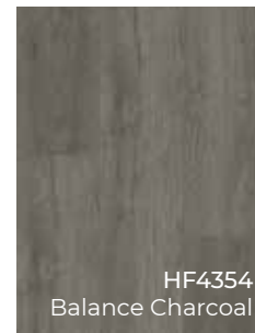
HF4354 Balance Charcoal