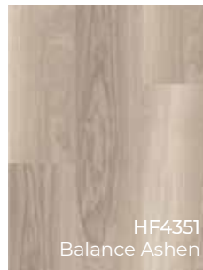
HF4351 Balance Ashen