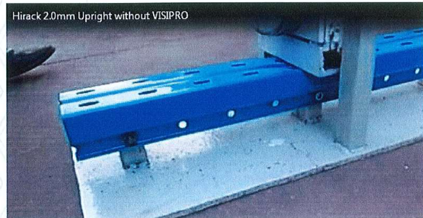
This photo shows the upright during the impact.