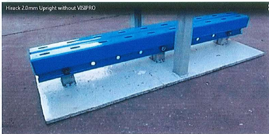
This photo shows the upright without VISIPRO prior to impact.