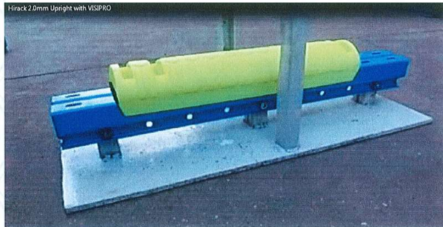
This photo shows the VISIPRO fitted to upright prior to impact.