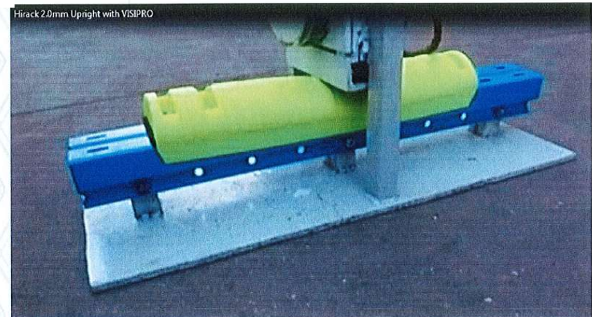
This photo shows the VISIPRO during the impact. Note the deflection of the VISIPRO as the impact force is absorbed.