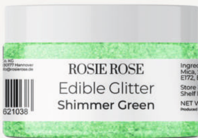
SHIMMER GREEN ART.-Nr. RR082