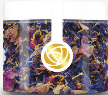
SAPPHIRE BLUE ART.-Nr. RR063