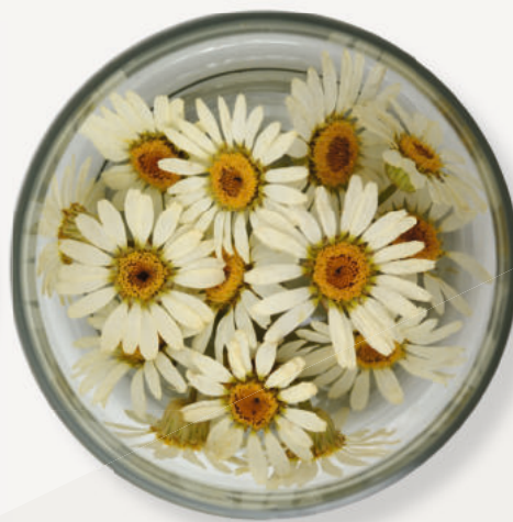
DAISIES ART.-Nr. RR030