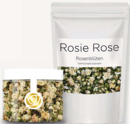
VINTAGE WHITE ART.-Nr. RR035 / RR009