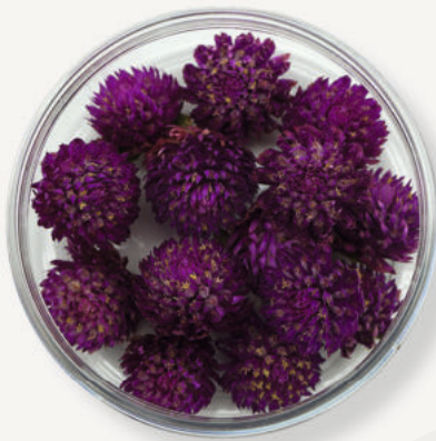
PURPLE // ART.-Nr. RR096