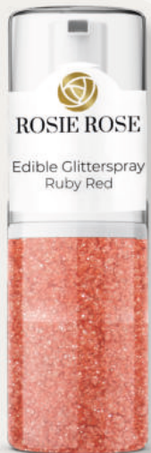
RUBY RED ART.-Nr. RR067