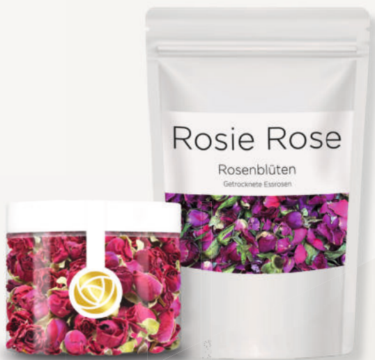
PURE PINK ART.-Nr. RR036 / RR010