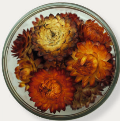
COPPER // ART.-Nr. RR100