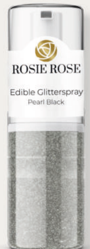
PEARL BLACK ART.-Nr. RR074