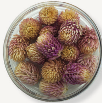
PINK // ART.-Nr. RR094