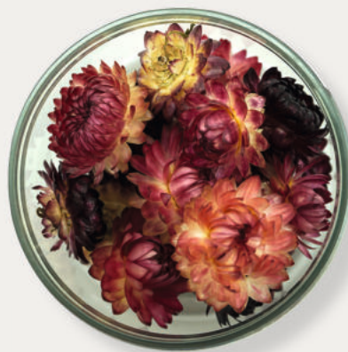
LAVENDER // ART.-Nr. RR101