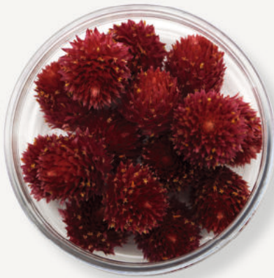
RED // ART.-Nr. RR095