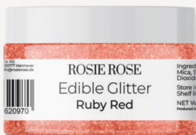
RUBY RED ART.-Nr. RR081