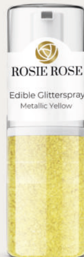
METALLIC YELLOW ART.-Nr. RR073