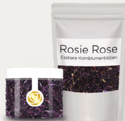
CORNFLOWERS „VIOLET“ ART.-Nr. RR022 / RR047