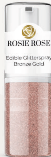
BRONZE GOLD ART.-Nr. RR069