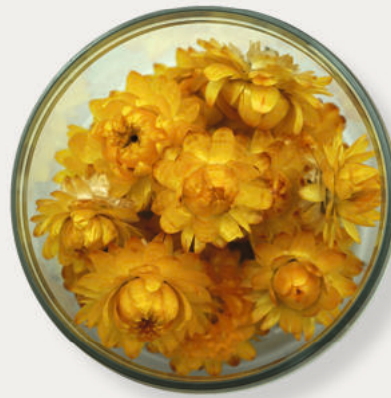
YELLOW // ART.-Nr. RR099