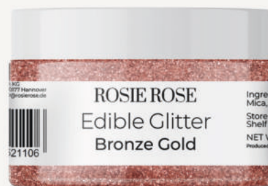
BRONZE GOLD ART.-Nr. RR083