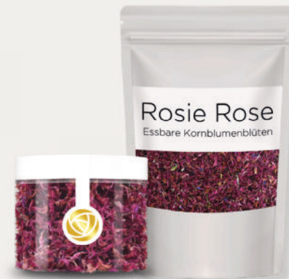
CORNFLOWERS „RED“ ART.-Nr. RR019 / RR044