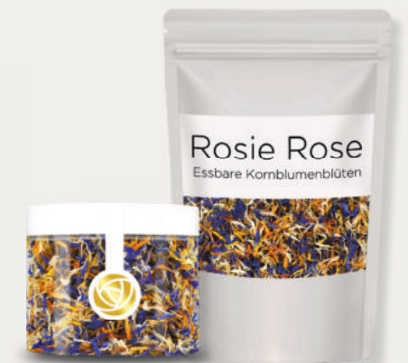
CORNFLOWERS „TROPICAL“ ART.-Nr. RR025 / RR049