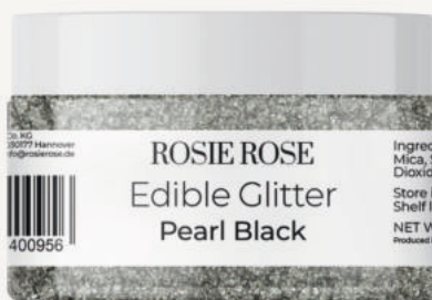
PEARL BLACK ART.-Nr. RR088