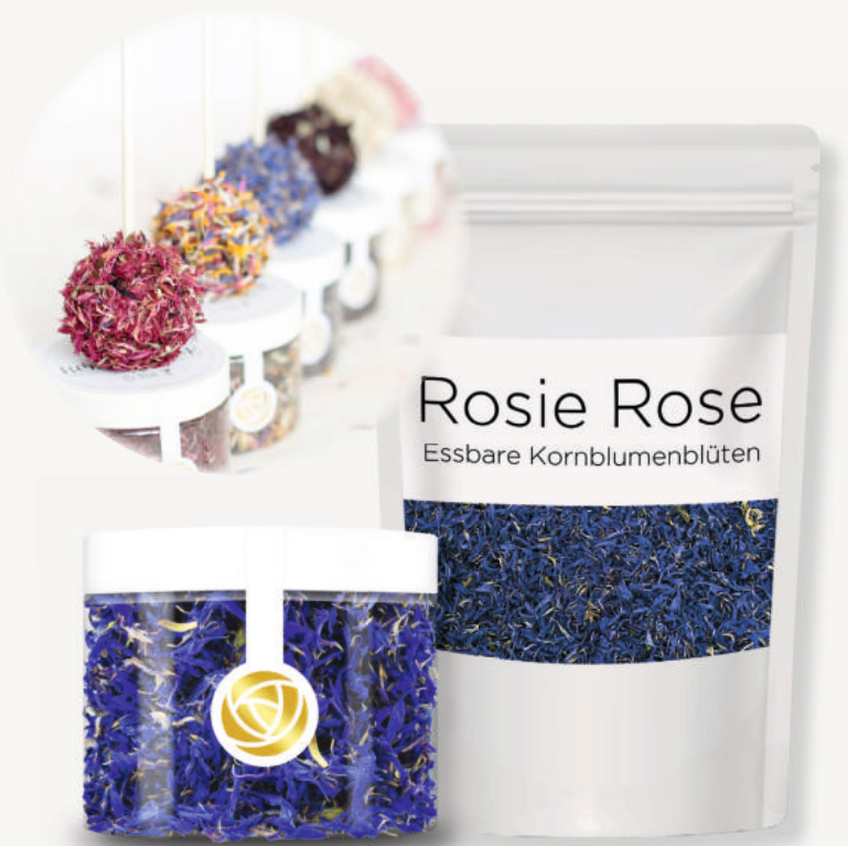
CORNFLOWERS „BLUE“ HOME / GASTRO ART.-Nr. RR018 / RR043