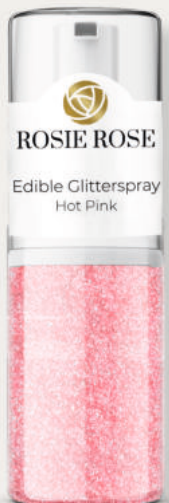
HOT PINK ART.-Nr. RR071