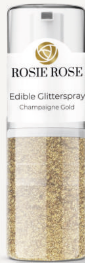
CHAMPAIGNE GOLD ART.-Nr. RR076