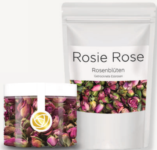
VINTAGE ROSE ART.-Nr. RR039 / RR026