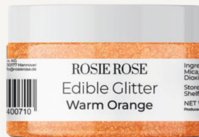
WARM ORANGE ART.-Nr. RR086