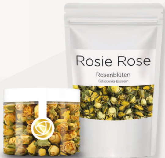
WARM YELLOW ART.-Nr. RR040 / RR027