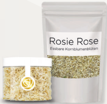
CORNFLOWERS „WHITE“ ART.-Nr. RR020 / RR045