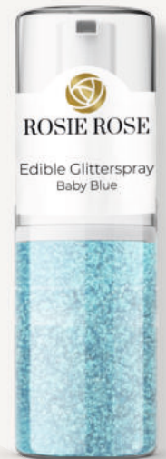
BABY BLUE ART.-Nr. RR070