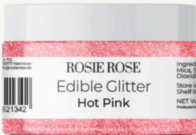
HOT PINK ART.-Nr. RR085