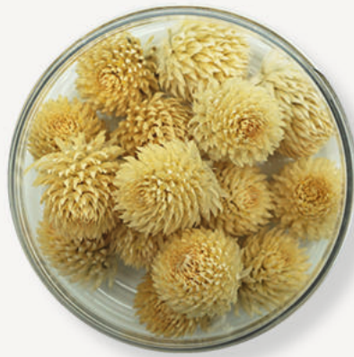
WHITE // ART.-Nr. RR093