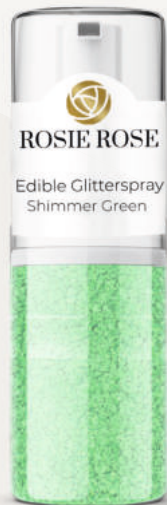
SHIMMER GREEN ART.-Nr. RR068