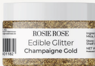
CHAMPAIGNE GOLD ART.-Nr. RR090

Quantity: 5 grams / 7 grams (Champaigne Gold) Best before date: 3 years