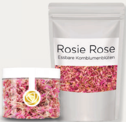
CORNFLOWERS „PINK“ ART.-Nr. RR021 / RR046