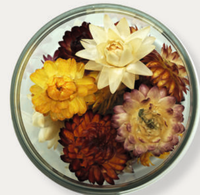
MIX // ART.-Nr. RR102