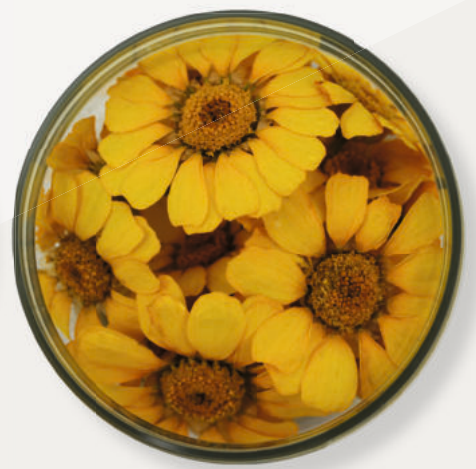
YELLOW DAISIES ART.-Nr. RR031