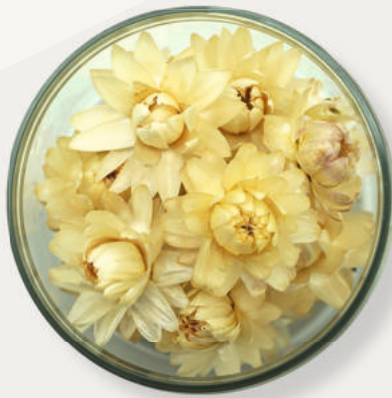
WHITE // ART.-Nr. RR098