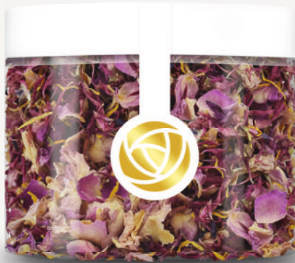
RUBY RED ART.-Nr. RR062