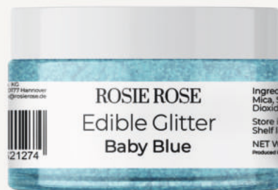
BABY BLUE ART.-Nr. RR084