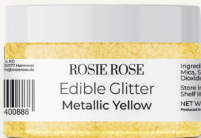
METALLIC YELLOW ART.-Nr. RR087