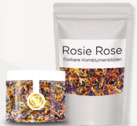
CORNFLOWERS „CLASSIC“ ART.-Nr. RR024 / RR048