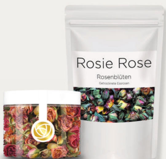
SUNSET MIX ART.-Nr. RR037 / RR011