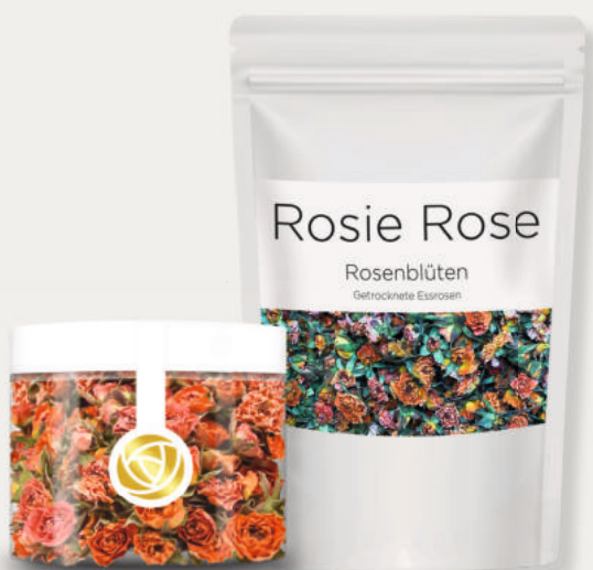
ORANGE SUNRISE ART.-Nr. RR038 / RR012