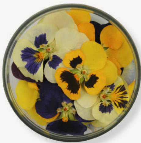
PANSIES ART.-Nr. RR029

Quantity: 15 pieces Country of origin: Iran Best before date: 3 years