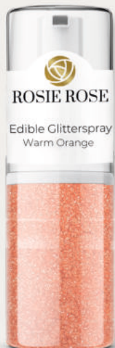
WARM ORANGE ART.-Nr. RR072