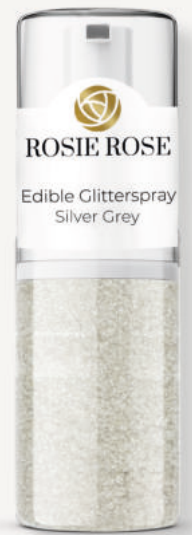
SILVER GREY ART.-Nr. RR075