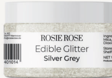
SILVER GREY ART.-Nr. RR089