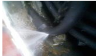
Blow out from pipe weakened by freezing