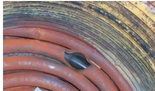
Pipe rupture due to freezing or obstruction

The HE Series (all electric) contains multiple heating elements to generate significant temperature rise in the heat exchange process. The heat exchanger contains a tubular pipe system that directs the water flow through the heating elements.