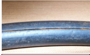
Failed pipe seam covered under warranty