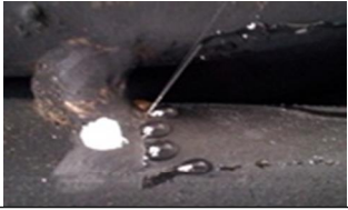
Failed weld or failed material covered under warranty

cause it to split and frozen flow switches or pressure switches can malfunction which control the burner. These pictures show different reasons for coil pipe failure: