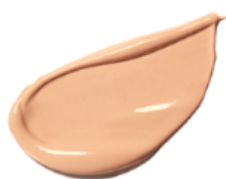
23 NATURAL BEIGE