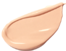
21 LIGHT BEIGE

| Brightening +Anti-Wrinkle+ UV shield | Consists of Product + Refill