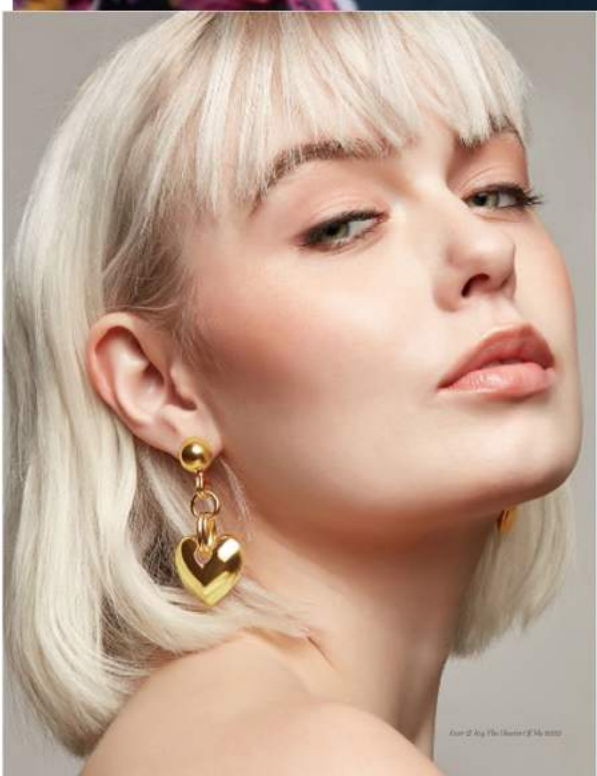
Ever & Ivy The Queen of Me 2022