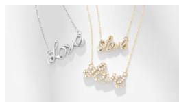
Take Your Jewelry Gift To The Next Level This Valentine's Day January 27, 2022