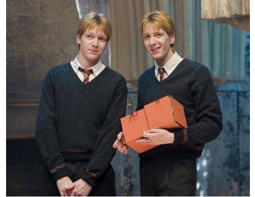
Fred & George Weasley