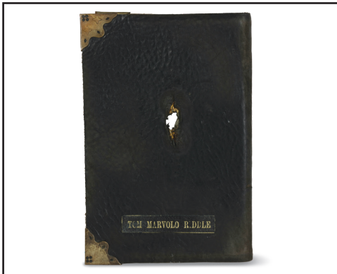
Tom Riddle's Diary