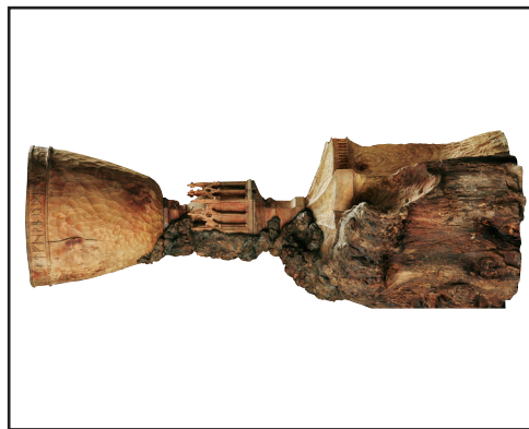
Goblet of Fire