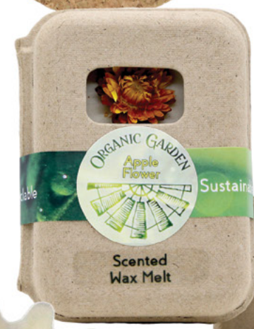
OGMB 2 oz Melt Bar