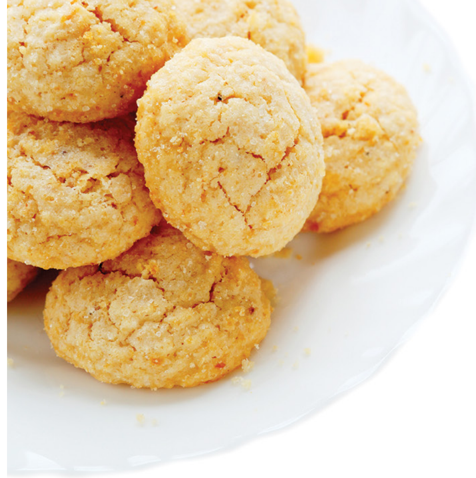
WCK 3 oz Cup Cookie Melt

Cookie and Ice Cream scents are available in the following options: