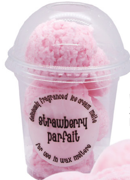
WIC 3 oz Cup Ice Cream Melt