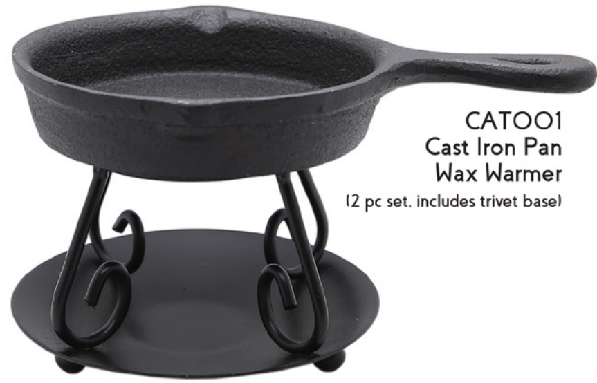
CAT001 Cast Iron Pan Wax Warmer (2 pc set, includes trivet base)

Classic Farmhouse Cast Iron Wax Warmers work with ALL wax melts and are a wonderfully nostalgic addition to any decor!