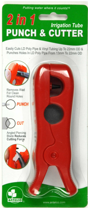
2 in 1 Punch & Cutter Retail Packaging