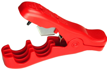
2 in 1 Punch & Cutter