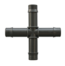
Cross 13 mm