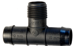
Threaded Tee Male