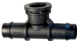
Threaded Tee Female