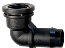
Threaded Elbow Female