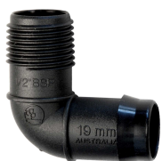
Threaded Elbow Male