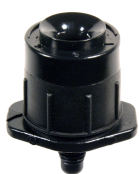
Spectrum™ Thread 4 mm