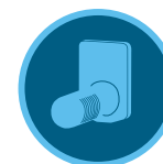
Freeze-Clik Sensor Page 152