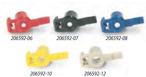
2045A Maxi-Paw and 2045-PJ Standard Angle Nozzles

Performance data derived from tests that conform with ASABE Standards; ASABE S398.1. See page 198 for complete ASABE Test Certification Statement.