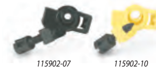
2045A Maxi-Paw and 2045-PJ Low Angle Nozzles