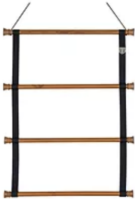
BASIC STABLE HANGER

7 bars plain - £64.47 (can't be embroidered)