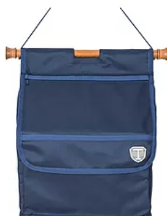
MINI STABLE BAG