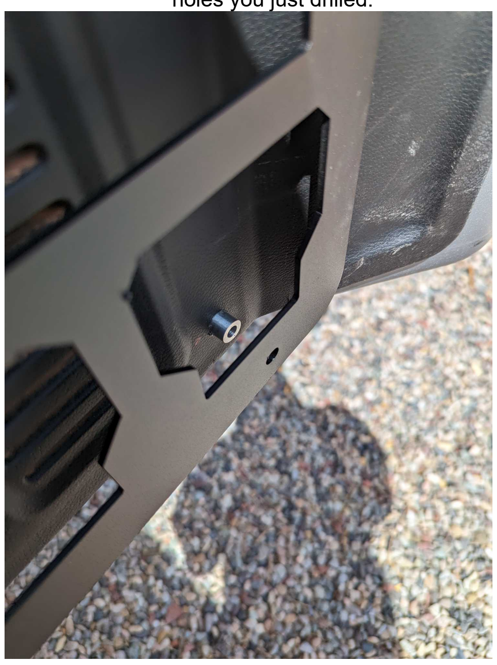
7. Repeat step 4.