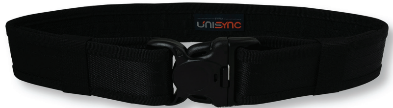
104066 OUTER DUTY BELT 3X BUCKLE FOR EXTRA SECURITY WEB NYLON WEAVE AND VELCRO LOOK LINING SIZE XS-3XL AVAILABLE IN: BLACK