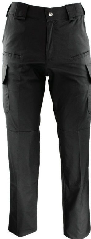
108546 TACT SQUAD LIGHT WEIGHT CARGO PANT 65% POLYESTER/ 35% COTTON LIGHTWEIGHT MINI RIP STOP SIZES 28-56 AVAILABLE COLORS: BLACK