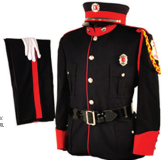
104735 MEN'S HONOUR GUARD TUNIC 55% POLYESTER/ 45% WOOL SIZES 28-56 AVAILABLE IN: BLACK/RED