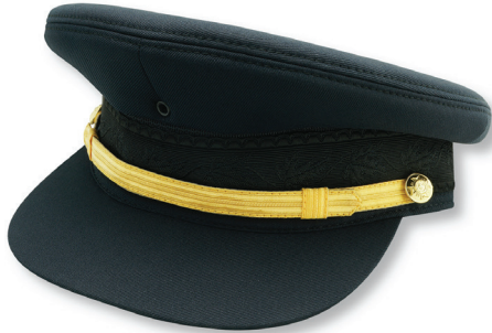
100772 C.A.F.C. OFFICERS HAT 100% POLYESTER SIZES: 6 3/4 - 8 AVAILABLE IN: NAVY, BLACK