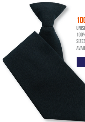
100770 UNISEX CLIP ON TIE 100% POLYESTER SIZES: REG /TALL AVAILABLE IN: NAVY, BLACK