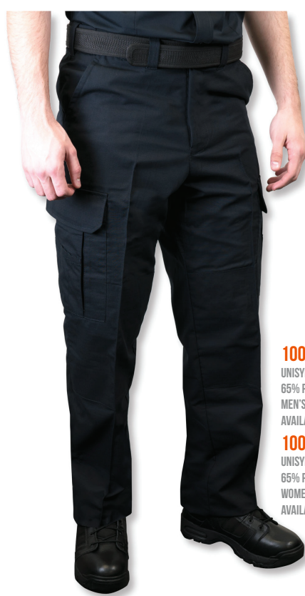
100873 UNISYNC CARGO PANT 65% POLYESTER/ 35% COTTON MEN'S :28-56 AVAILABLE COLORS: BLACK