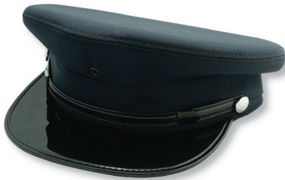
100773 C.A.F.C. FIREFIGHTER HAT 100% POLYESTER SIZES: 6 3/4 - 8 AVAILABLE IN: NAVY, BLACK