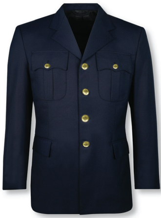
100803 MEN'S C.A.F.C. TROPICAL TUNIC 55% POLYESTER/ 45% WOOL SIZES 38-58 AVAILABLE IN: NAVY, BLACK