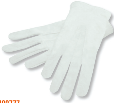
100777 UNISEX CEREMONIAL GLOVES 100% COTTON SIZES M/L/XL AVAILABLE IN: WHITE