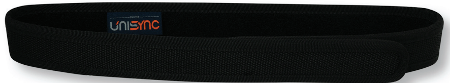
104064 INNER LINER WEB 1.6" WIDE FULL LENGTH WITH LOOP VELCRO LINING HOOK & LOOP CLOSURE FOR QUICK ON/OFF EASE SIZE XS-3XL AVAILABLE IN: BLACK