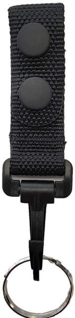
106750 KEY HOLDER 1" WEB DOUBLE SNAP CLOSURE QUICK RELEASE KEY RING AVAILABLE IN: BLACK