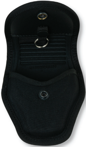
104088 COVERED HANDCUFF POUCH SINGLE SNAP, HOLD 1 PAIR BELT LOOP 2" AVAILABLE IN: BLACK