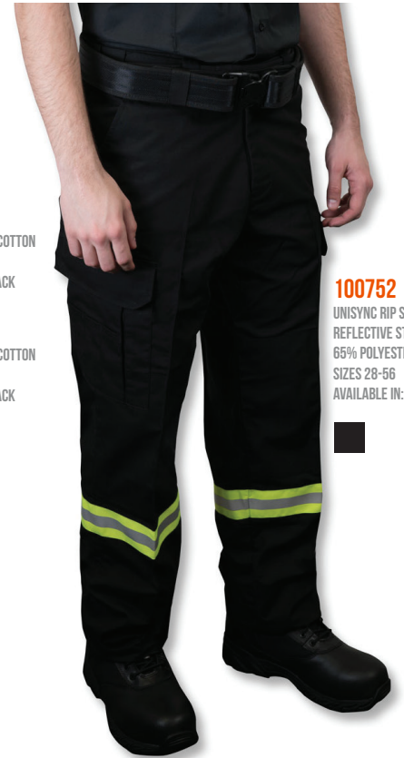
100752 UNISYNC RIP STOP PANT WITH REFLECTIVE STRIPE 65% POLYESTER/ 35% COTTON SIZES 28-56 AVAILABLE IN: BLACK