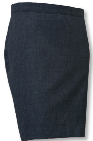
100804 WOMEN'S TROPICAL SKIRT 55% POLYESTER/ 45% WOOL SIZES 26-52 AVAILABLE IN: NAVY, BLACK