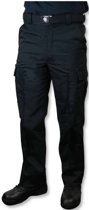
100114 HAMMILL UNISEX CARGO PANT 65% POLYESTER/ 35% COTTON 28-56 AVAILABLE COLORS: BLACK