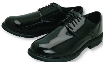
100870 UNISEX SHOES 100% PATEN LEATHER SIZES: 4-14 AVAILABLE IN: BLACK