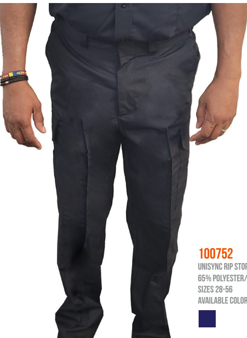
100752 UNISYNC RIP STOP PANT 65% POLYESTER/ 35% COTTON SIZES 28-56 AVAILABLE COLORS: NAVY