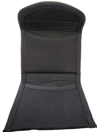
104108 FLAT GLOVE POUCH NYLON COMPACT ON 2" DUTY BELT HOLDS 2 PAIRS OF LATEX GLOVES AVAILABLE IN: BLACK