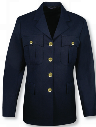
100802 WOMEN'S C.A.F.C. TROPICAL TUNIC 55% POLYESTER/ 45% WOOL SIZES 2-26 AVAILABLE IN: NAVY, BLACK