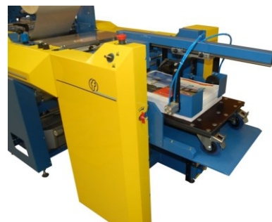
Optional Pallet Stacker (integrated)

It is an electric lift with a film core adaptor for loading heavy rolls of film (max. capacity 125 kg). The device is not integrated with the machine. It is only connected with the machine electric circuits.