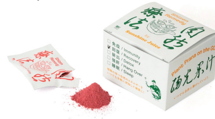
CHAGA "IMMUNITY" & BEETS "RECOVERY" etc

Two different products made of concentrated plant essence. "IMMUNITY", made of "Chaga" powder also known as a miracle mushroom, with over 30 times the antioxidant properties of acai, helping you to prevent ageing and support your bodies' natural immunity. "RECOVERY" contains the nitrate essence of beets to help you improve blood flow and your ability to recover from fatigue. By dissolving 3g of 1 packet at a time in about 300ml of juice, cold or hot water, or any other drink you like, you can carry these products with you to make sure you have the nutrition you need even when you are out.