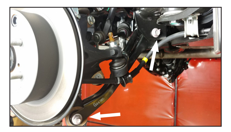
30. Loosen but do not remove the rear lower control arm bolt at the subframe.