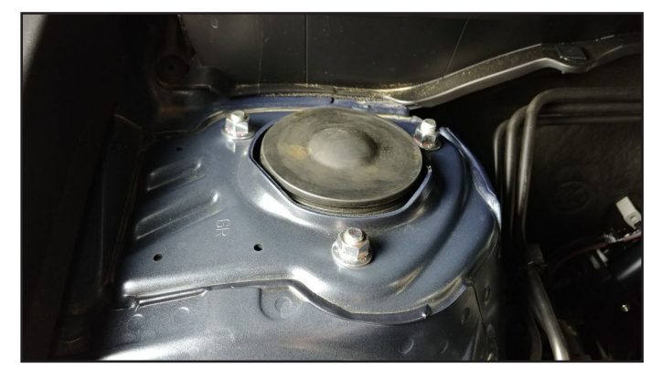
11.Install the strut extension onto the removed strut assembly using the factory nuts and 14mm

10. Remove the three (3) nuts that attach the upper end of the strut to the strut tower (accessed from the engine bay, as the hood should already be propped open). Do not let the strut fall as you remove the last bolt. It may be helpful to have a friend hold up strut as the bolts are removed. Carefully lower the strut and remove it from the vehicle.