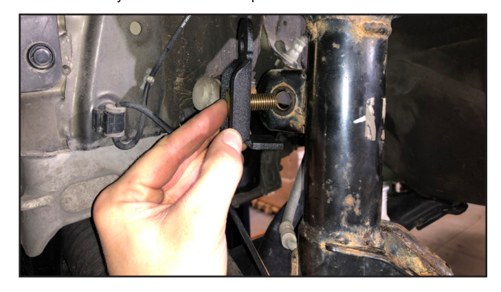
18. Install the 1/4" thick spacer washer onto the end of the sway bar link.