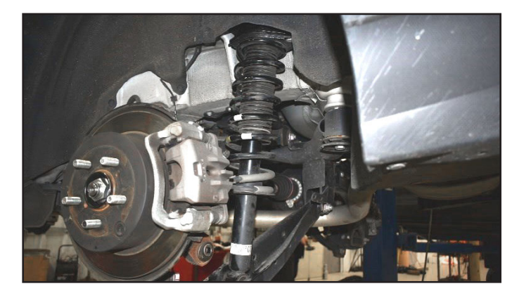
35. Raise the lower control arm into place and install the lower strut hardware. Do not tighten at this time. Use the jack and raise the lower control arm up to set pre load on the strut. Re-install the lower knuckle bolt. Torque to 95 ft-lbs.