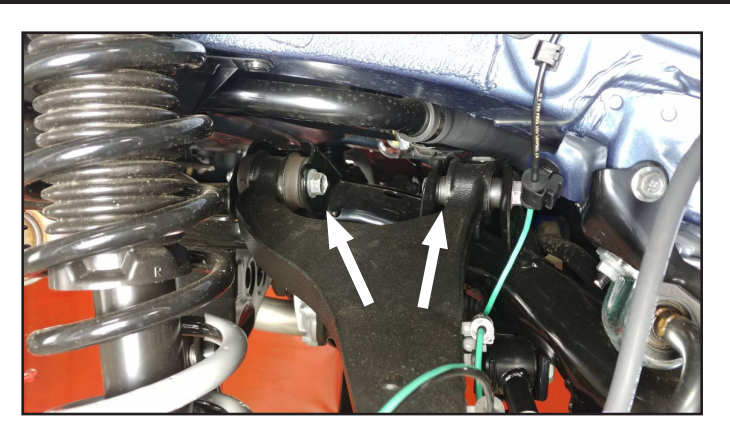
29. Loosen but do not remove the front lower control arm bolts.