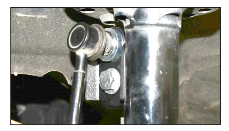
20. Repeat the previous steps to install the other strut spacer on the opposite side of the vehicle. Once both ends of the sway bar have been re-attached, torque the sway bar end links and brackets to 45 ft-lbs.