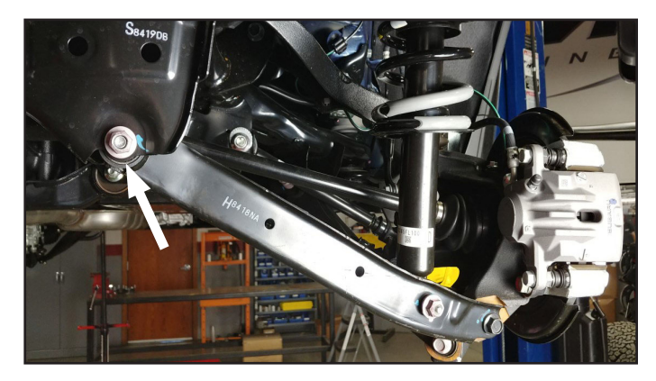
31. Support the strut and lower control arm, remove the lower strut and knuckle bolts. Lower the control arm down, while holding the strut. Remove the strut from the vehicle. A helper is recommended to hold the strut from falling.