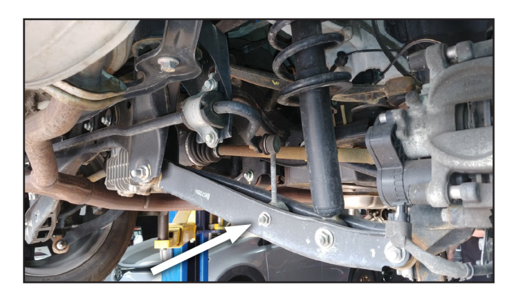
26. Disconnect the sway bar at the subframe and let the sway bar hang out of the way.

25. Support the lower control arm with a suit-able jack. Remove the rear wheels. Loos-en but do not remove the sway bar end link on the lower control arm.