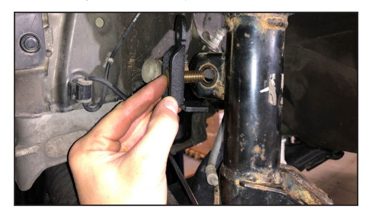
18. Install the 1/4" thick spacer washer onto the end of the sway bar link.