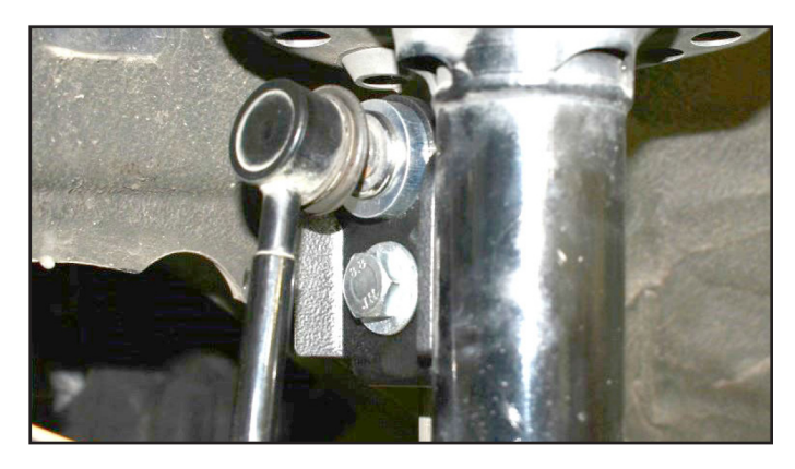
20. Repeat the previous steps to install the other strut spacer on the opposite side of the vehicle. Once both ends of the sway bar have been re-attached, torque the sway bar end links and brackets to 45 ft-lbs.