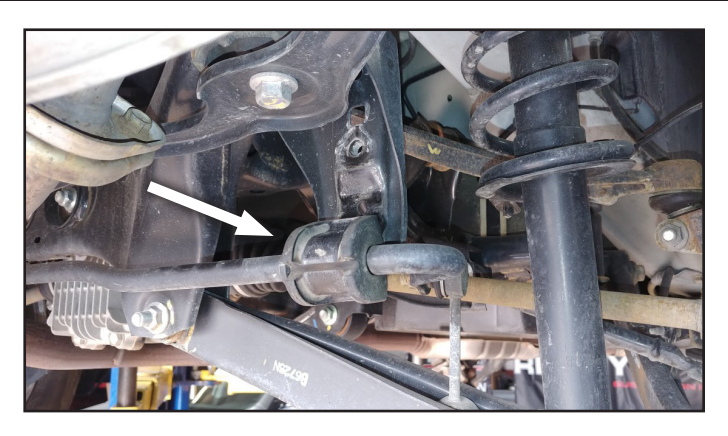
27. Loosen but do not remove the upper control arm bolts.