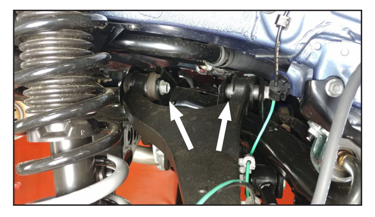
28. Loosen but do not remove the front lower control arm bolts.