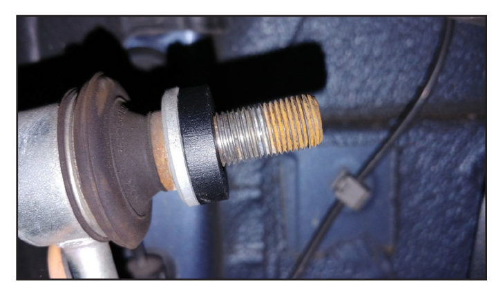
19. Attach the sway bar end link to the newly-in- stalled bracket using the factory hardware.