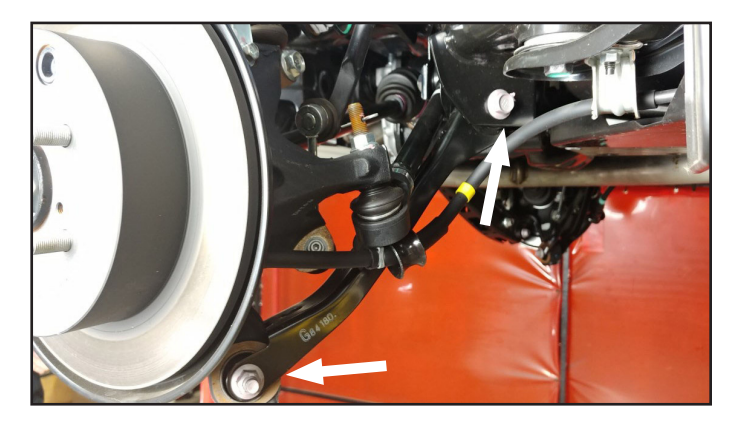
29. Loosen but do not remove the rear lower control arm bolt at the subframe.