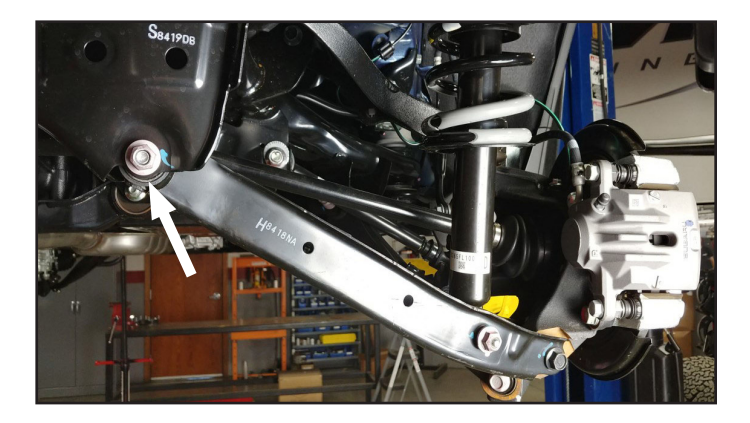
30. Support the strut and lower control arm, remove the lower strut and knuckle bolts. Lower the control arm down, while holding the strut. Remove the strut from the vehicle. A helper is recommended to hold the strut from falling.