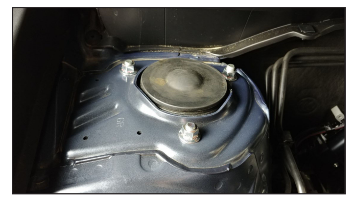
11.Install the strut extension onto the removed strut assembly using the factory nuts and 14mm

10. Remove the three (3) nuts that attach the upper end of the strut to the strut tower (accessed from the engine bay, as the hood should already be propped open). Do not let the strut fall as you remove the last bolt. It may be helpful to have a friend hold up strut as the bolts are removed. Carefully lower the strut and remove it from the vehicle.