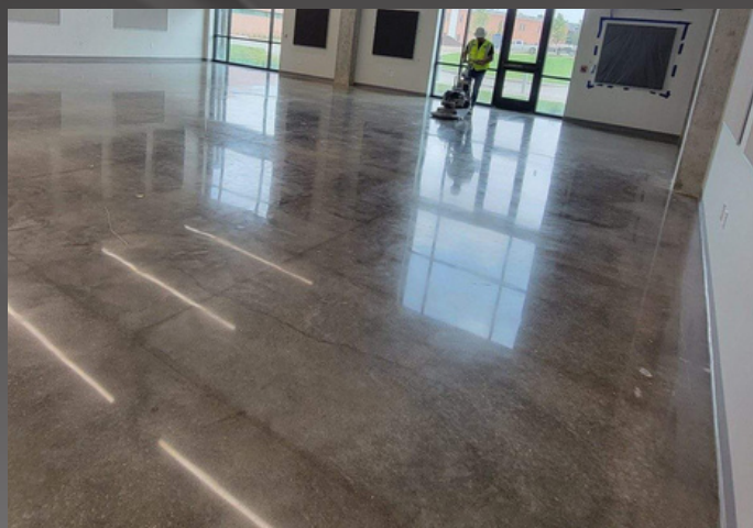
SOL GEL POLISH 1500 GRIT FINISH