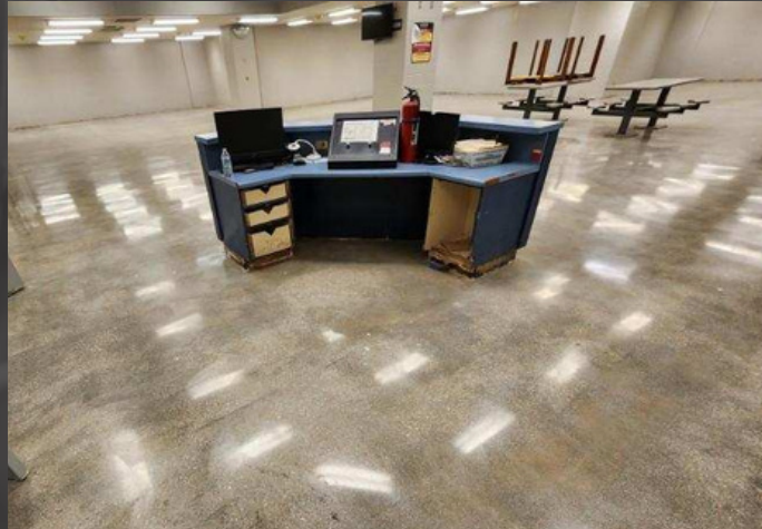
SOL GEL POLISH 400 GRIT FINISH