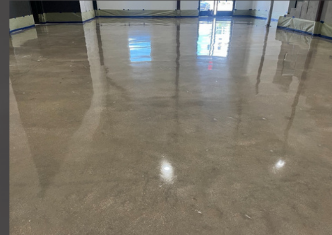
SOL GEL POLISH 800 GRIT FINISH