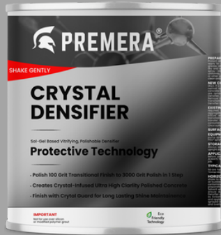
Premera Crystal Densifier

Concrete Polishing has Evolved. Skip Resins & Go Straight to Burnishing. Discover Sol-Gels, Discover the Premera Way.