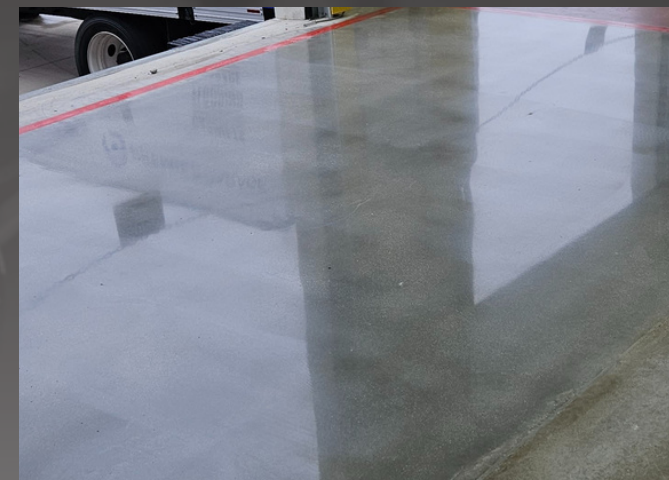
SOL GEL POLISH 3000 GRIT FINISH