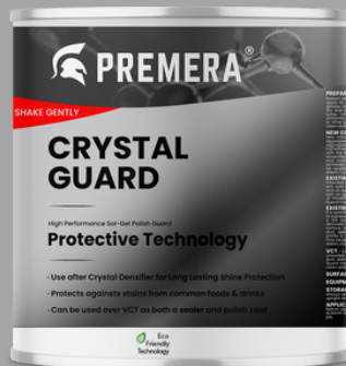
Premera Crystal Guard

Sol-Gel Based SiO2 Densifier Spray on to 100 Transitional Finish Skip All Resins & Go Straight to Burnish Burnish with 3000 grit Diamond Pad Instantly Create Mirror Finish Polish