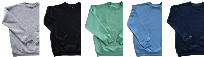
GREY BLACK JADE CEIL NAVY