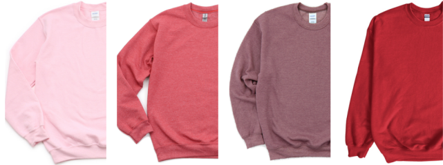
PINK SCARLET PORT CHERRY