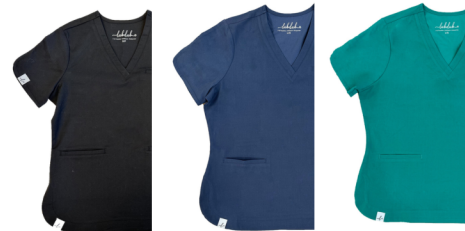
BLACK ROSA NAVY ROSA EVERGREEN ROSA