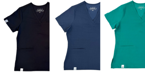
BLACK CODI NAVY CODI EVERGREEN CODI