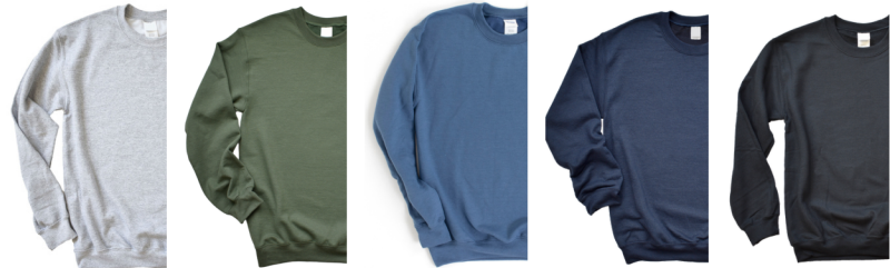
GREY FERN INDIGO NAVY BLACK