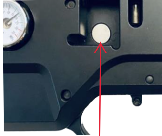
12x5 mm. magnet on the air gun

Notice: Use only the magnets supplied or recommended by manufacturer.