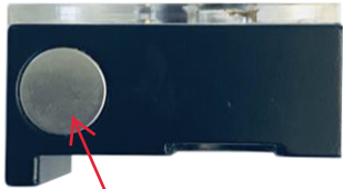
12x3 mm. magnet on the magazine