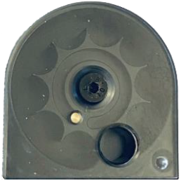
.357 cal.10 shots magazine