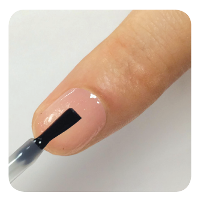
2. Brush on a thin, single coat of Artisan GelEfex Base Gel. Cure for 30-60 secs in a UV/LED lamp.