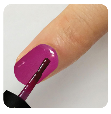
Apply your chosen color of Artisan GelEfex Gel Nail Polish. Cure for 30-60 secs in a UV/LED lamp.