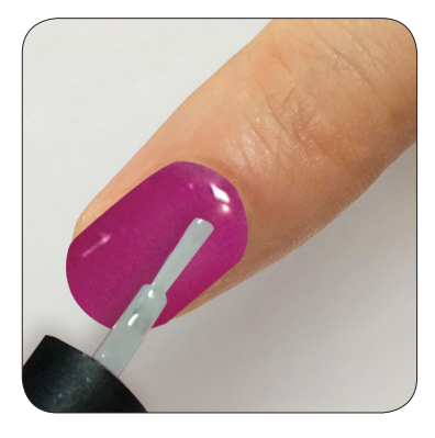
4. Apply Artisan Chrome & Holographic 2-in-1 Top & Base Coat. Cure for 60 secs in a UV/LED lamp.