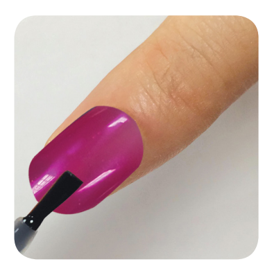
7. Apply Artisan Chrome & Holographic 2-in-1 Top & Base Coat. Cure for 60 secs. DON'T WIPE! This is a no-wipe top coat.