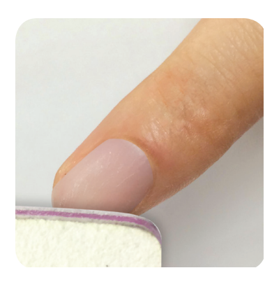
1. Sanitize and prep all nails with Artisan Equalizer.