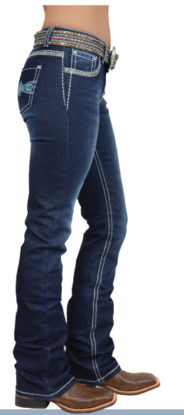
Perfect rise for riding Mid Rise at front Higher Rise at back Stretch for comfort Extra room through thigh so you can be comfortable all day in the saddle Extra room through knee for movement 36" Leg Length Bootcut leg opening

From the saddle to the everyday, we have the perfect fit for you.