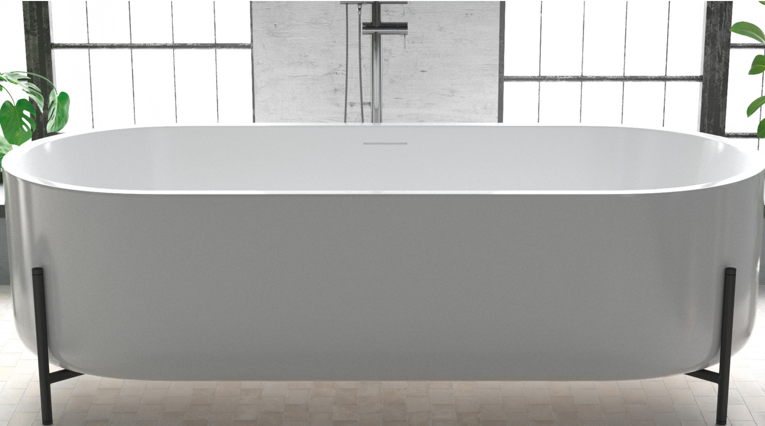
WOW COTTAGE White

ARCHITESSA an Architectural Ceramics brand