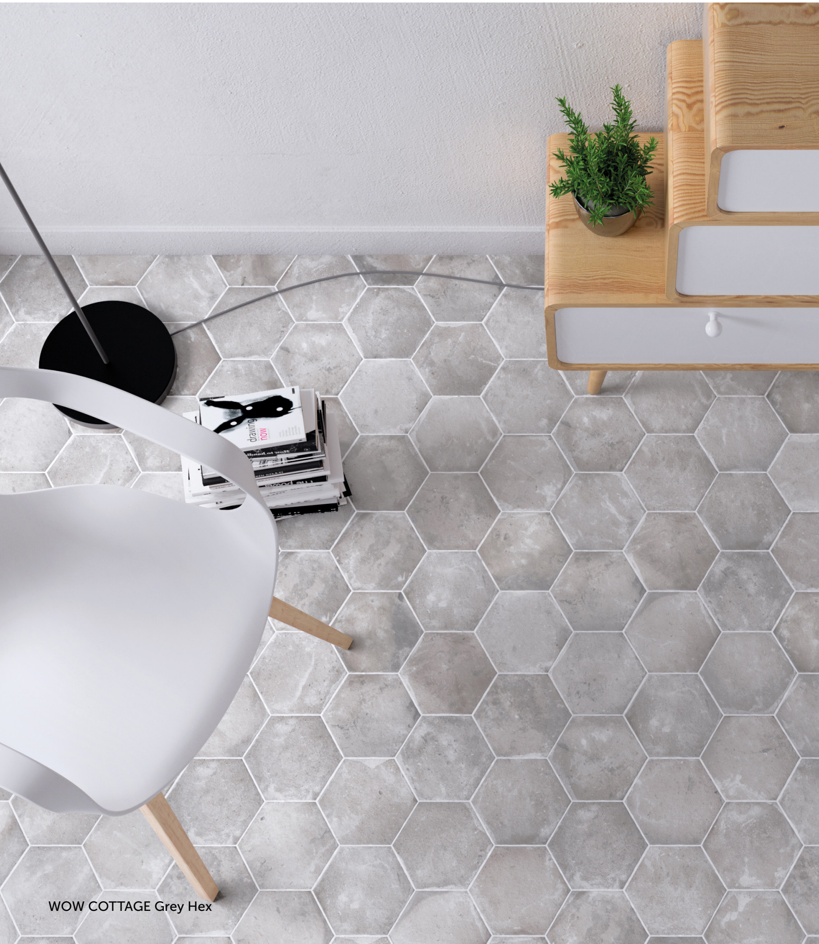
WOW COTTAGE Grey Hex