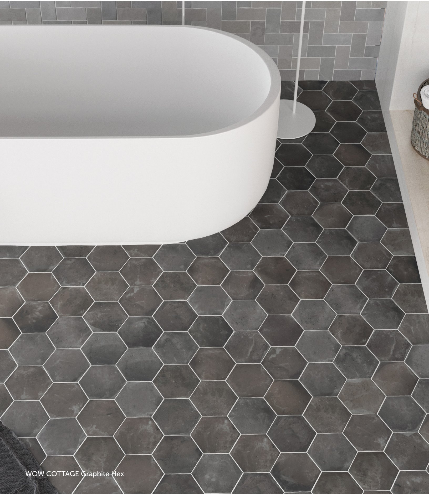
WOW COTTAGE Graphite Hex