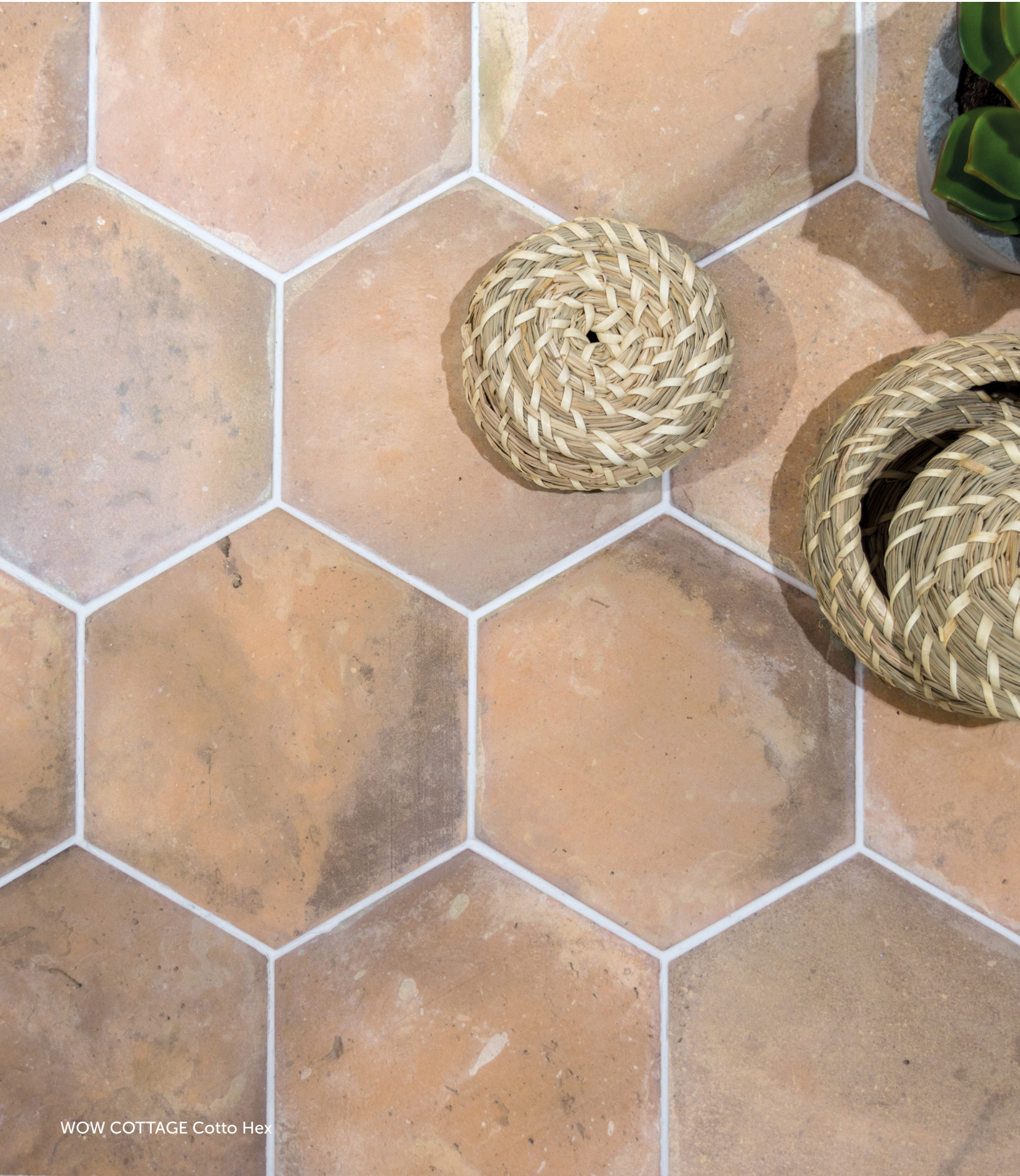
WOW COTTAGE Cotto Hex