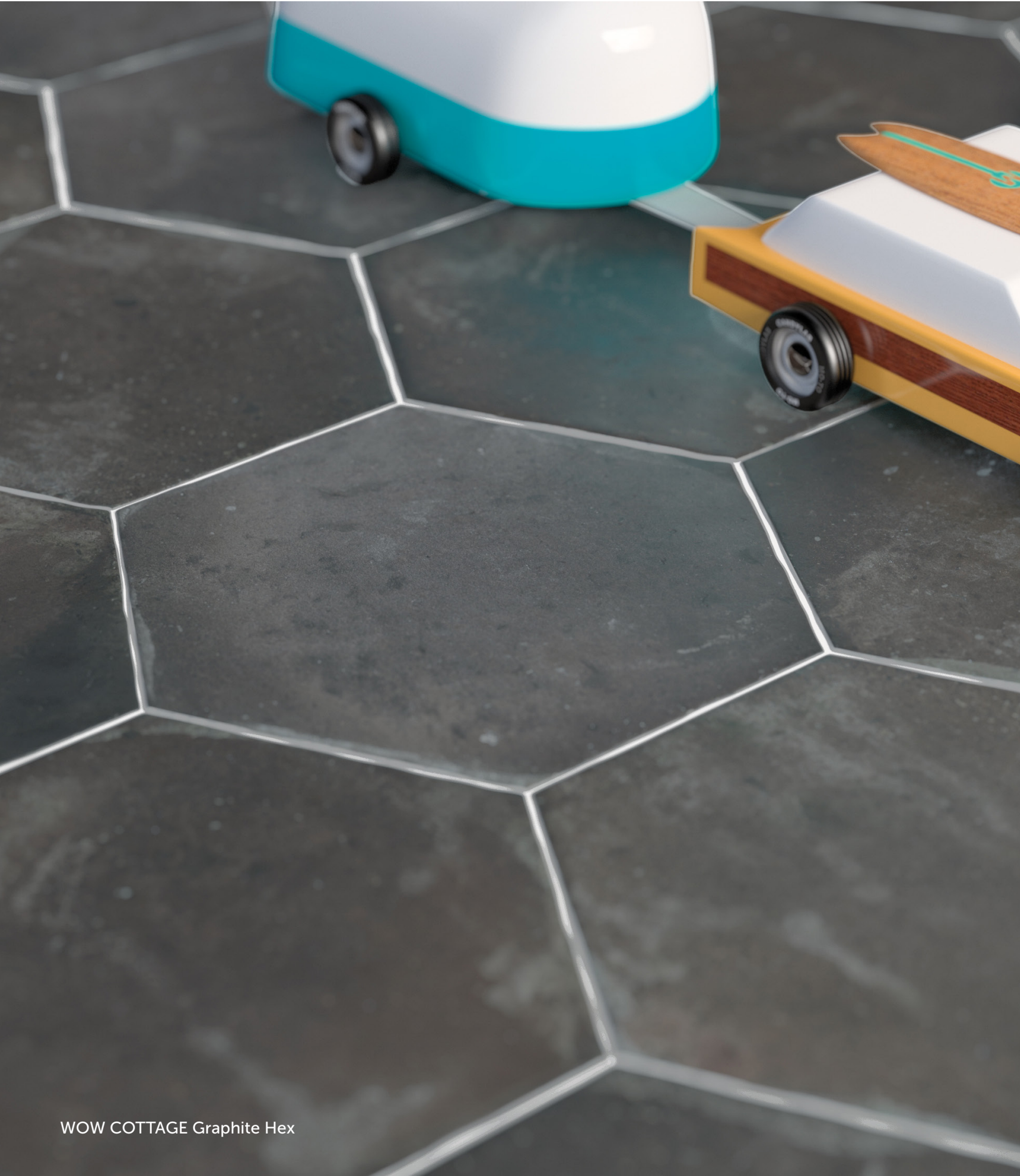
WOW COTTAGE Graphite Hex