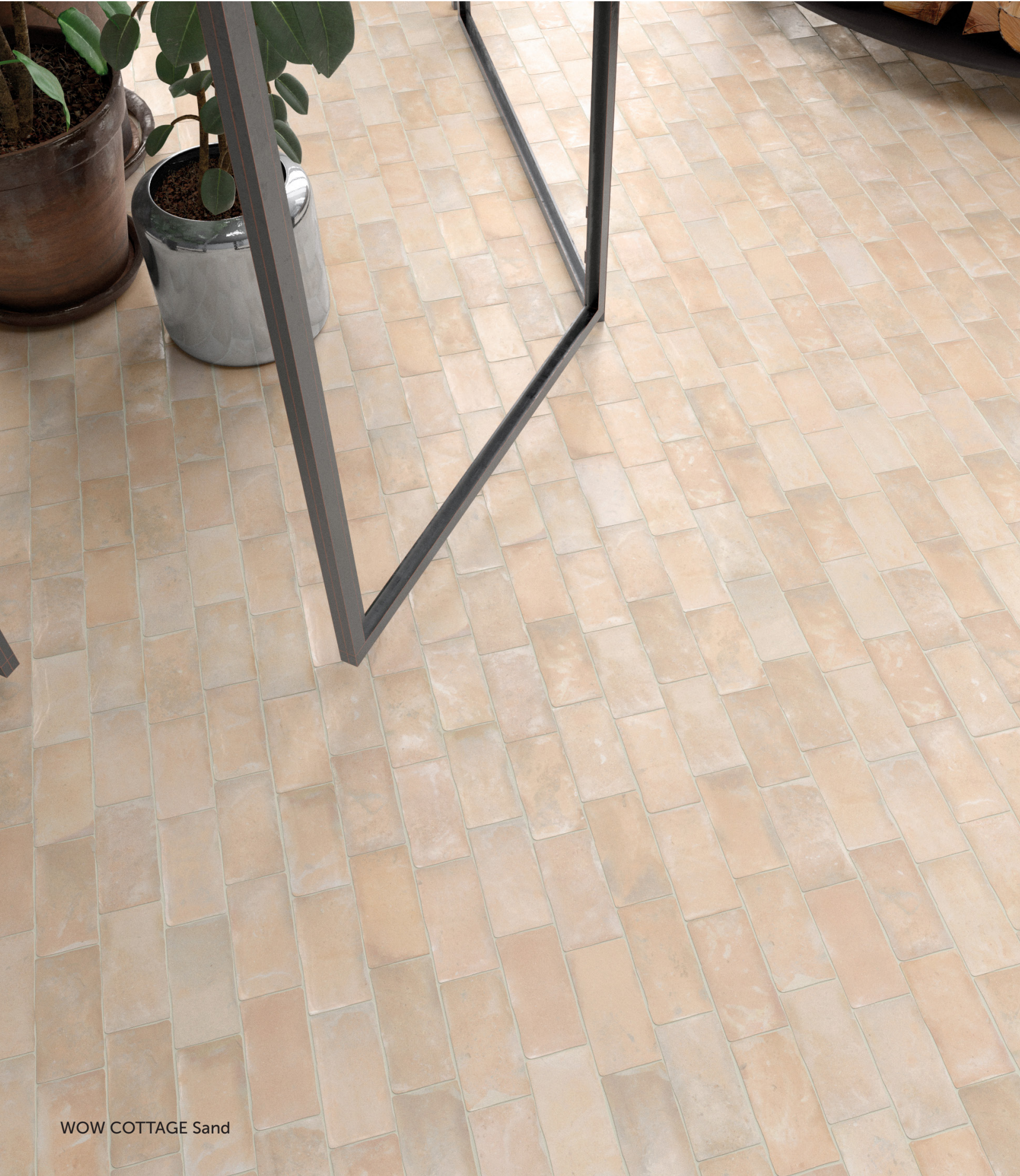
WOW COTTAGE Sand