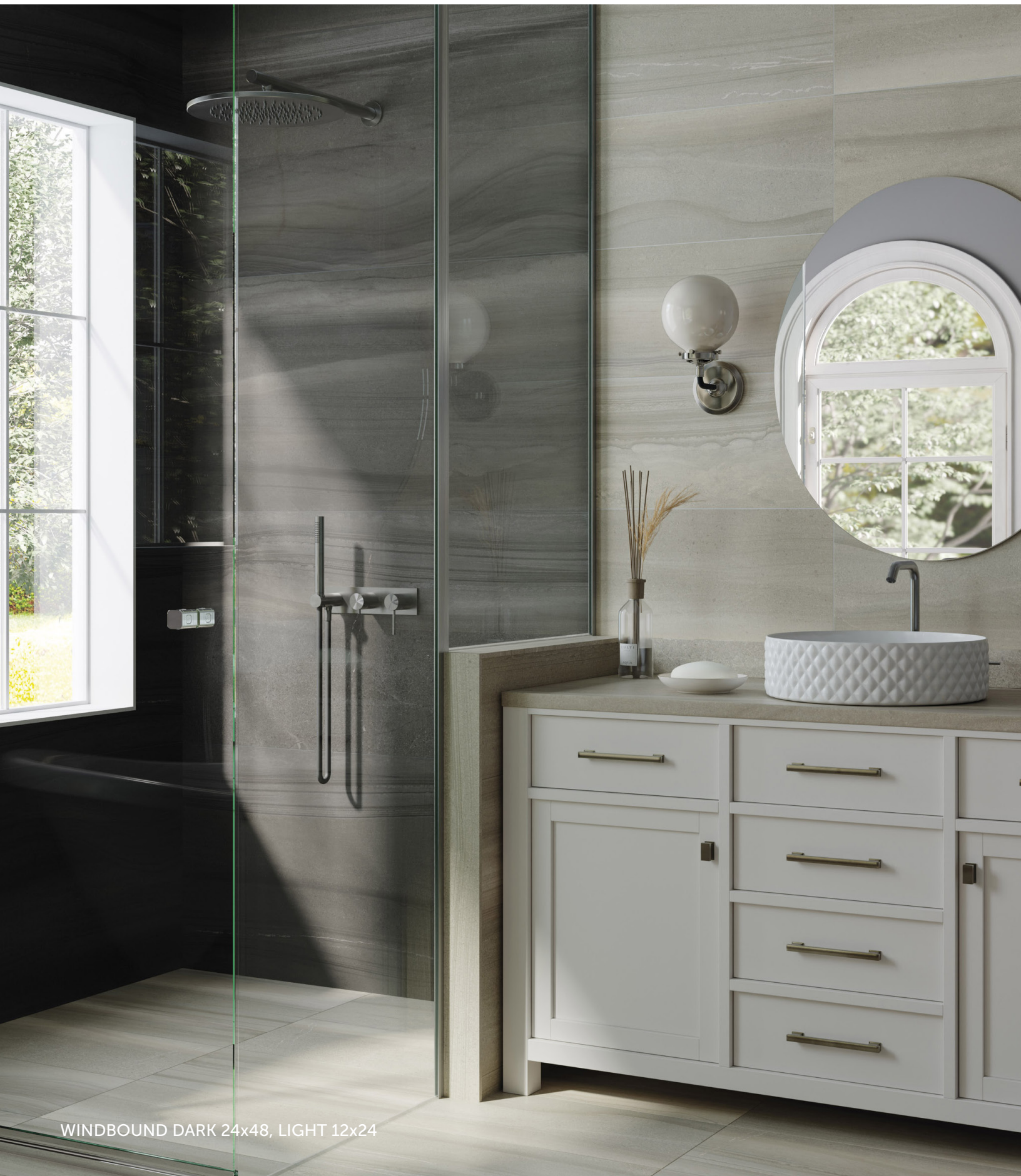
WINDBOUND DARK 24x48, LIGHT 12x24