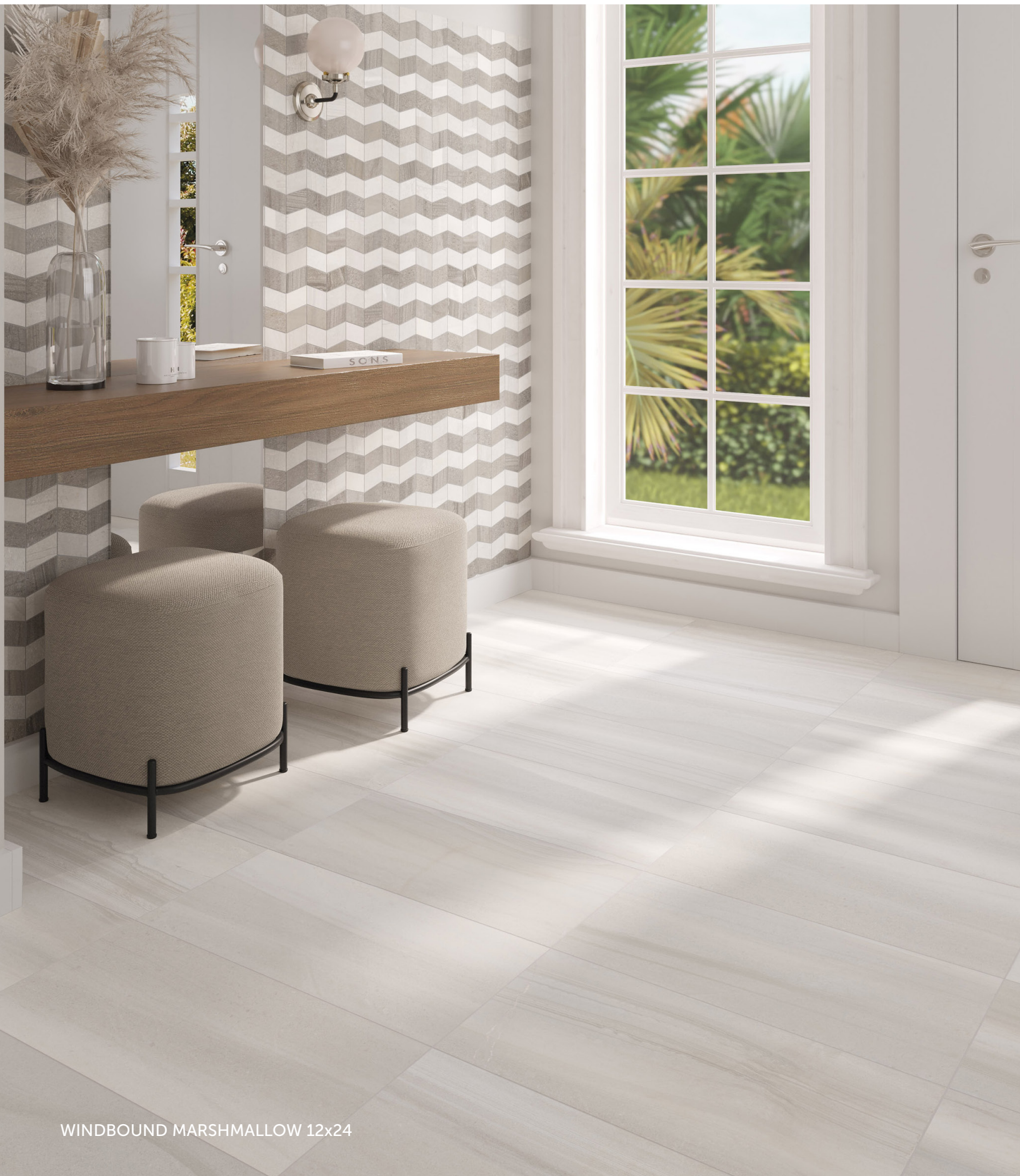
WINDBOUND MARSHMALLOW 12x24