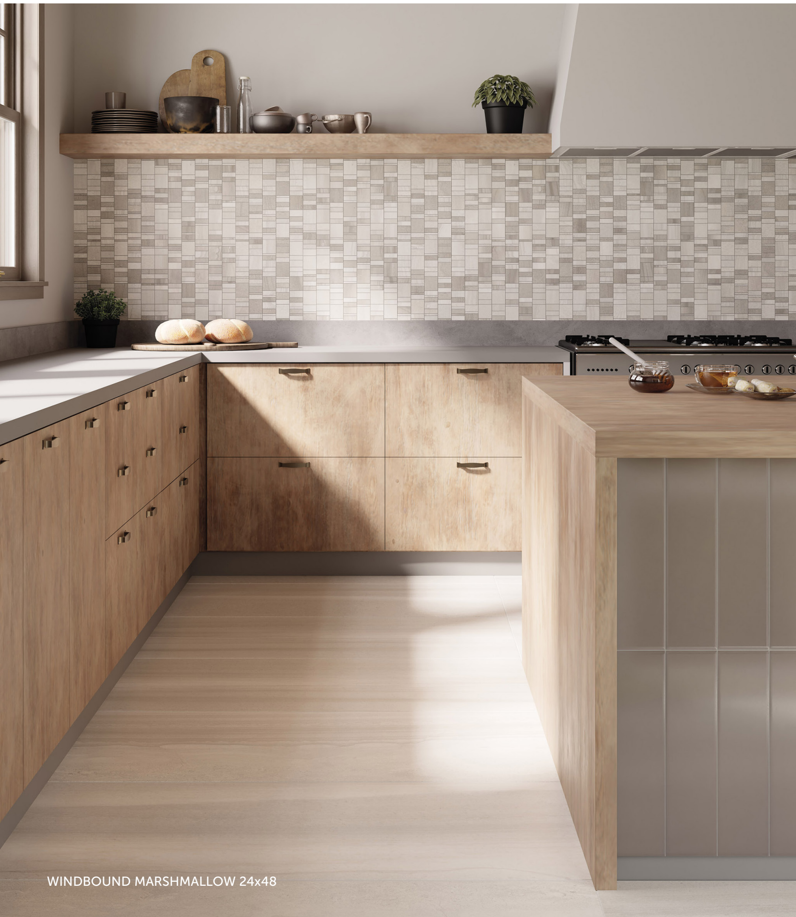
WINDBOUND MARSHMALLOW 24x48