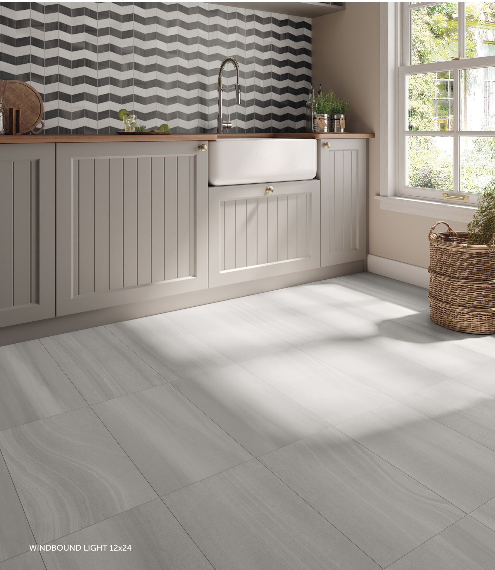
WINDBOUND LIGHT 12x24