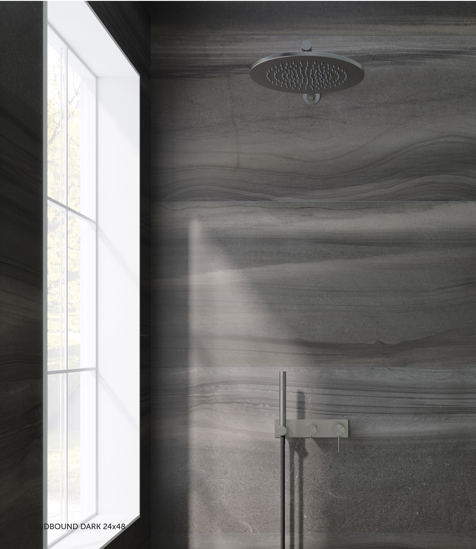
DBOUND DARK 24x48