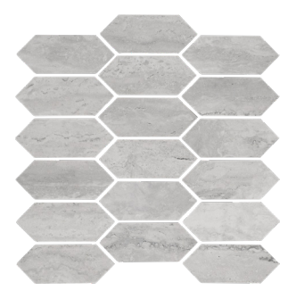
Silver 2x2 Picket