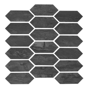
Charcoal 2x2 Picket