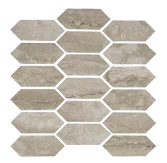
Natural 2x2 Picket