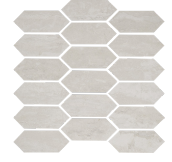
Ivory 2x2 Picket