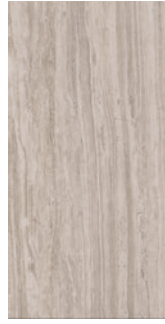
Filo Greige | V3

24x48 NAT RECT | #200234E 36x72 NAT RECT | #200191E 12x24 NAT BOLD | #200543E