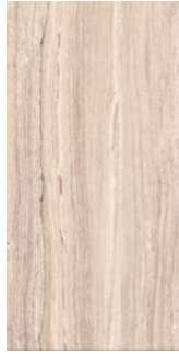
Filo Beige | V3

24x48 NAT RECT | #200156E 36x72 NAT RECT | #200152E 12x24 NAT BOLD | #200541E