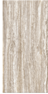
Filo Gamma | V3

24x48 NAT RECT | #200237E 36x72 NAT RECT | #200228E 12x24 NAT BOLD | #200544E