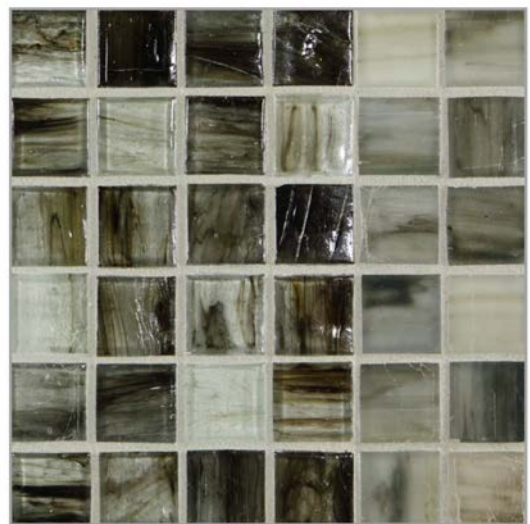
Natural | Silk Nickel