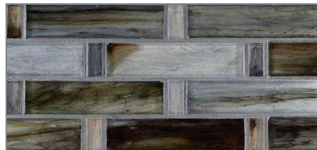
Tresse (1/2 x 1 & 1 x 4) (11.5mm x 25mm, 25mm x 100mm)