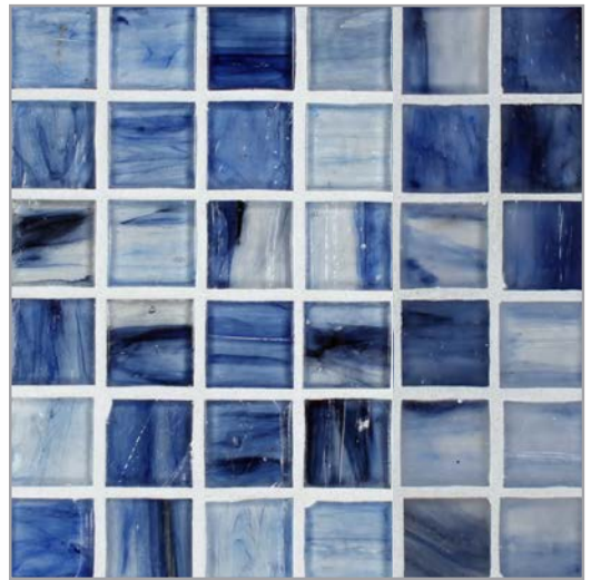
Natural | Silk Antimony