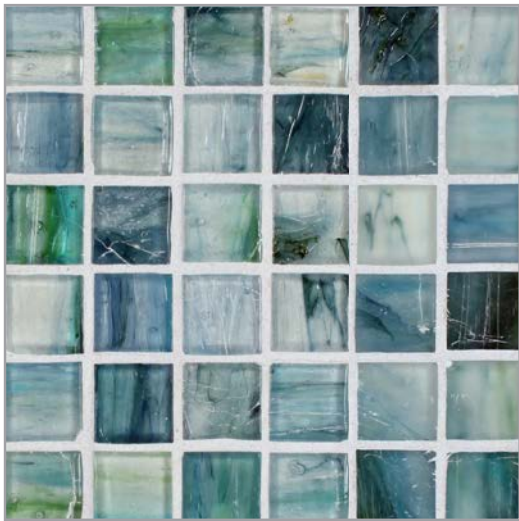
Natural | Silk Erbium