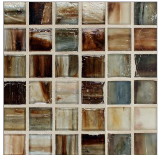
Natural | Silk Copper