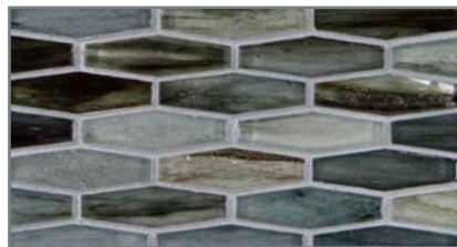
Martini (5/8 x 2) (16mm x 50mm)