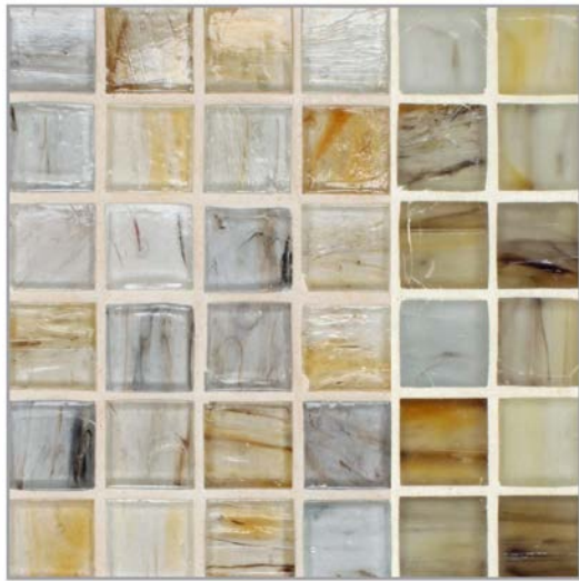
Natural | Silk Indium