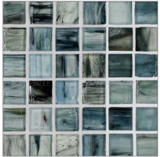
Natural | Silk Iodine