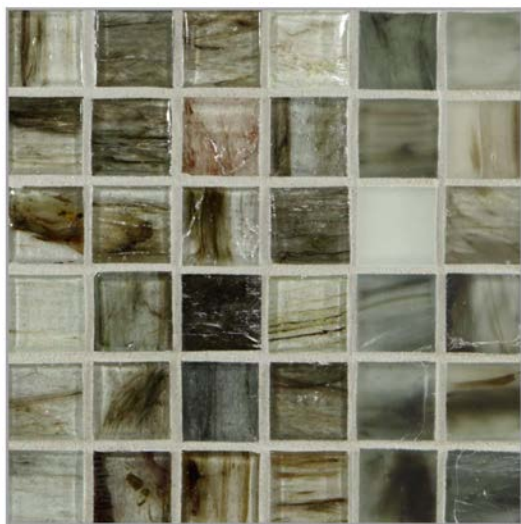
Natural | Silk Vanadium