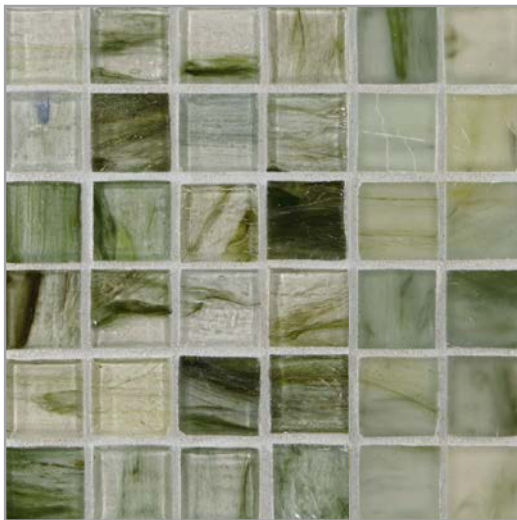
Natural | Silk Selenium