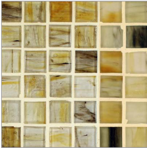
Natural | Silk Yttrium