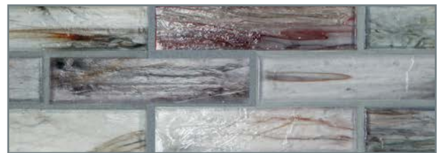
1 x 4 Brick (25mm x 100mm)