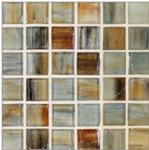
Natural | Silk Xenon