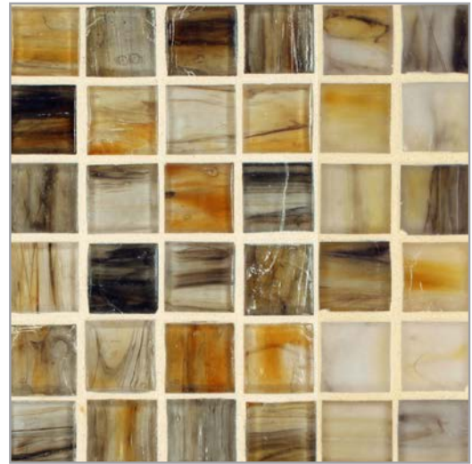
Natural | Silk Tin