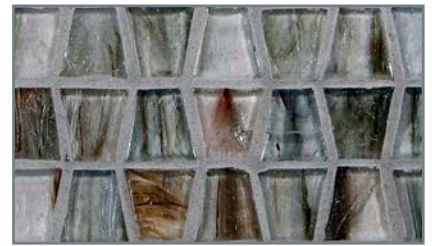
Wings (1 x 1) (25mm x 25mm)