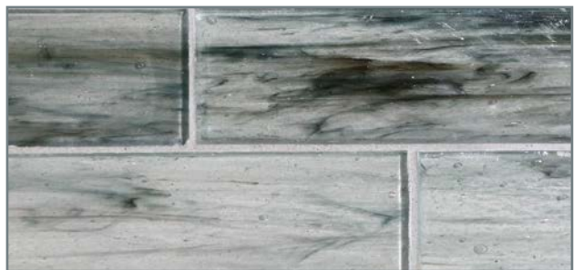
2 x 6 Brick* (50mm x 150mm)