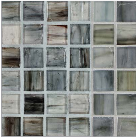
Natural | Silk Oxygen