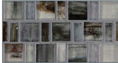
Japonaise (1/2 x 1 & 1 x 1) (11.5mm x 25mm, 25mm x 25mm)