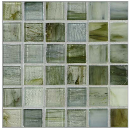
Natural | Silk Strontium