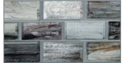
1 x 2 Brick (25mm x 50mm)