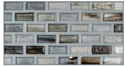
1/2 x 1 Mini Brick (11.5 mm x 25mm)