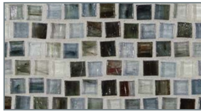
Pompeii (1/2 x 1/2) (11.5mm x 11.5mm)