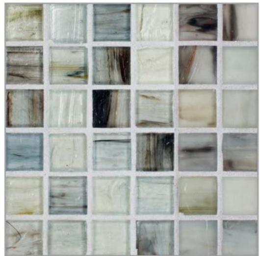
Natural | Silk Arsenic