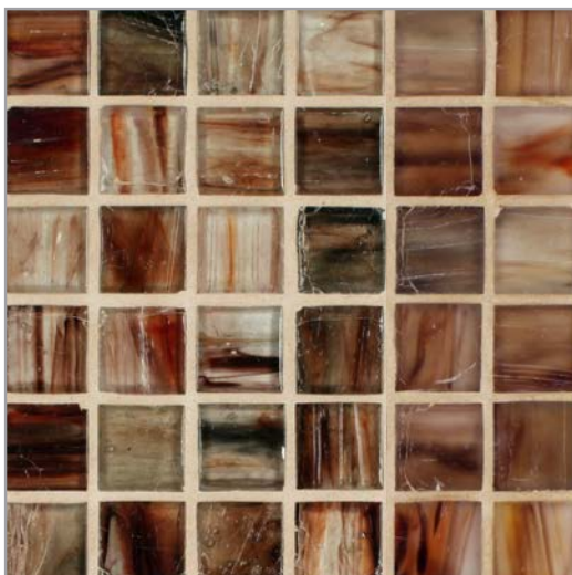
Natural | Silk Lithium