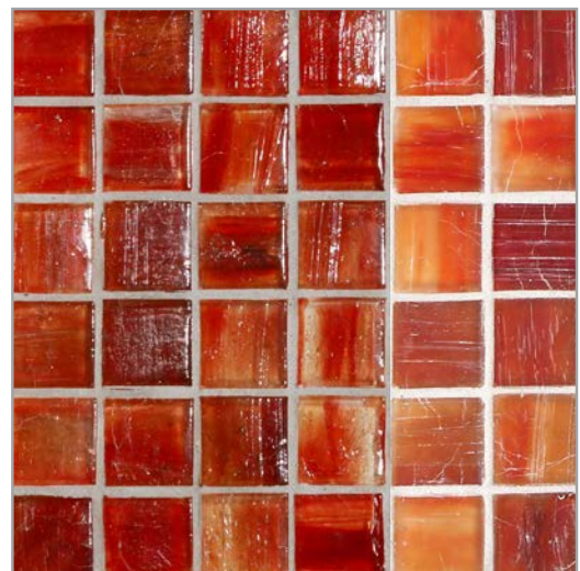
Natural | Silk Marrakech Red