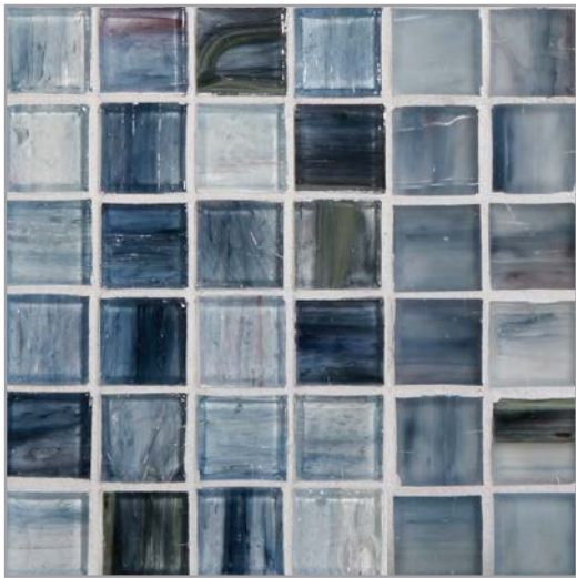
Natural | Silk Tanzanite