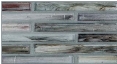
1/2 x 4 Brick (11.5mm x 100mm)