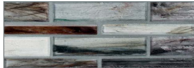
Moyou (1/2 x 4 & 1 x 4) (11.5mm x 100mm, 25mm x 100mm)