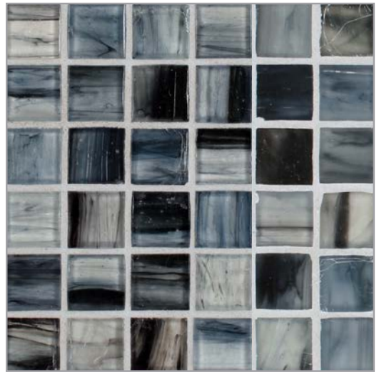
Natural | Silk Argon