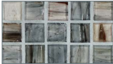
1 x 1 Mosaic (25mm x 25mm)