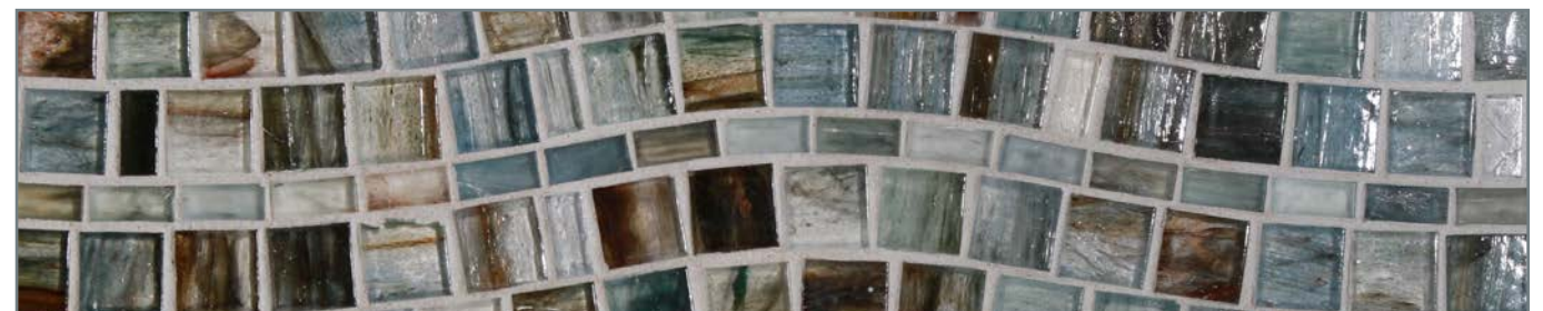
Rio (1/2 x 1 & 1 x 1) (Natural and Silk) (11.5mm x 25mm, 25mm x 25mm)