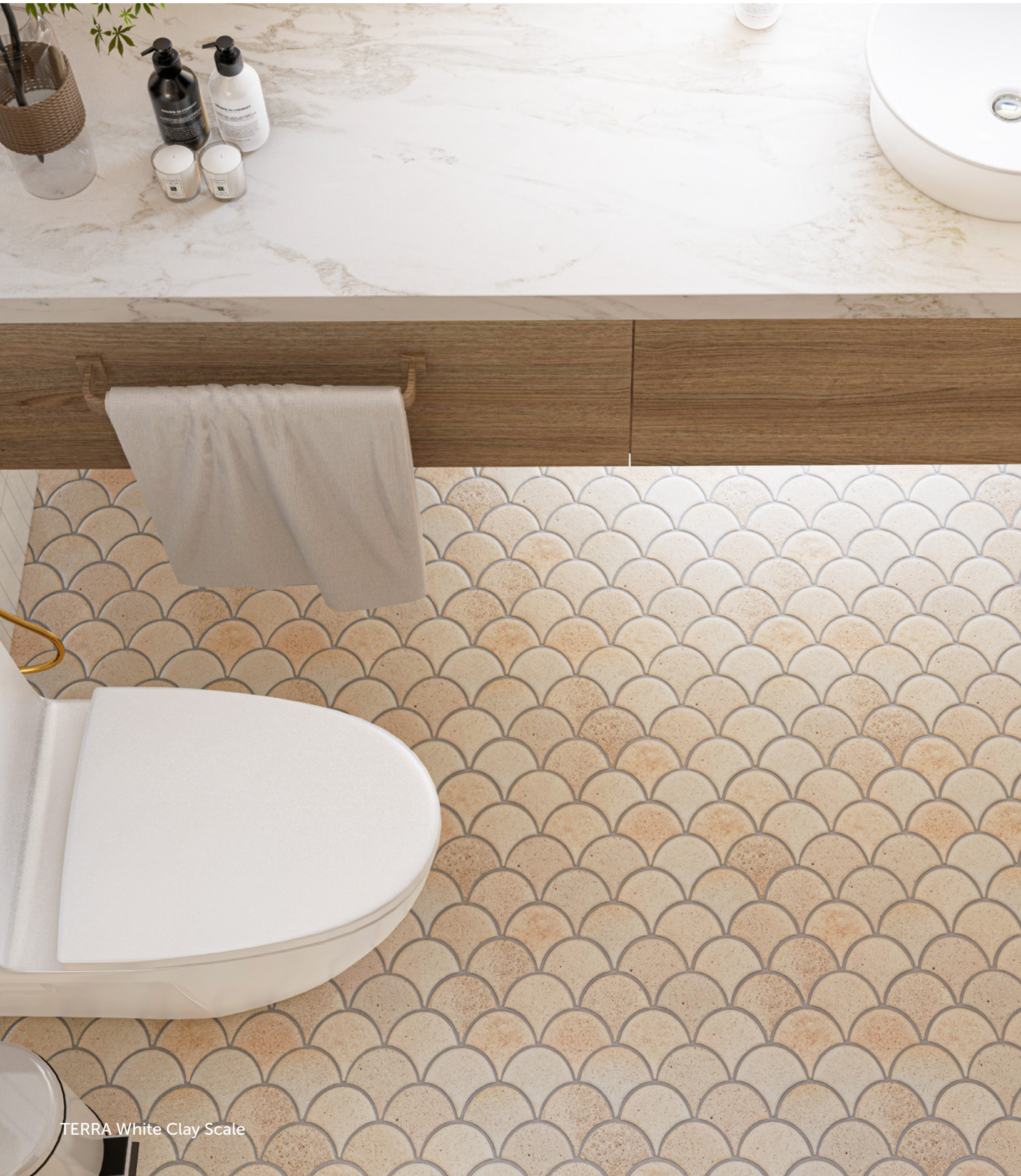
TERRA White Clay Scale