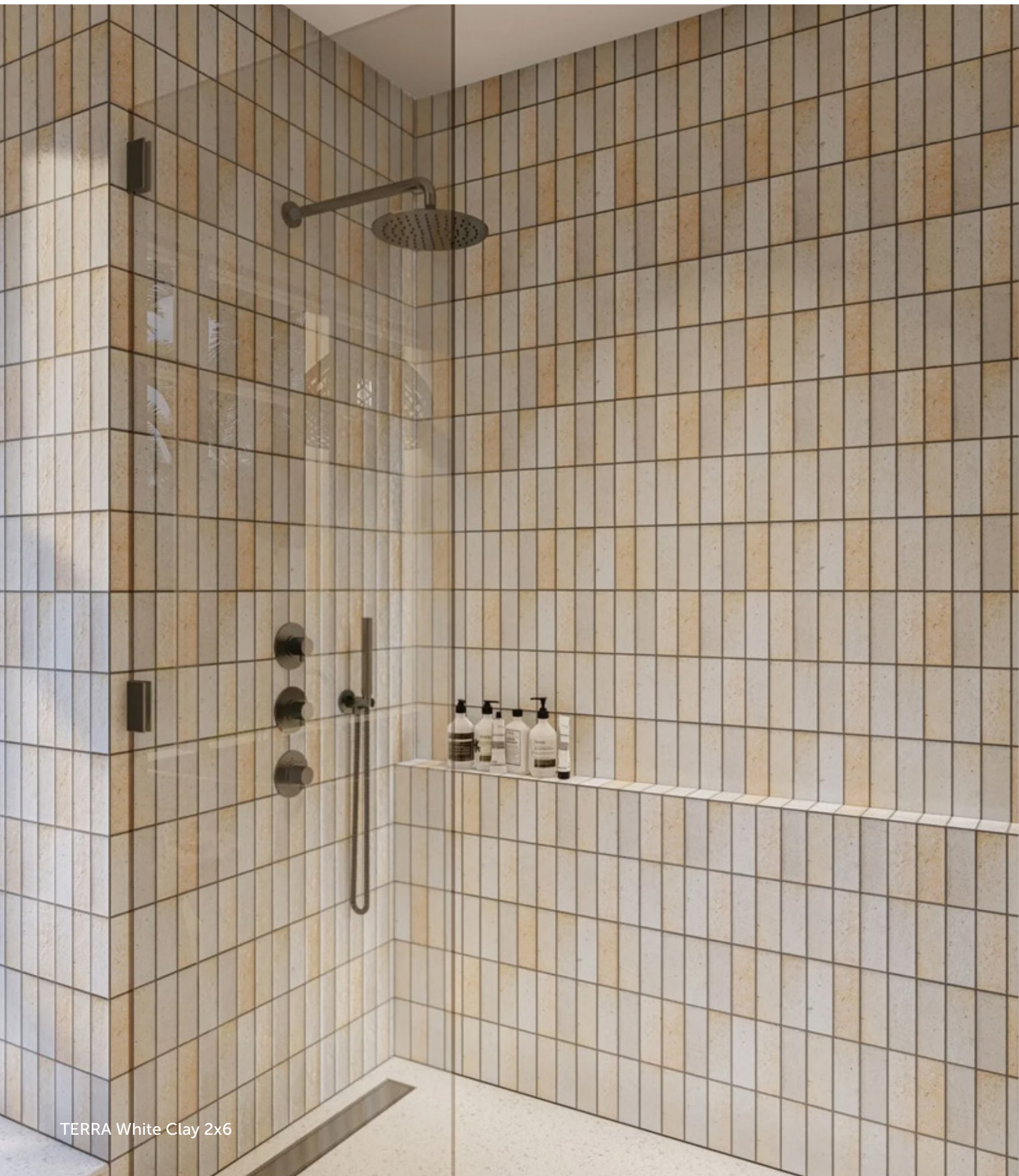
TERRA White Clay 2x6