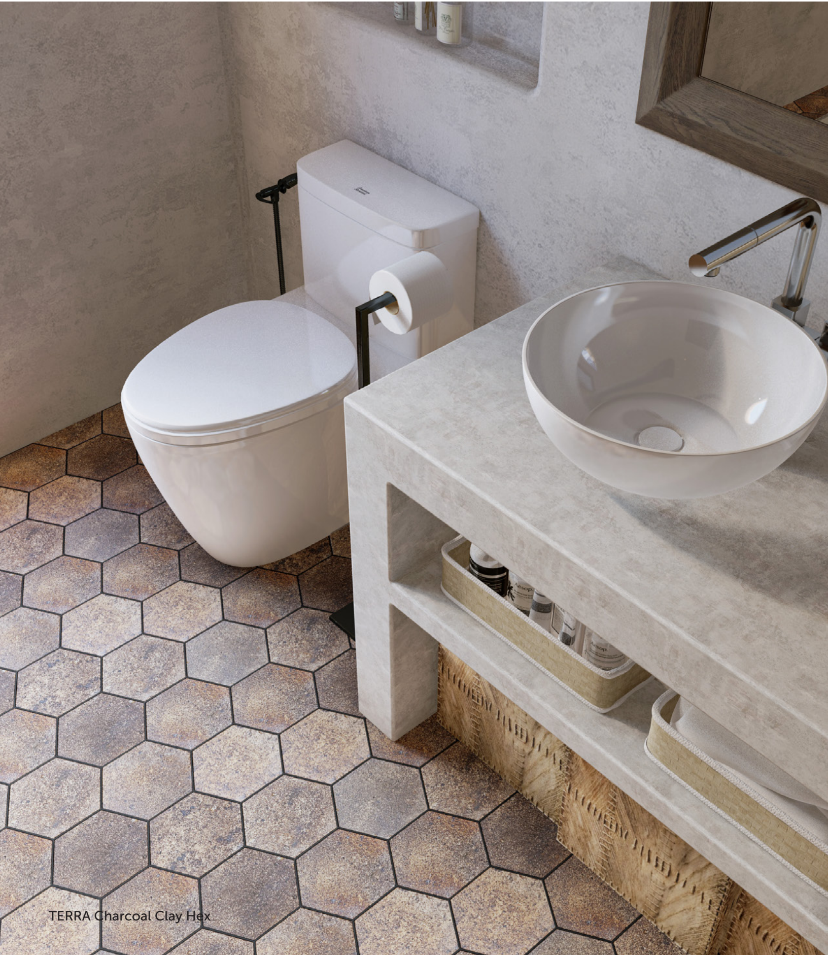
TERRA Charcoal Clay Hex