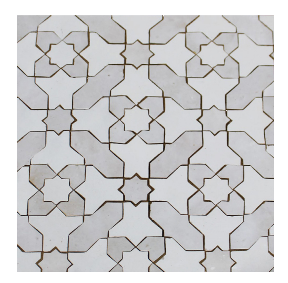
Atlas Snow/Desert White