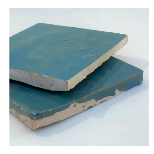
Edge detail: Classic (top), Nouveau (bottom)