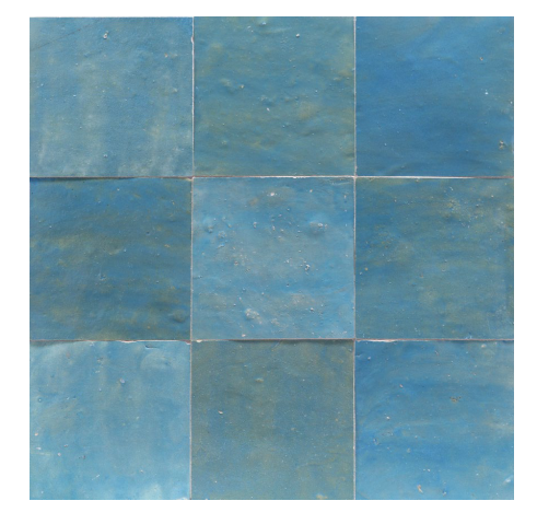
Classic Tiles - no joint

Nouveau is simply the tile before it is cut to make classic zellige. Nouveau tiles retain the natural edge from the mold which imparts a more "typical" tile look, while keeping the color variation and movement of zellige that people love. Nouveau tiles are easier to install, and finished installations will avoid some of the lippage associated with classic zellige.