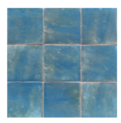
Nouveau Tiles - 1/16" joint