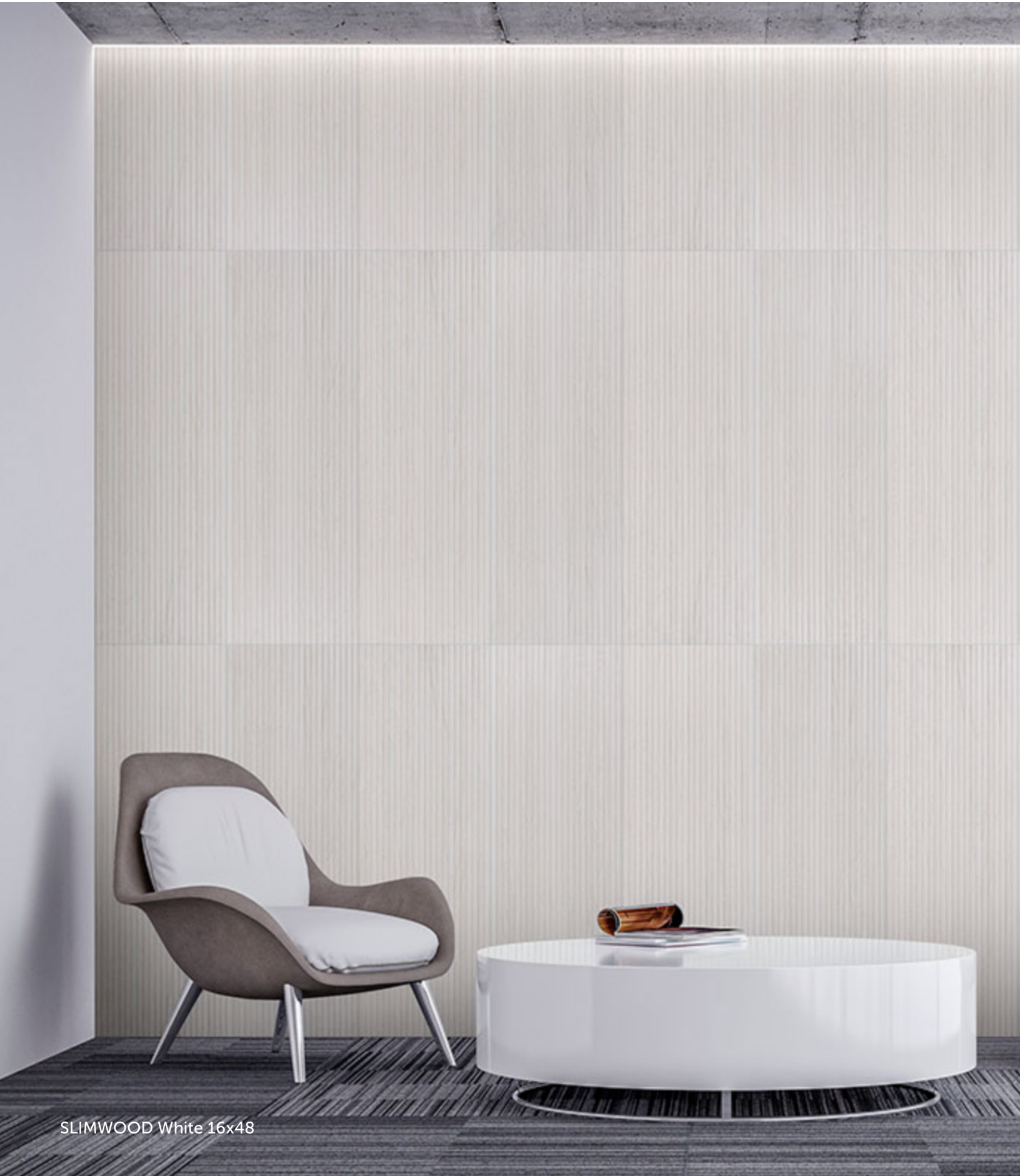
SLIMWOOD White 16x48