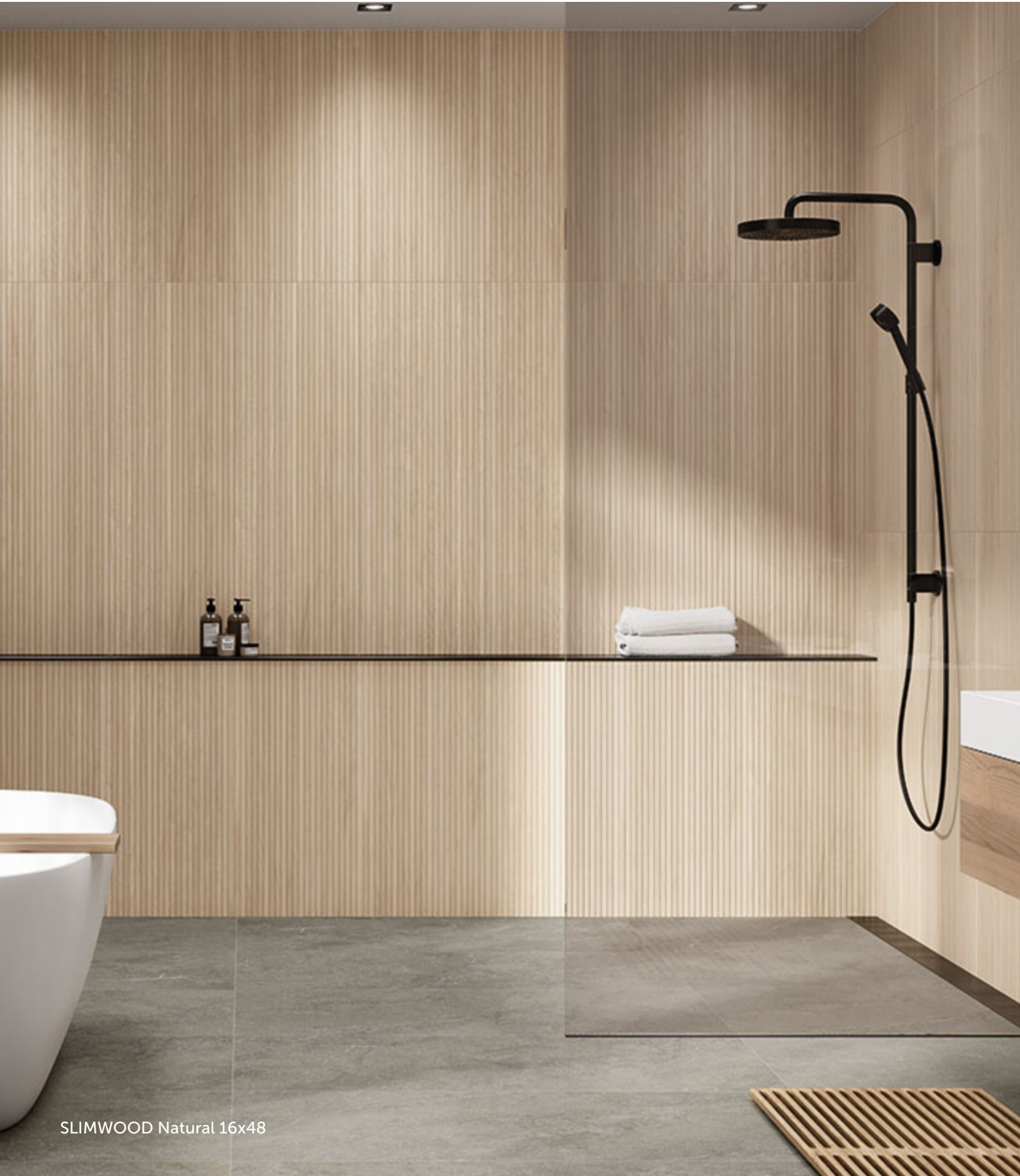
SLIMWOOD Natural 16x48