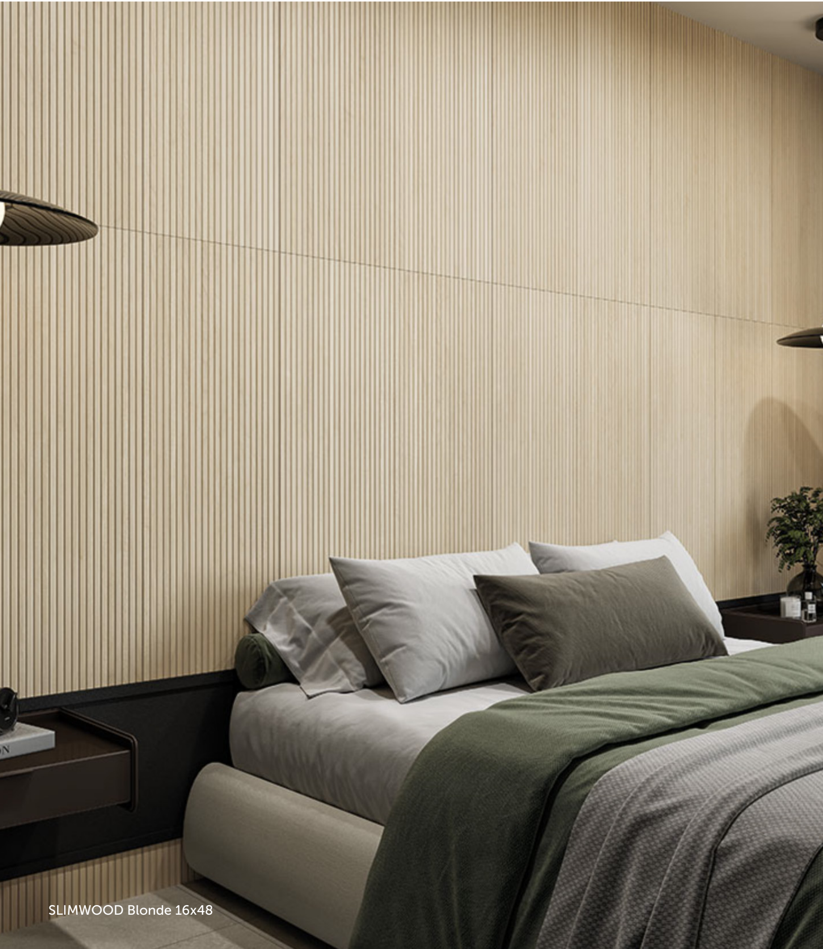
SLIMWOOD Blonde 16x48