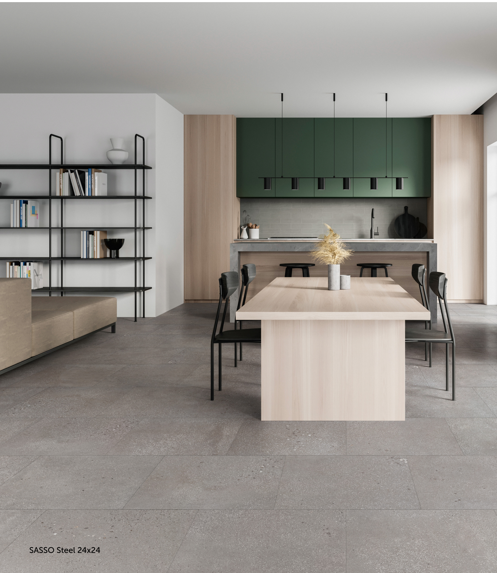
SASSO Steel 24x24