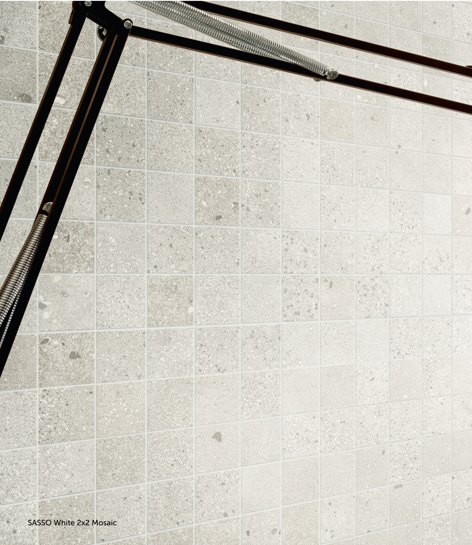
SASSO White 2x2 Mosaic