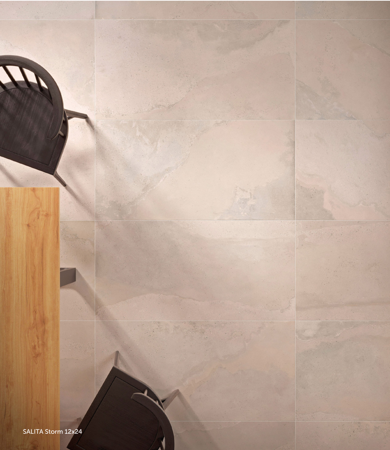
SALITA Storm 12x24