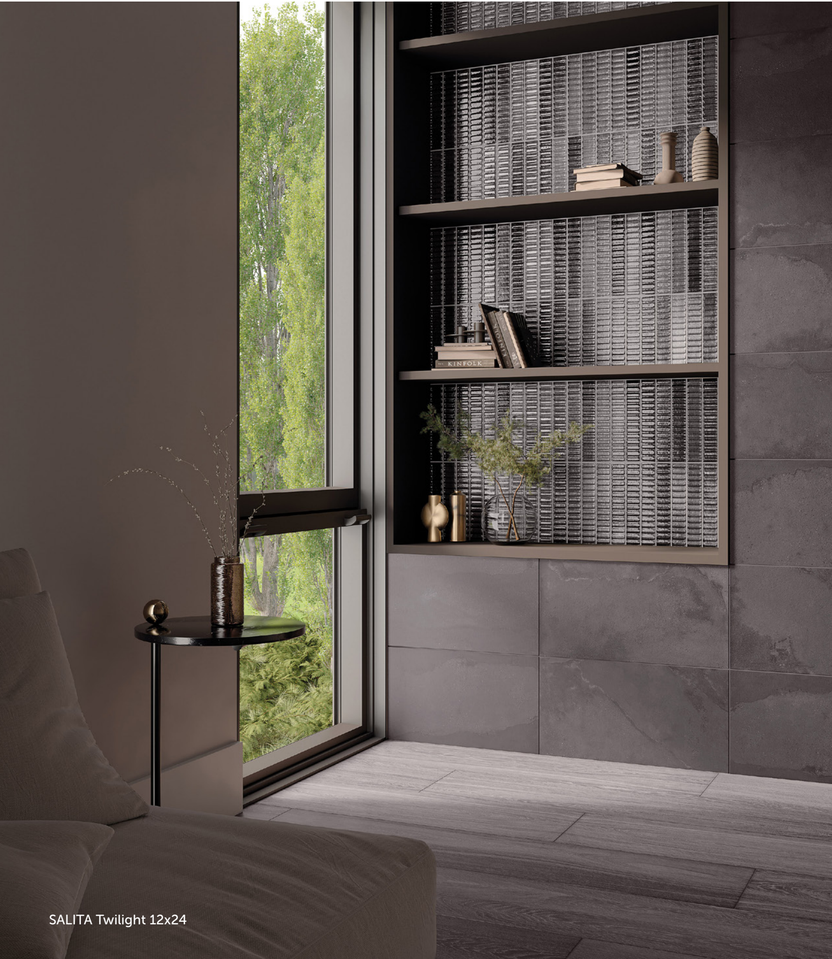
SALITA Twilight 12x24