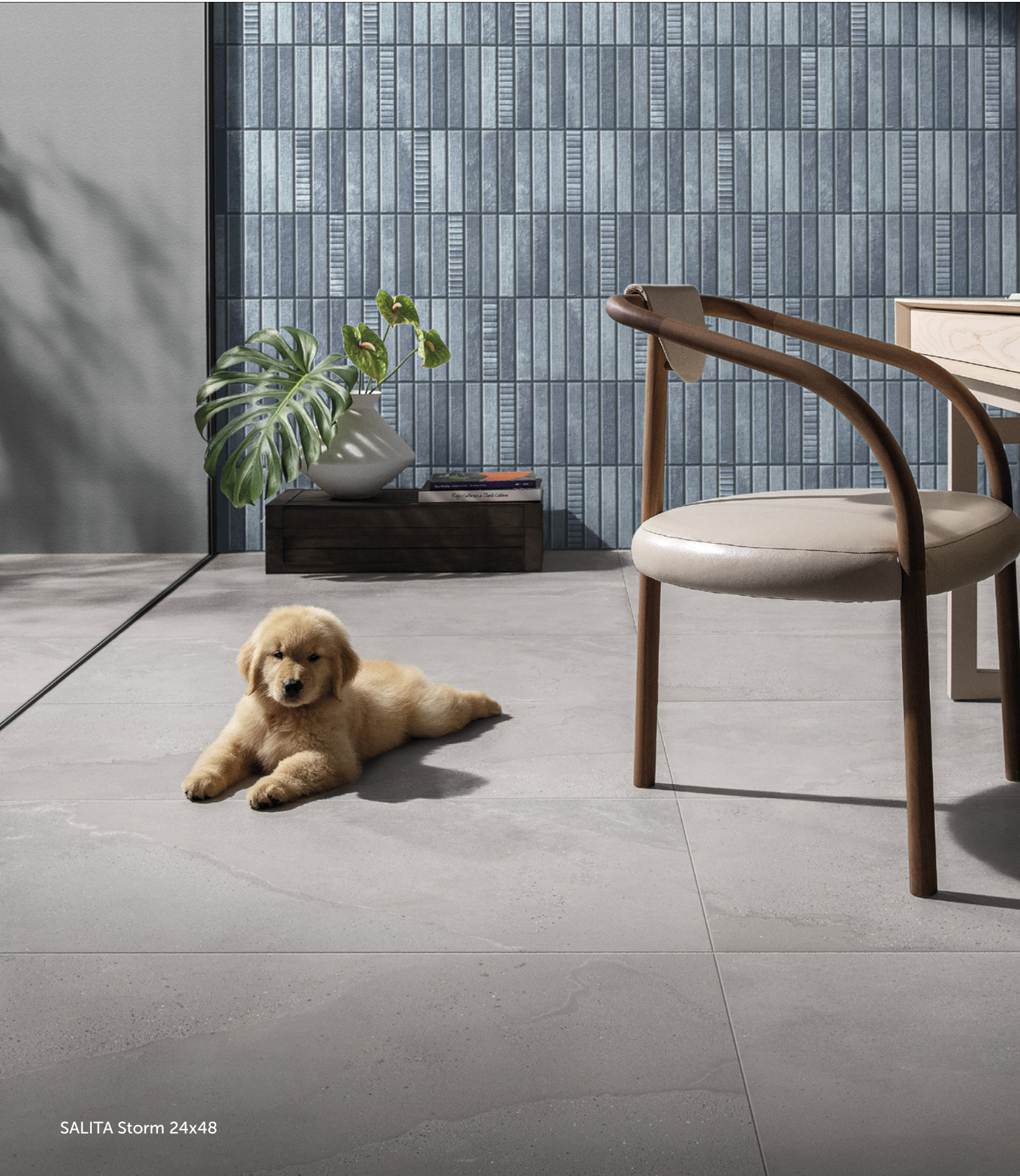
SALITA Storm 24x48