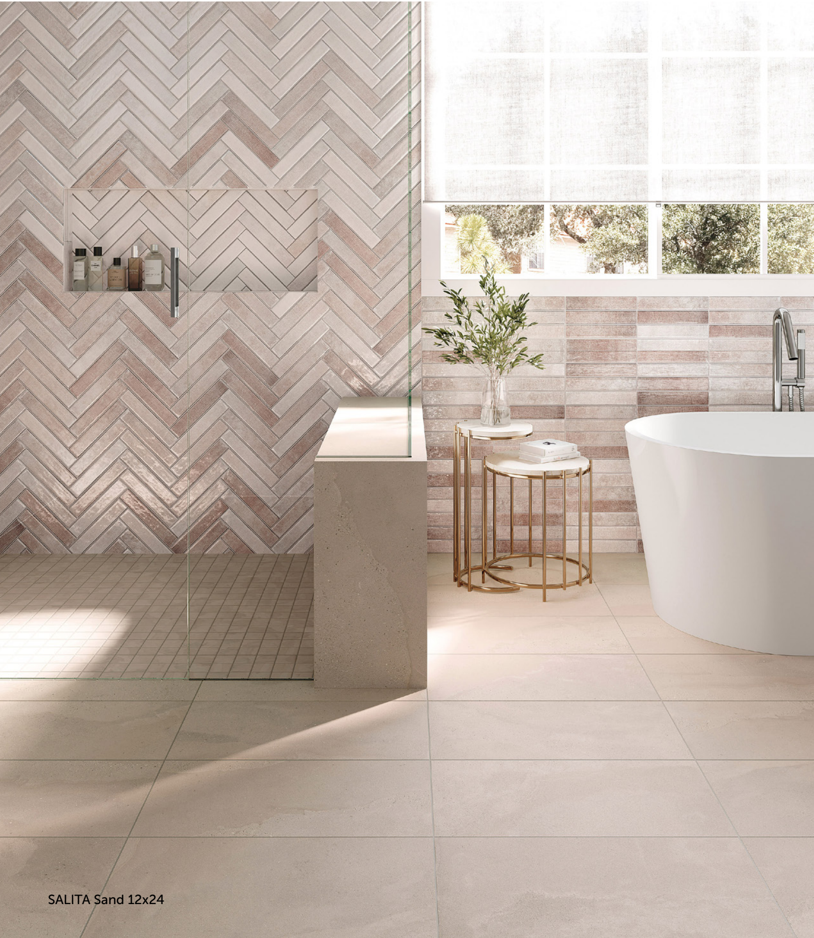
SALITA Sand 12x24