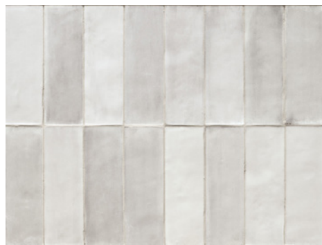
Fog (16 Piece Panel)