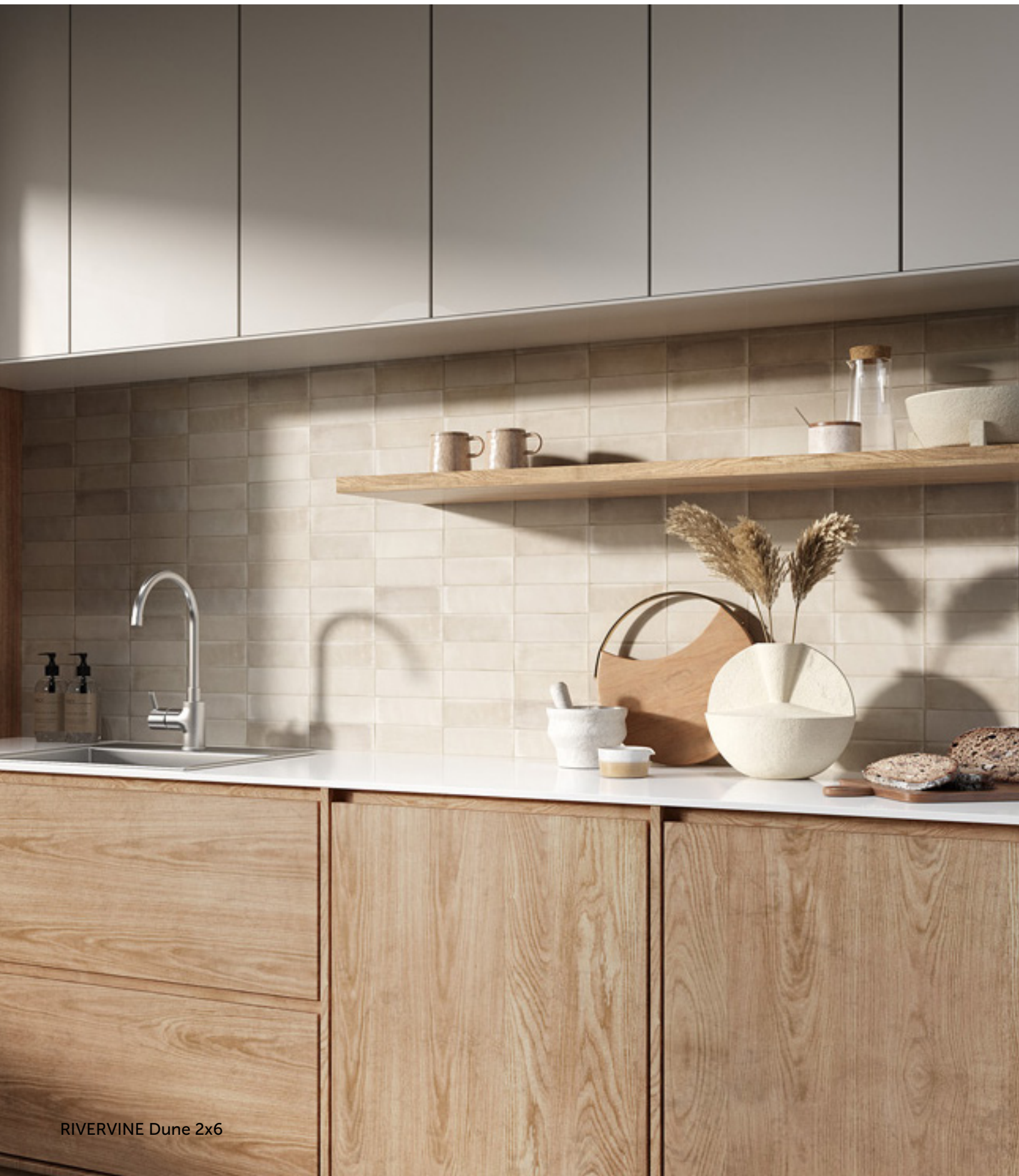
RIVERVINE Dune 2x6