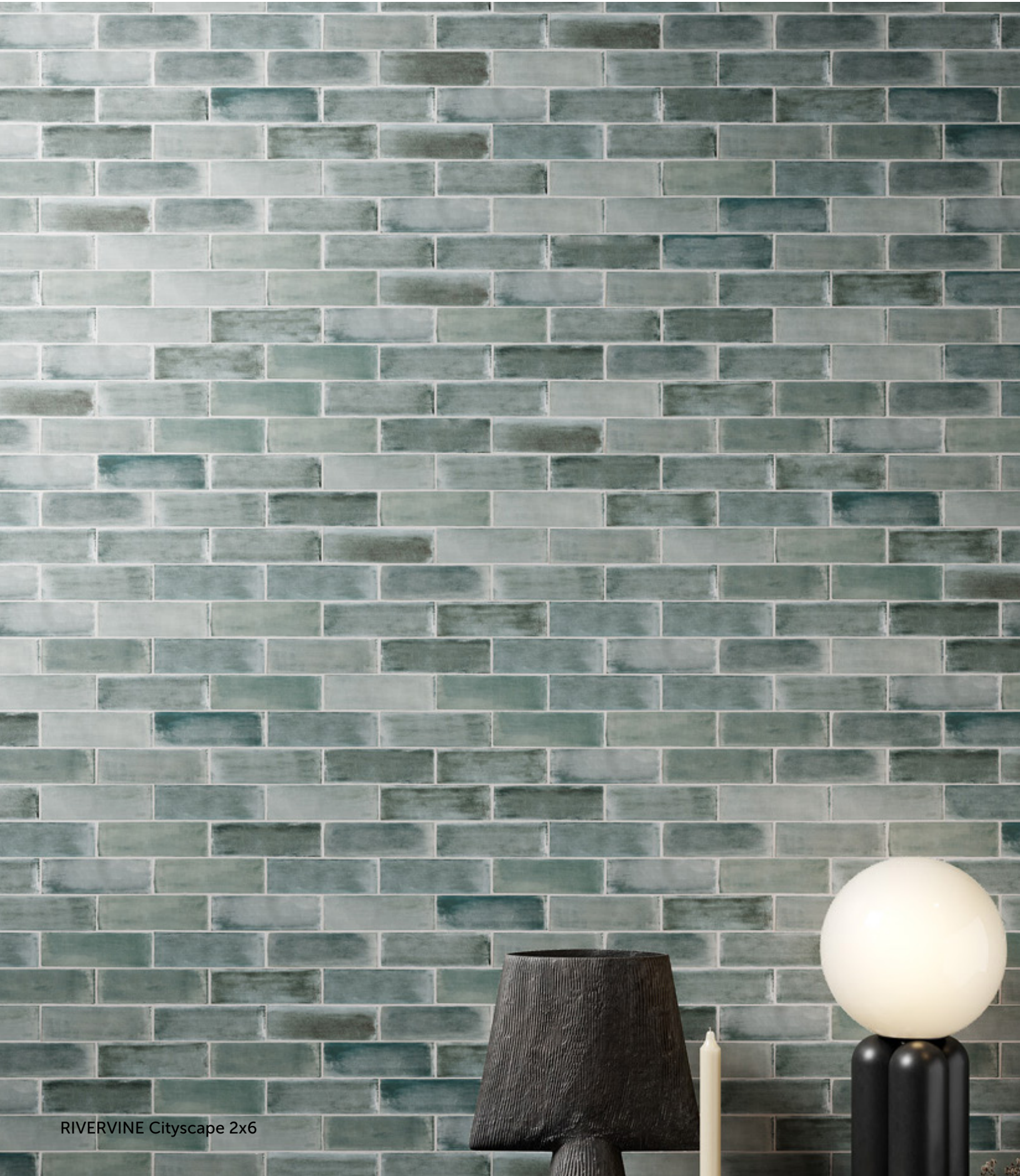
RIVERVINE Cityscape 2x6