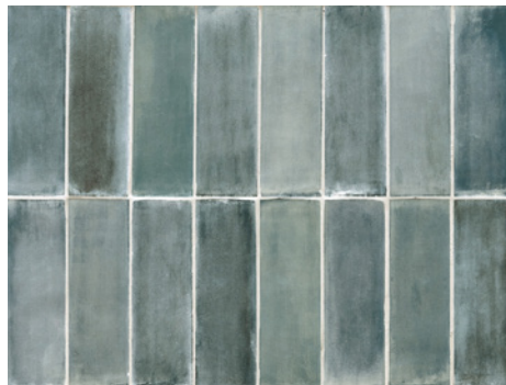
Cityscape (16 Piece Panel)