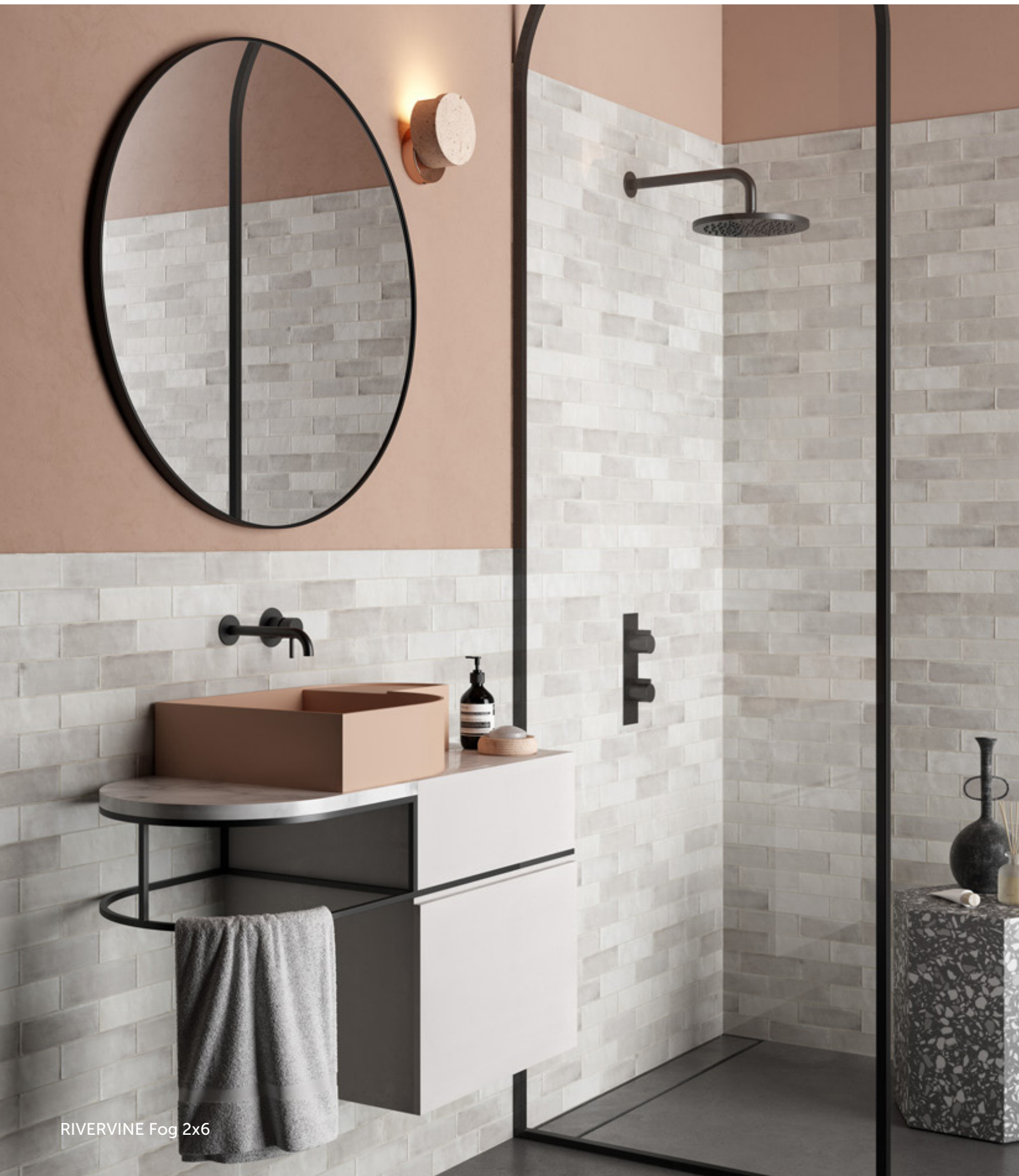
RIVERVINE Fog 2x6