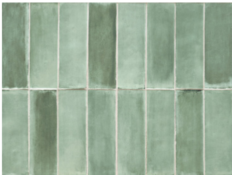
Garden (16 Piece Panel)