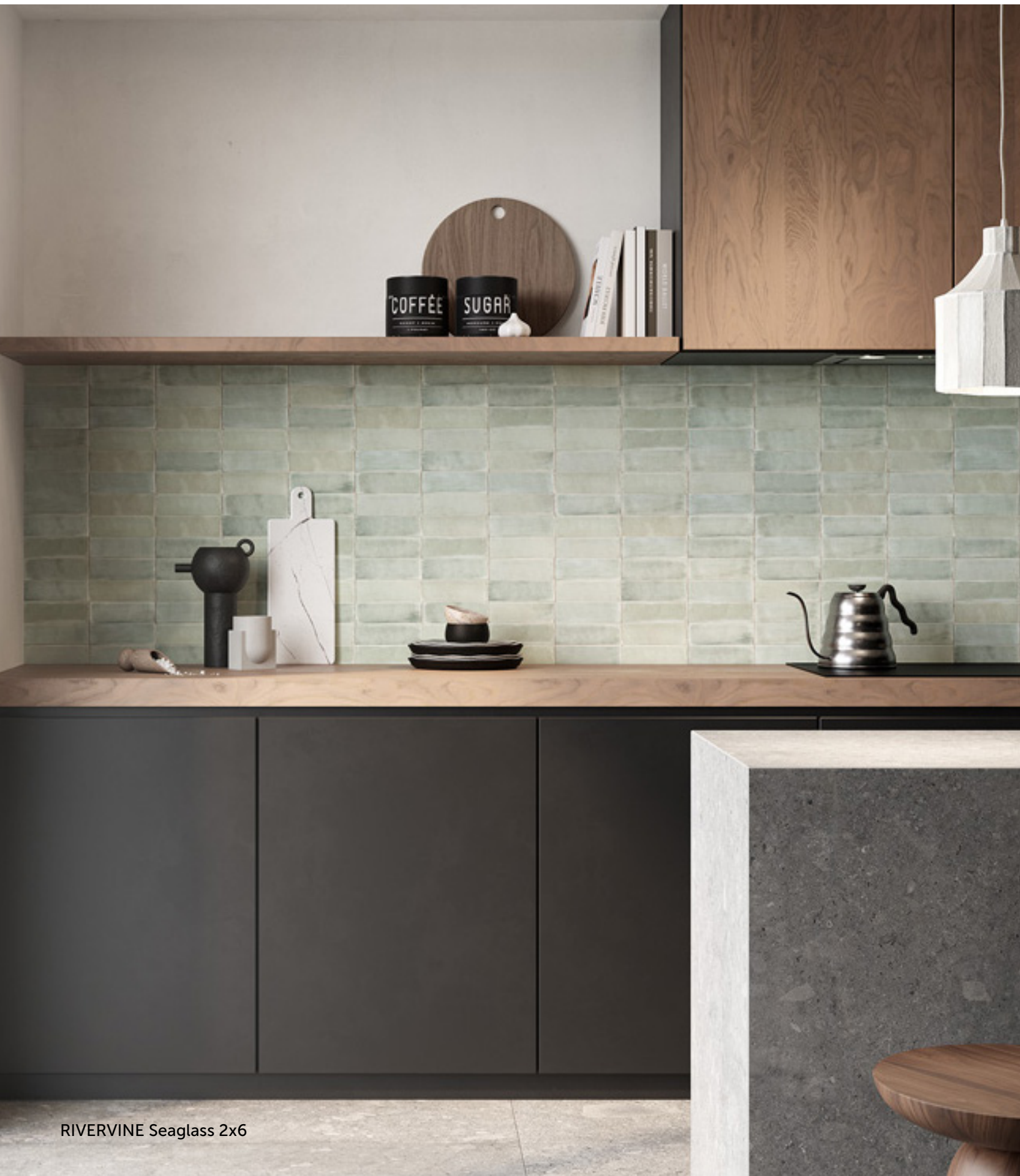
RIVERVINE Seaglass 2x6