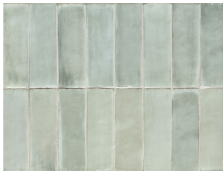
Sea Glass (16 Piece Panel)