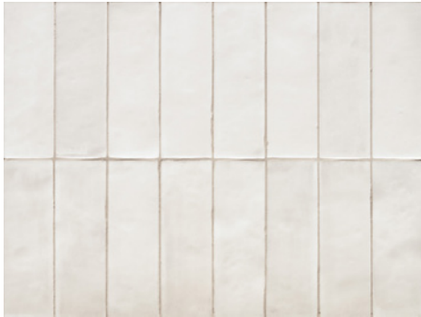
Blanc (16 Piece Panel)