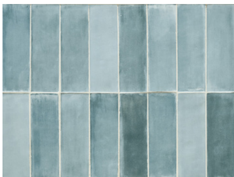
Water (16 Piece Panel)