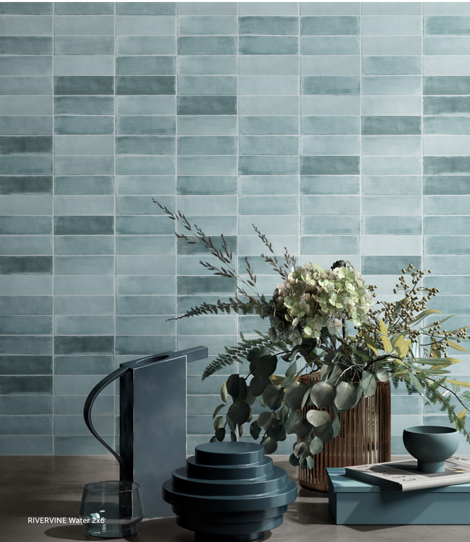
RIVERVINE Water 2x6