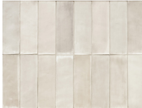
Dune (16 Piece Panel)