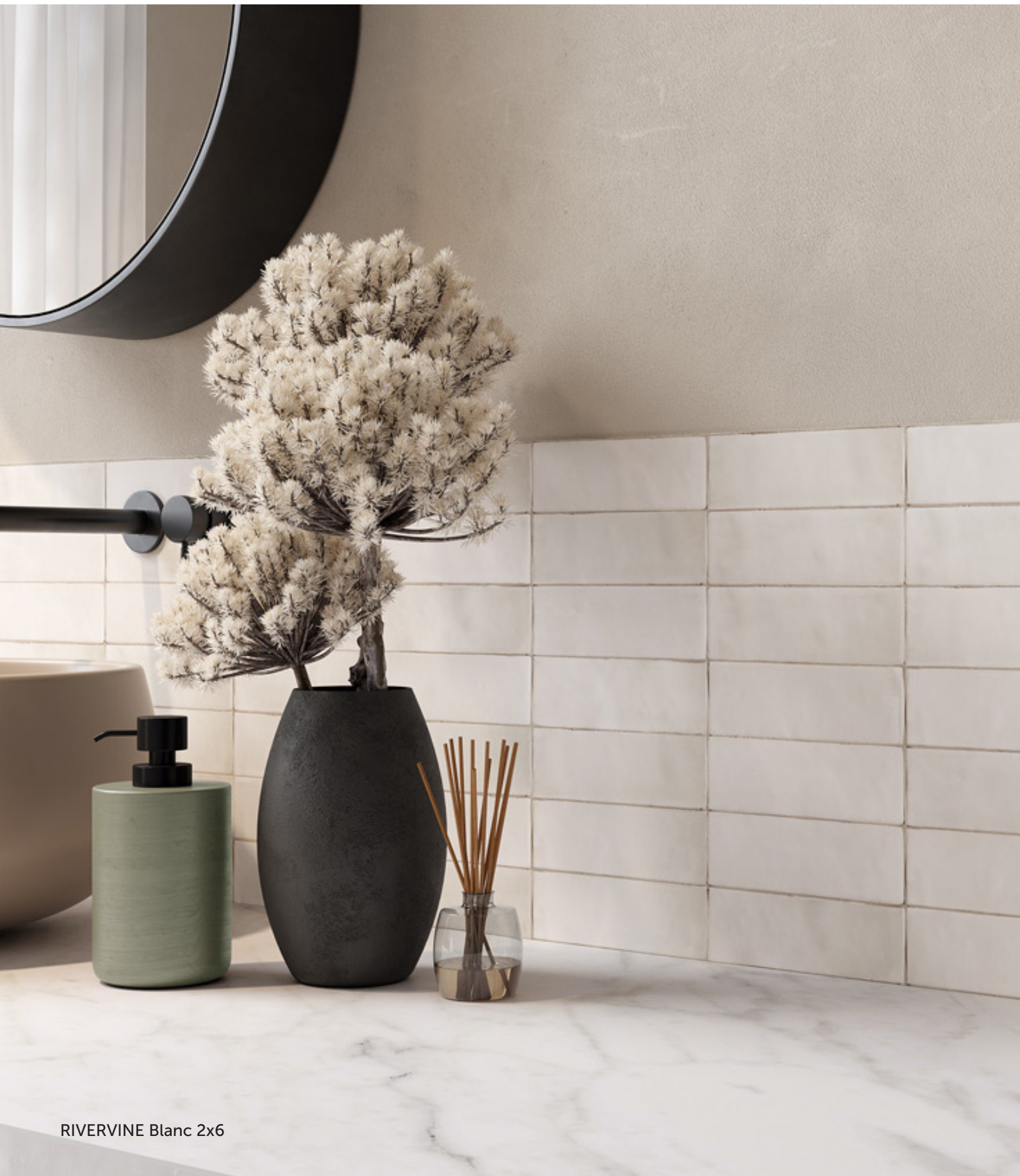
RIVERVINE Blanc 2x6