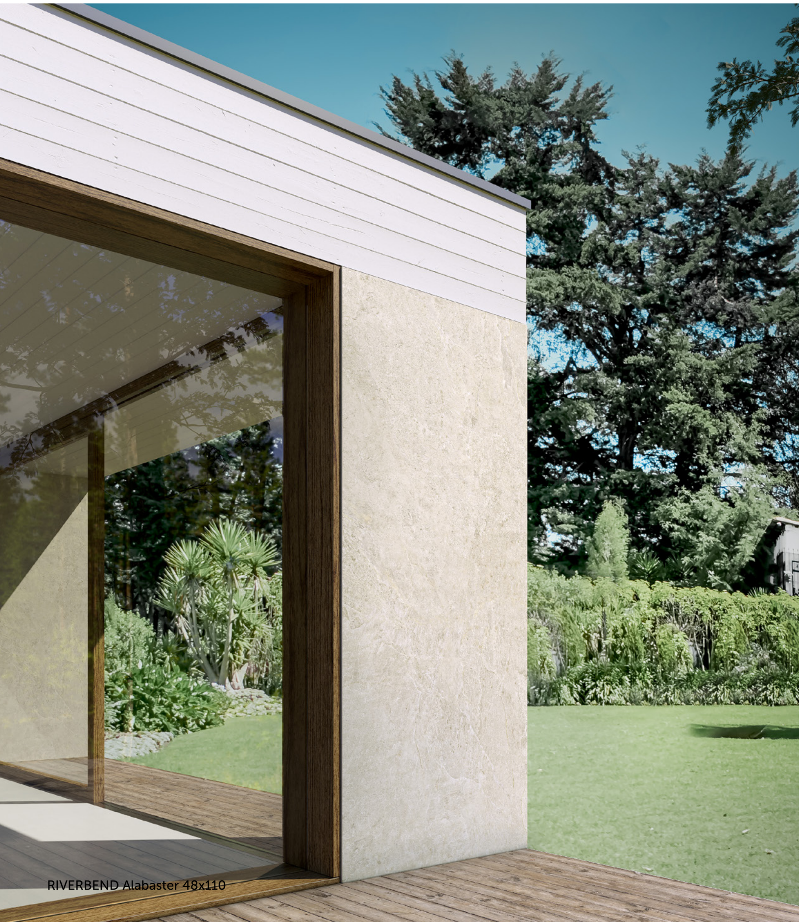
RIVERBEND Alabaster 48x110