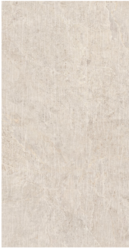
Alabaster Waved Deco Slab