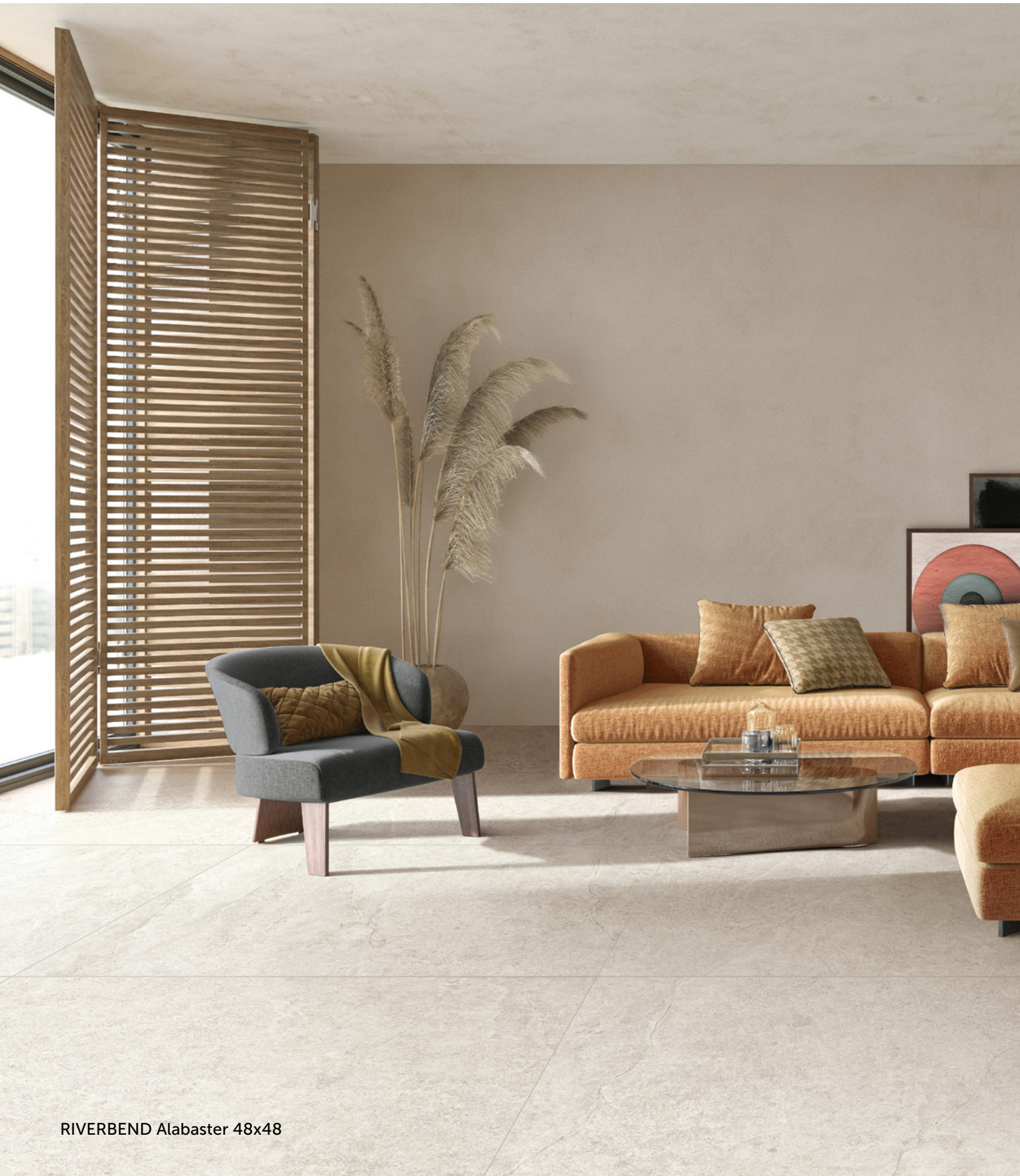
RIVERBEND Alabaster 48x48