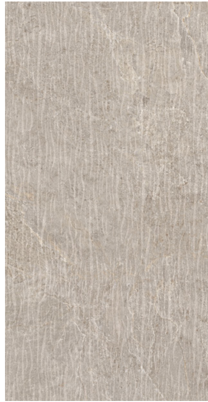
Pewter Waved Deco Slab