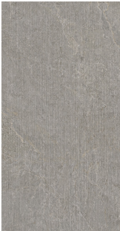
Millstone Carved Deco Slab