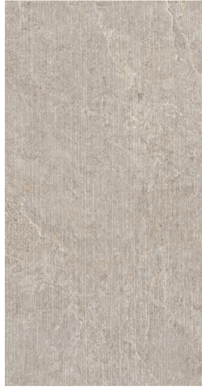
Pewter Carved Deco Slab