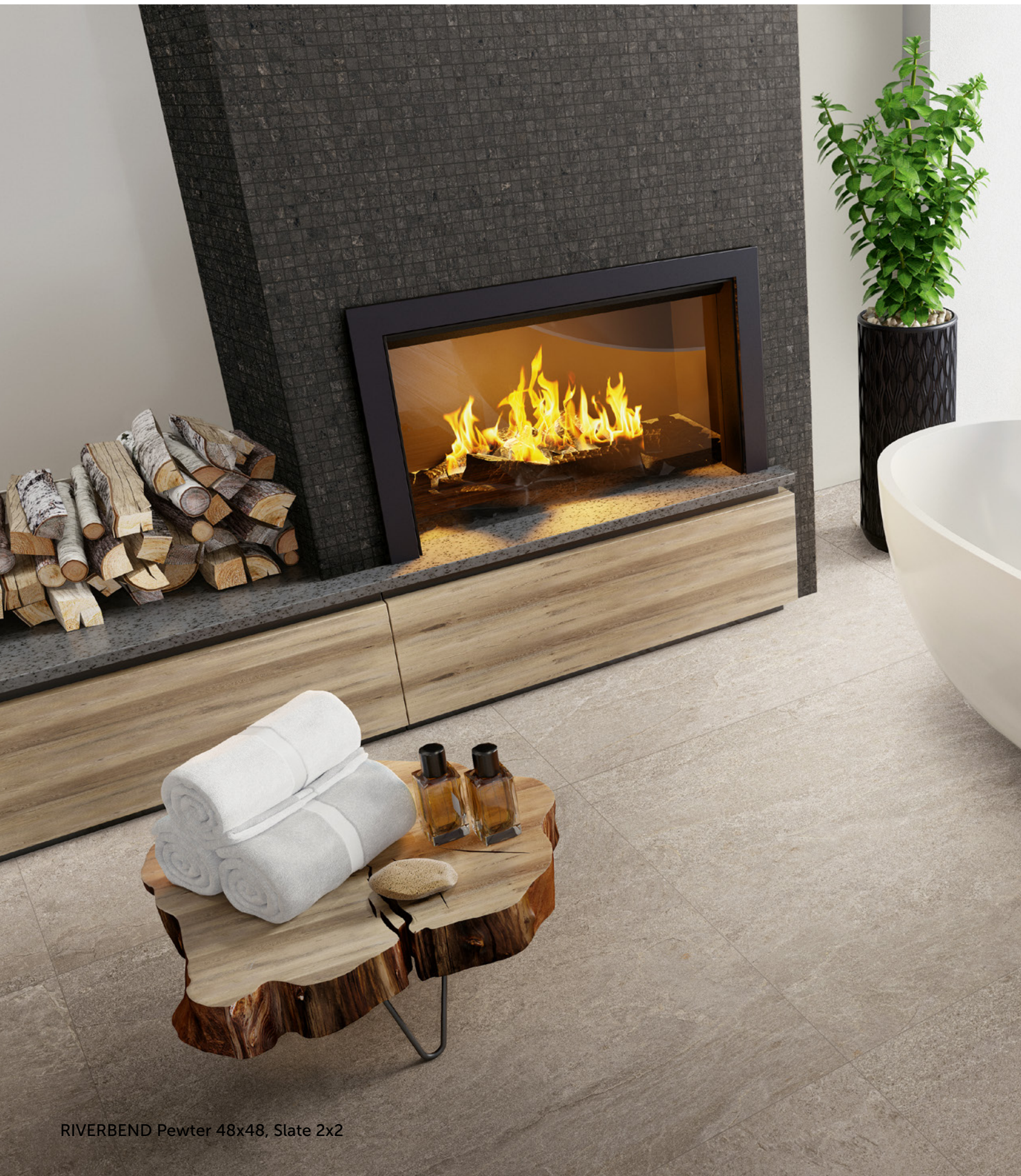
RIVERBEND Pewter 48x48, Slate 2x2