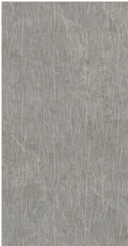
Millstone Waved Deco Slab