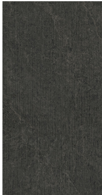
Slate Carved Deco Slab