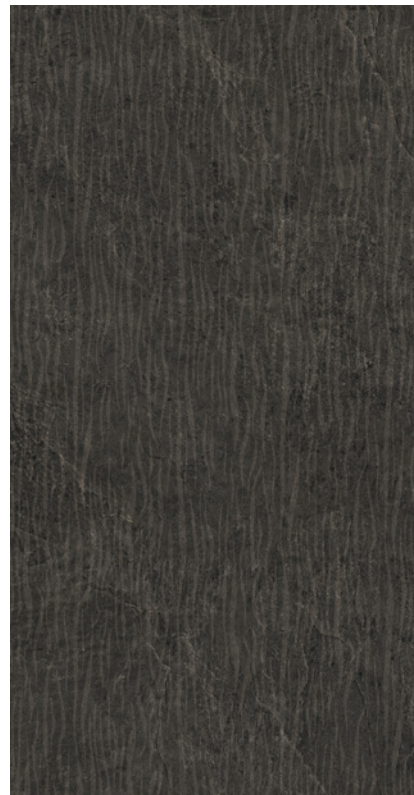
Slate Waved Deco Slab