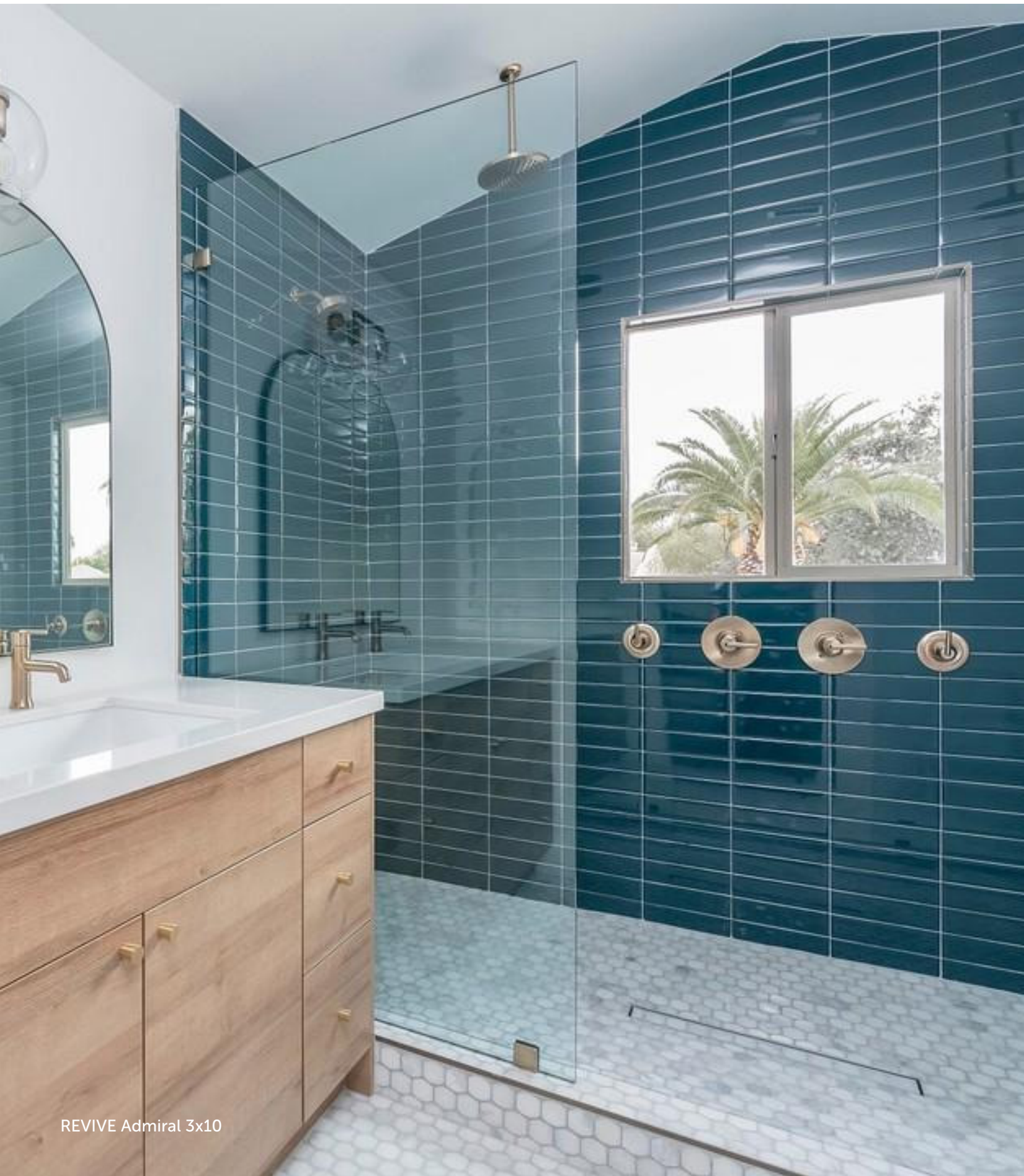
REVIVE Admiral 3x10