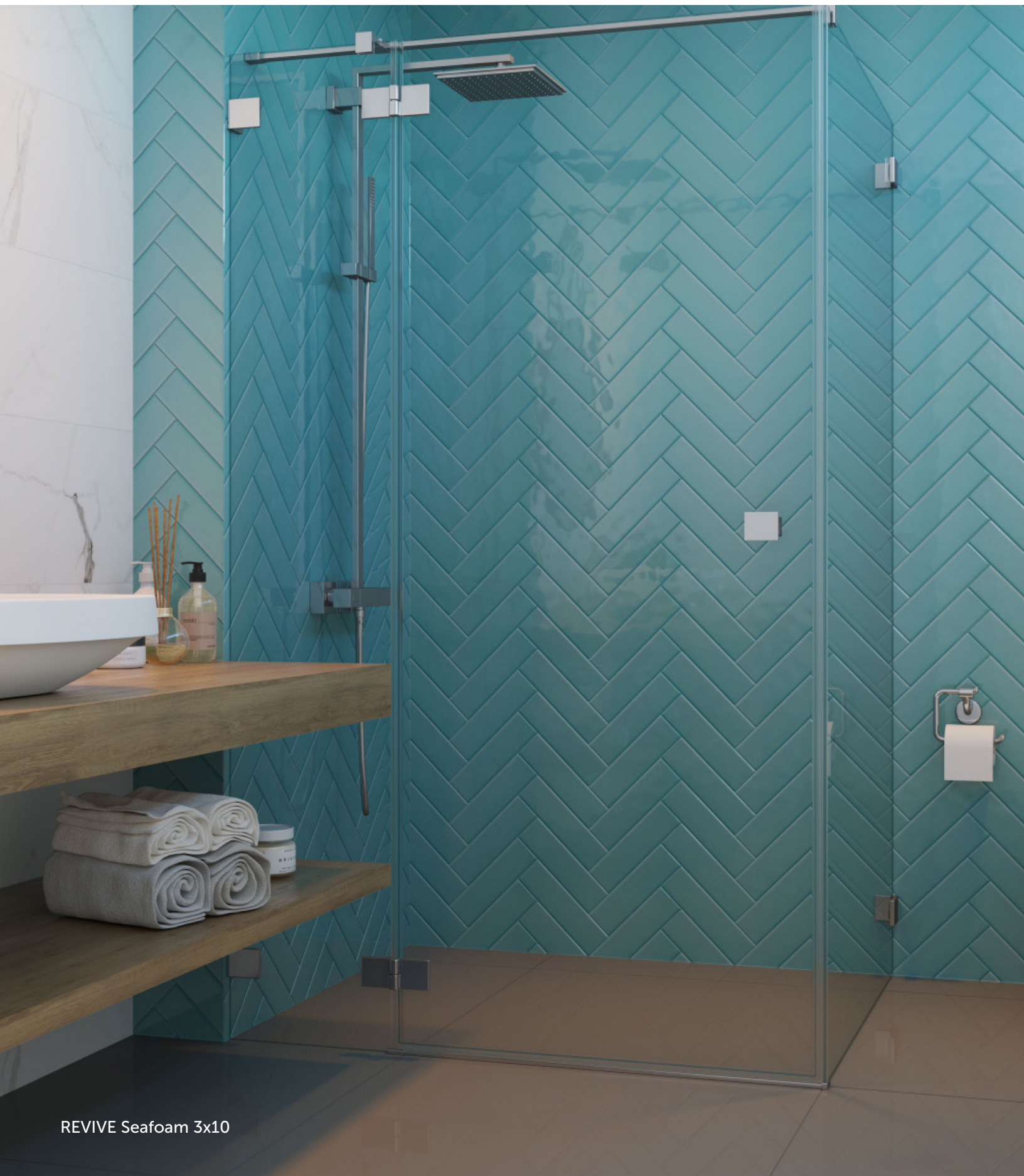
REVIVE Seafoam 3x10