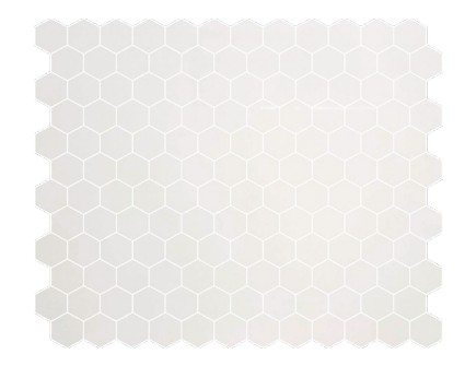
Penny Hex Mosaic