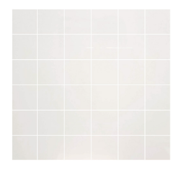
2" Hex Mosaic