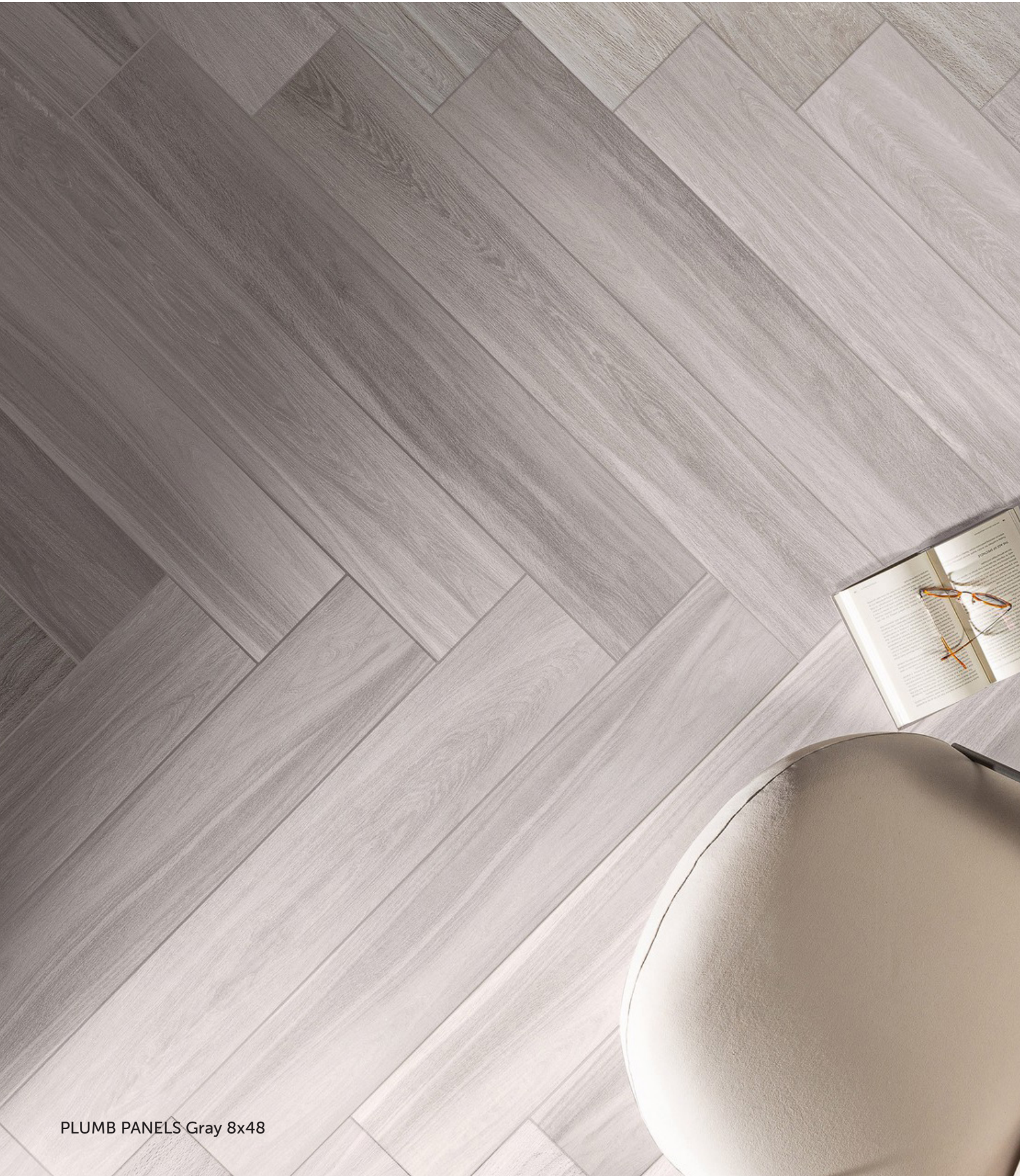
PLUMB PANELS Gray 8x48