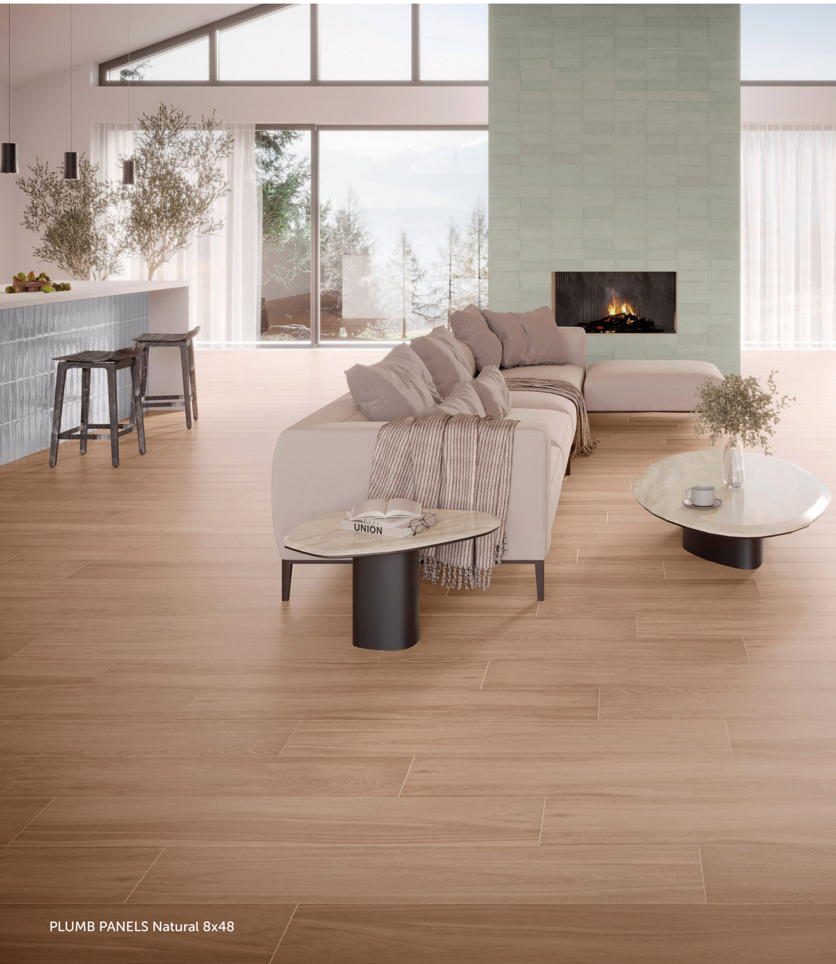
PLUMB PANELS Natural 8x48