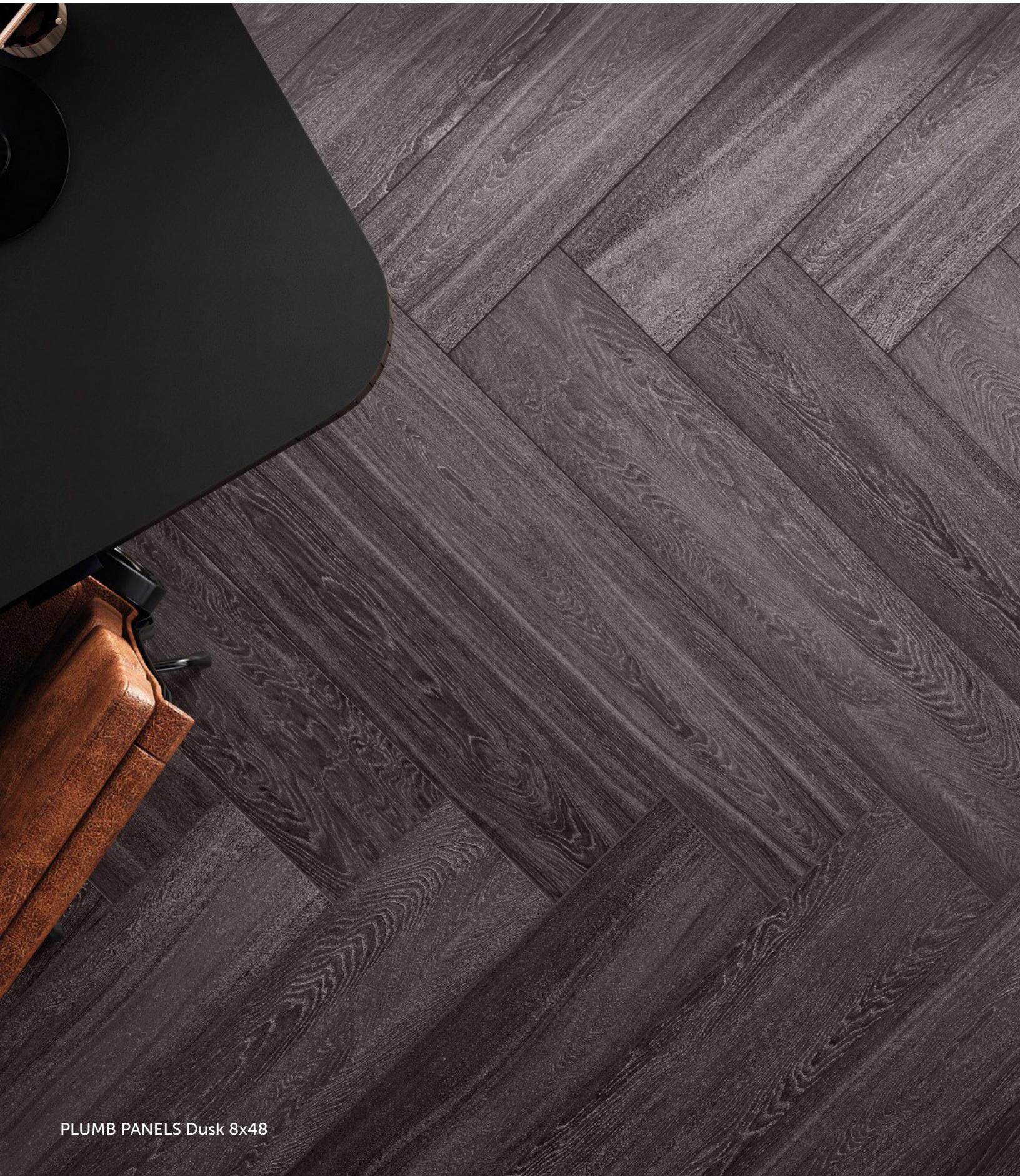
PLUMB PANELS Dusk 8x48