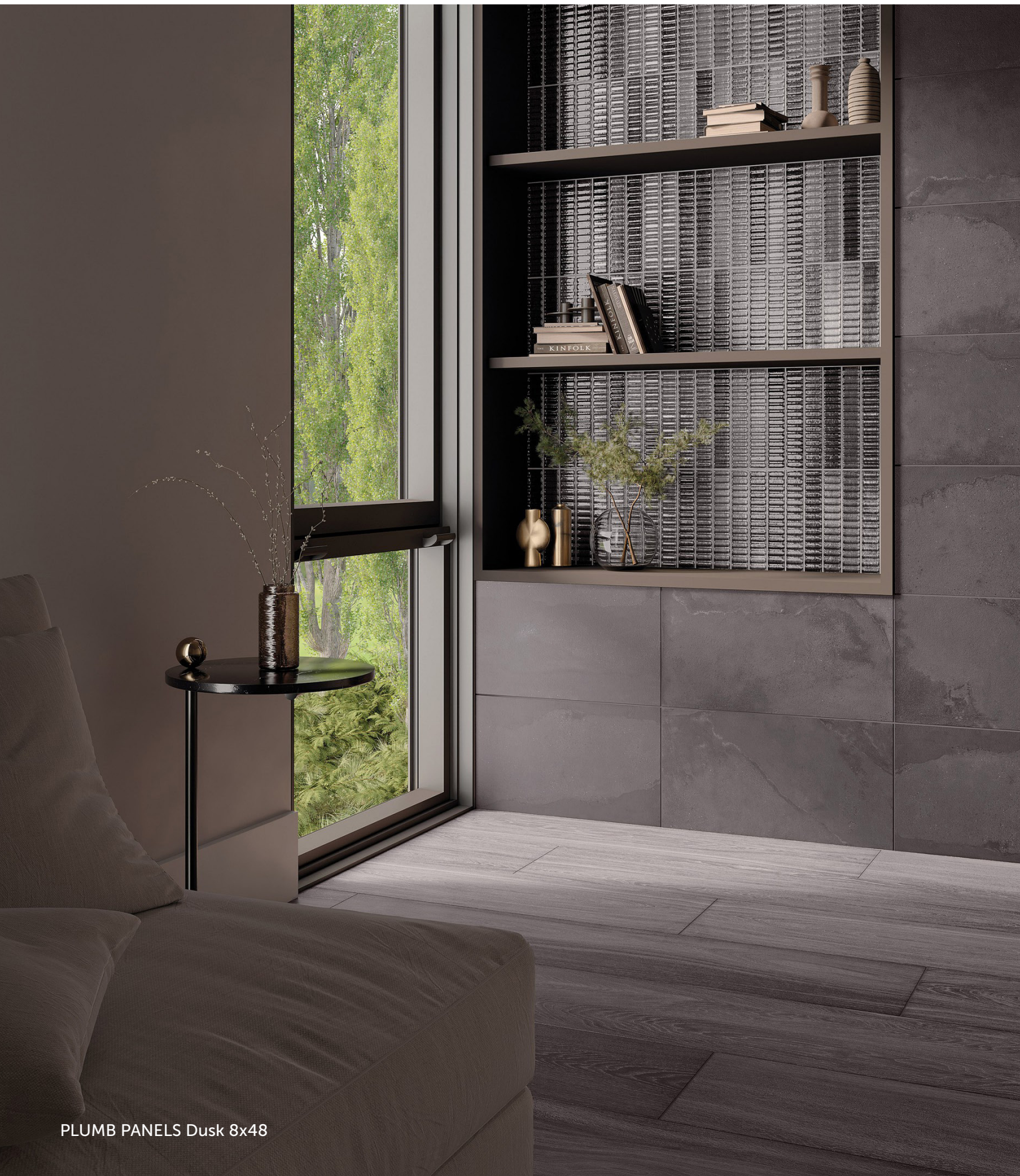
PLUMB PANELS Dusk 8x48