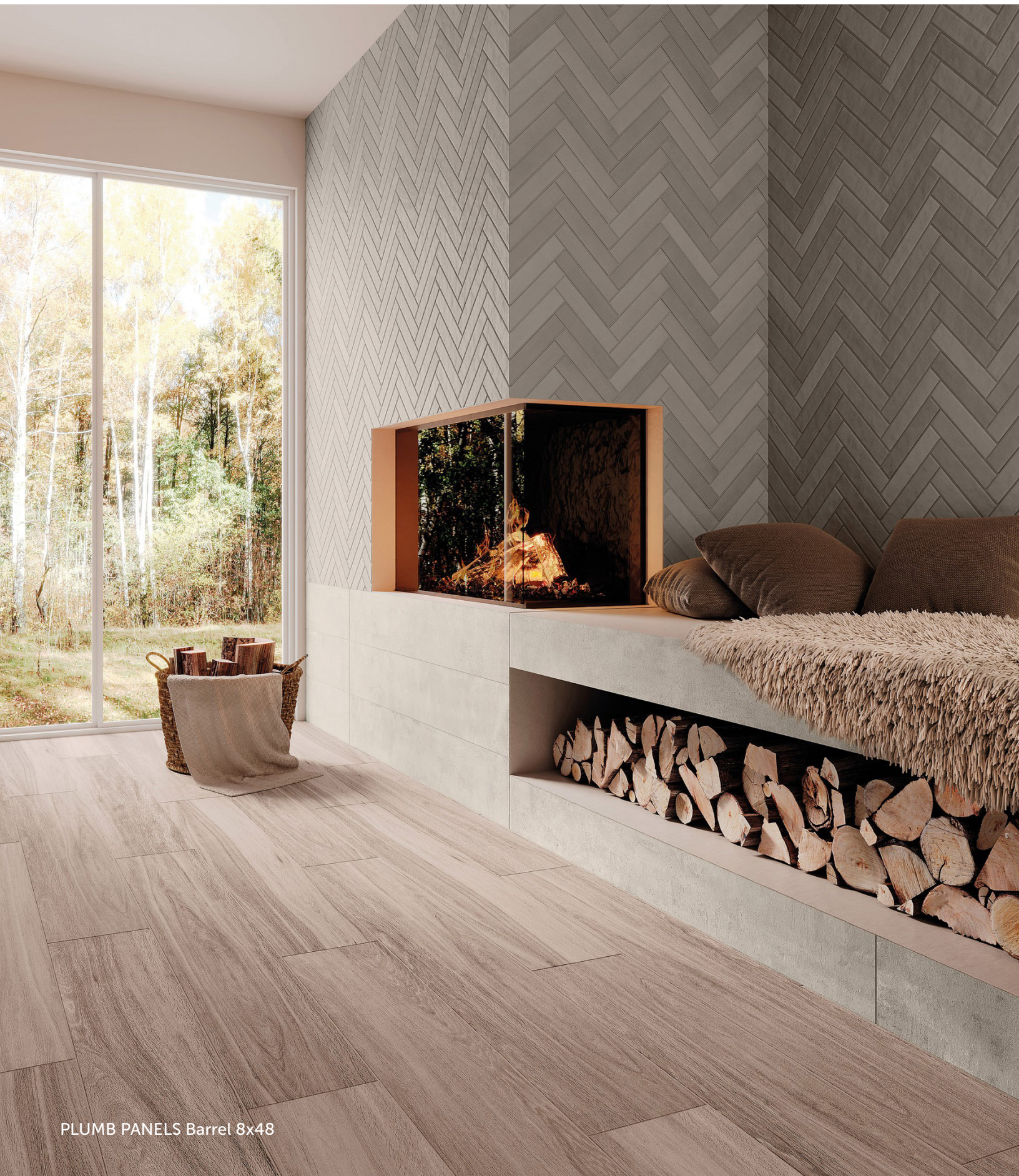
PLUMB PANELS Barrel 8x48