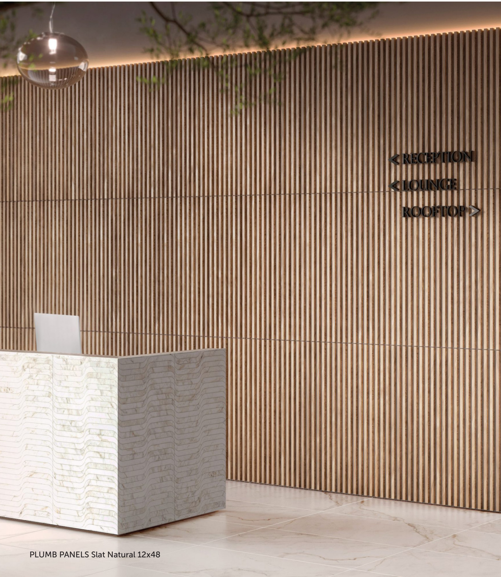
PLUMB PANELS Slat Natural 12x48