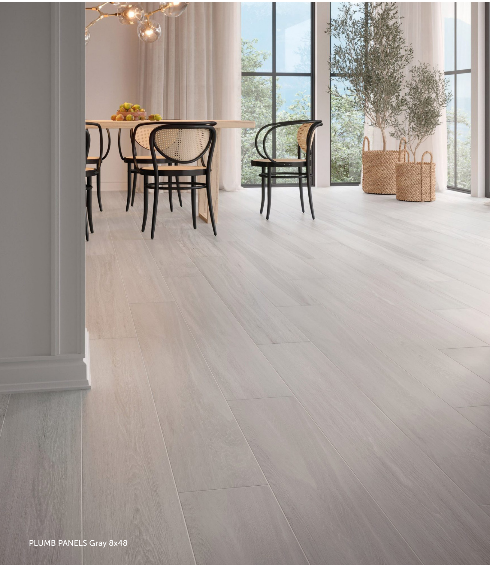
PLUMB PANELS Gray 8x48