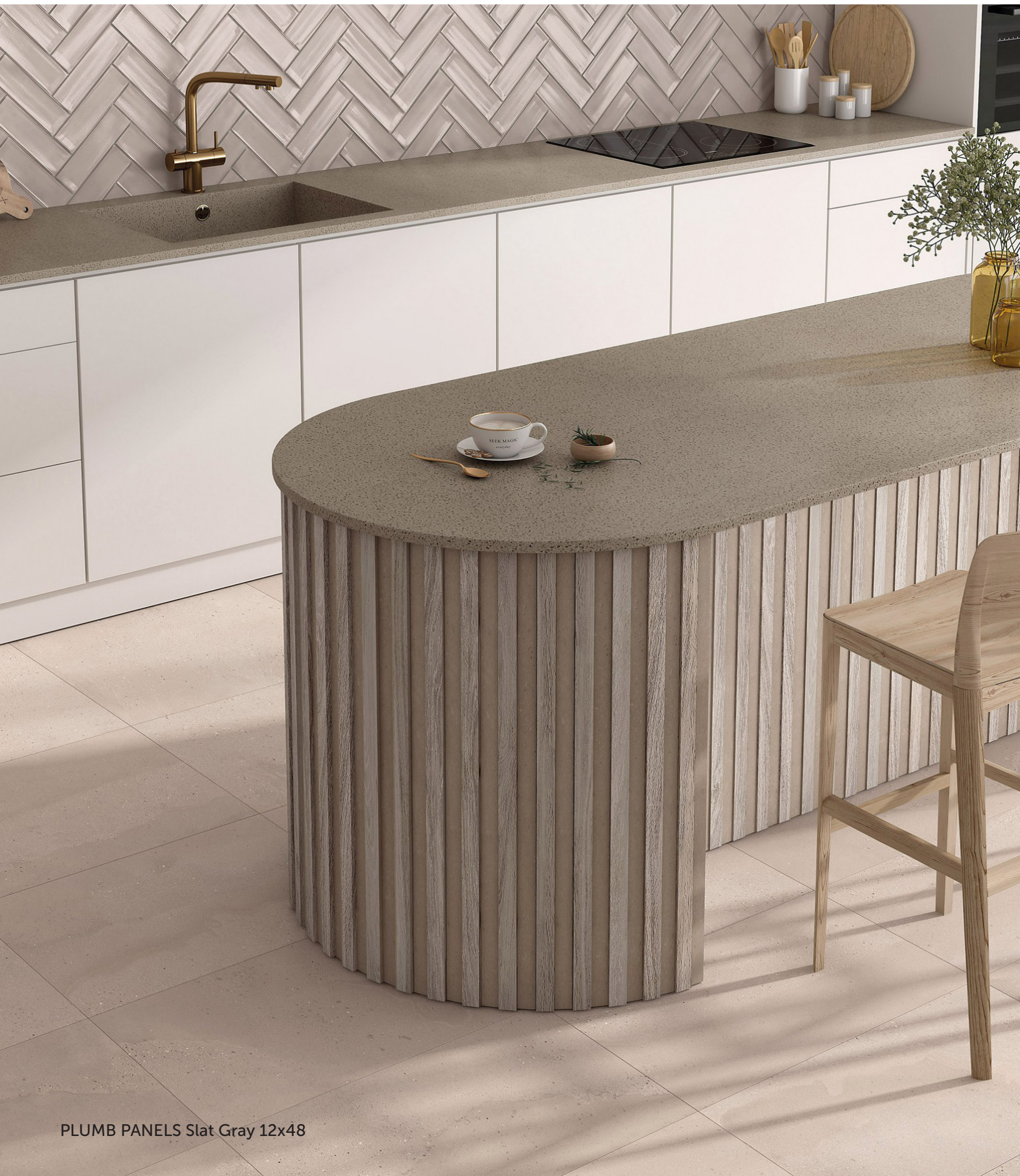
PLUMB PANELS Slat Gray 12x48