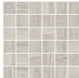
Grey - 2x2