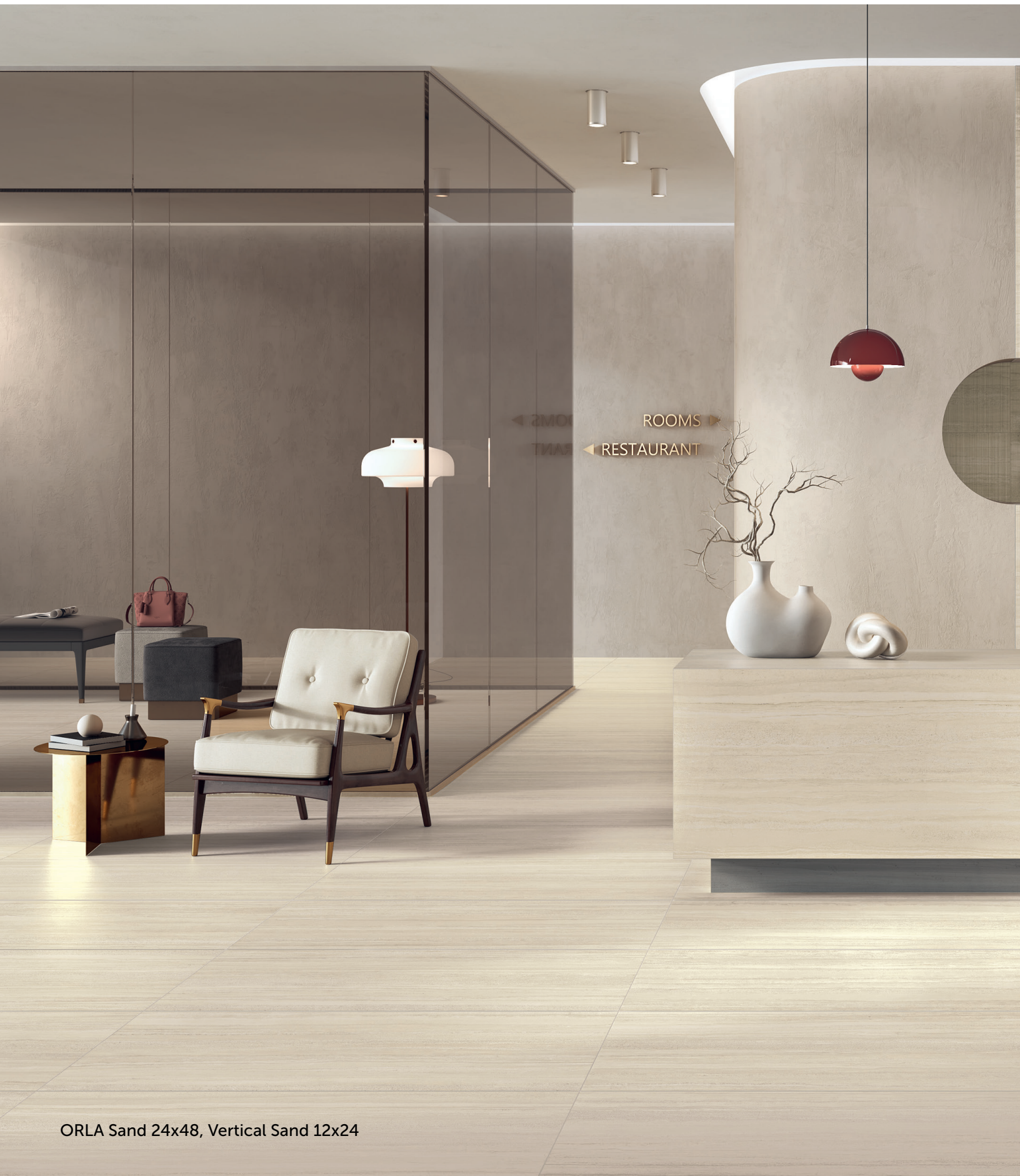
ORLA Sand 24x48, Vertical Sand 12x24