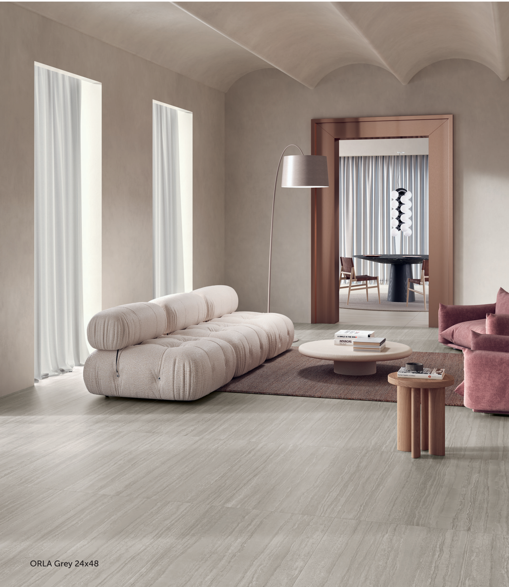
ORLA Grey 24x48