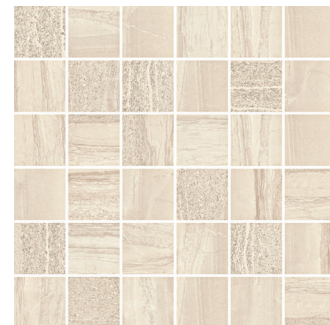
Sand - 2x2