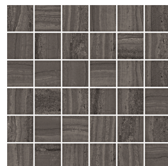
Dark Grey - 2x2