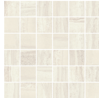
White - 2x2