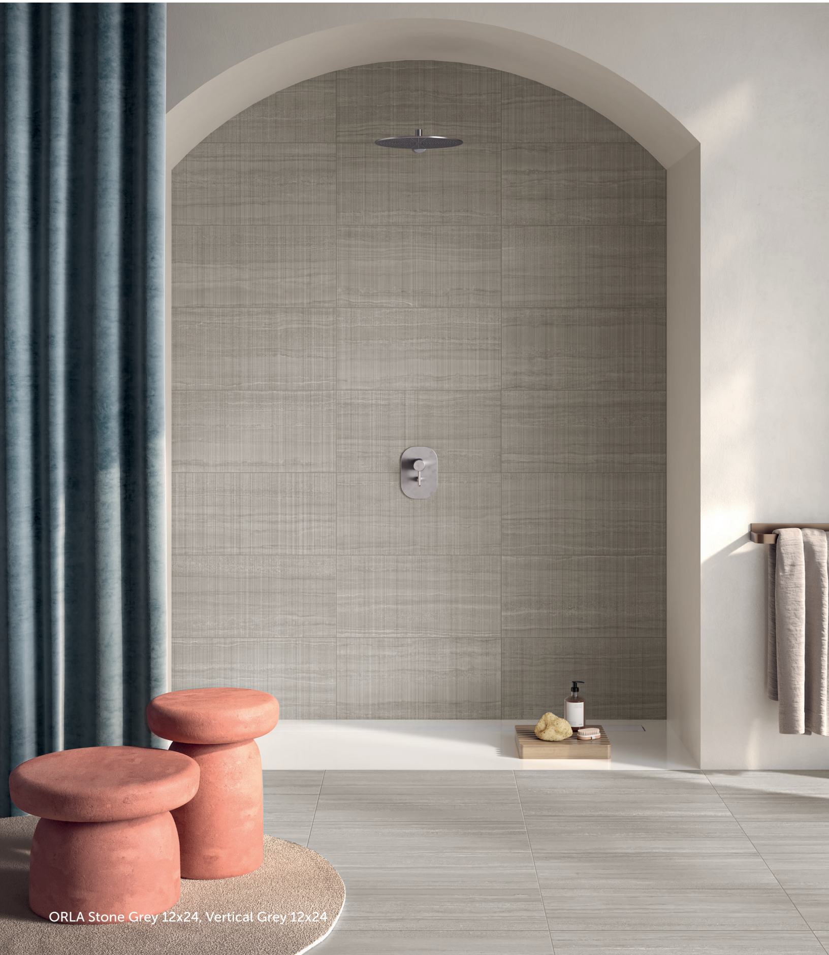
ORLA Stone Grey 12x24, Vertical Grey 12x24