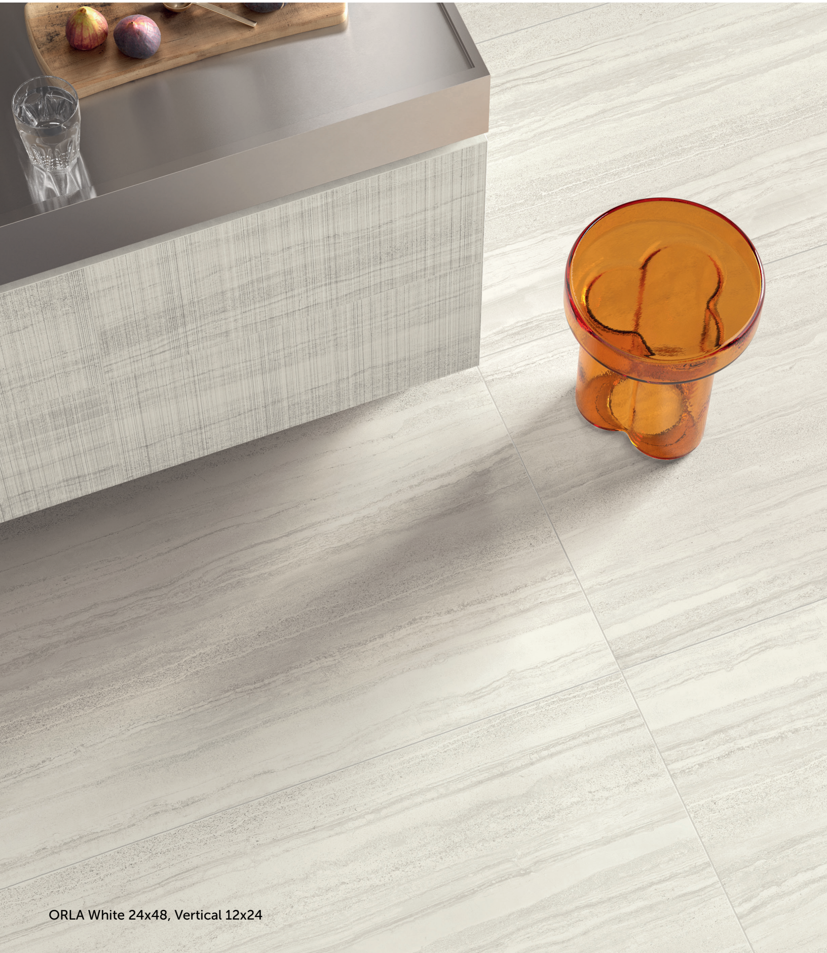
ORLA White 24x48, Vertical 12x24